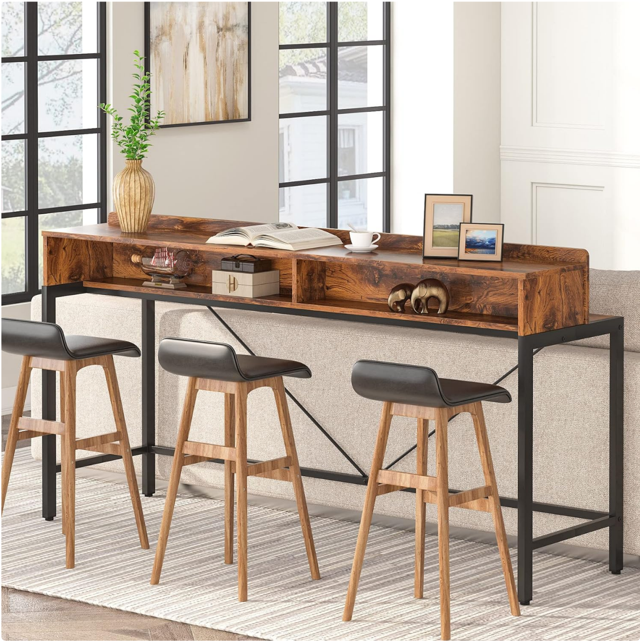
Image: The 70.9-inch Rustic Sofa Console Table in a living room setting, showcasing its length and potential use with bar stools.