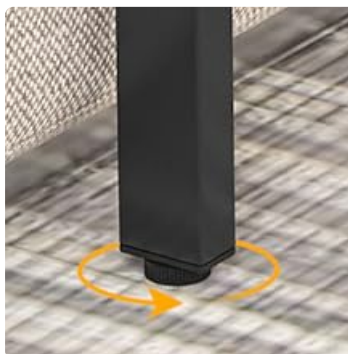
Image: Adjustable foot pads on the table legs, allowing for stability on various floor types.