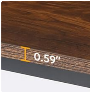
Image: A close-up view illustrating the thickness of the engineered wood tabletop.