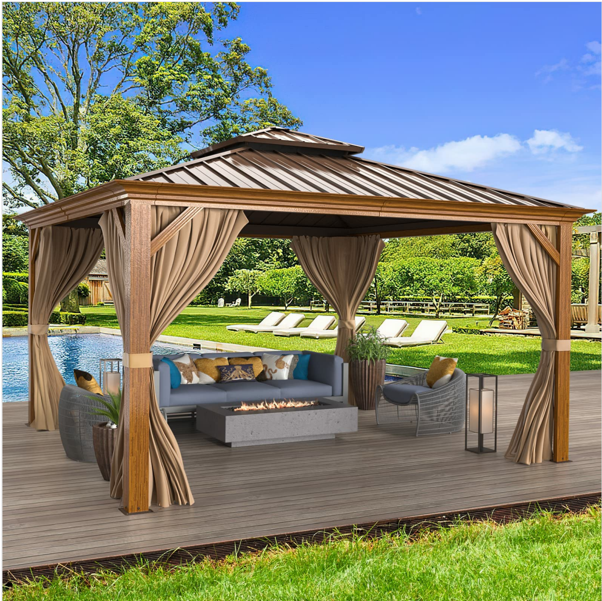
Figure 1: MELLCOM 12'x12' Hardtop Gazebo in a backyard setting.