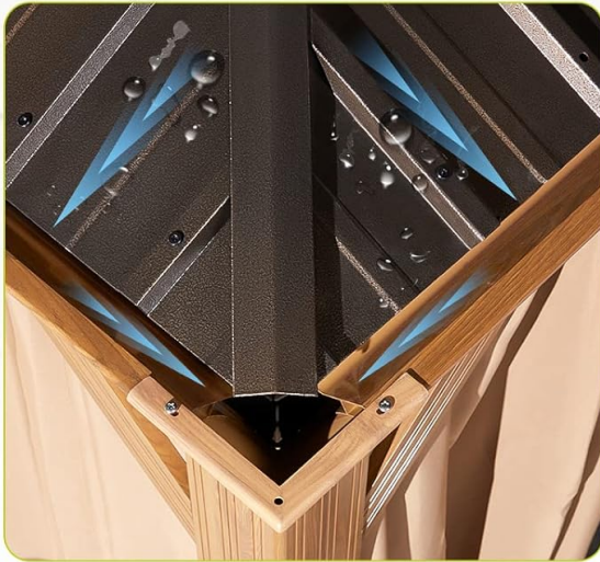
Rain Gutter Design: Ensure good drainage