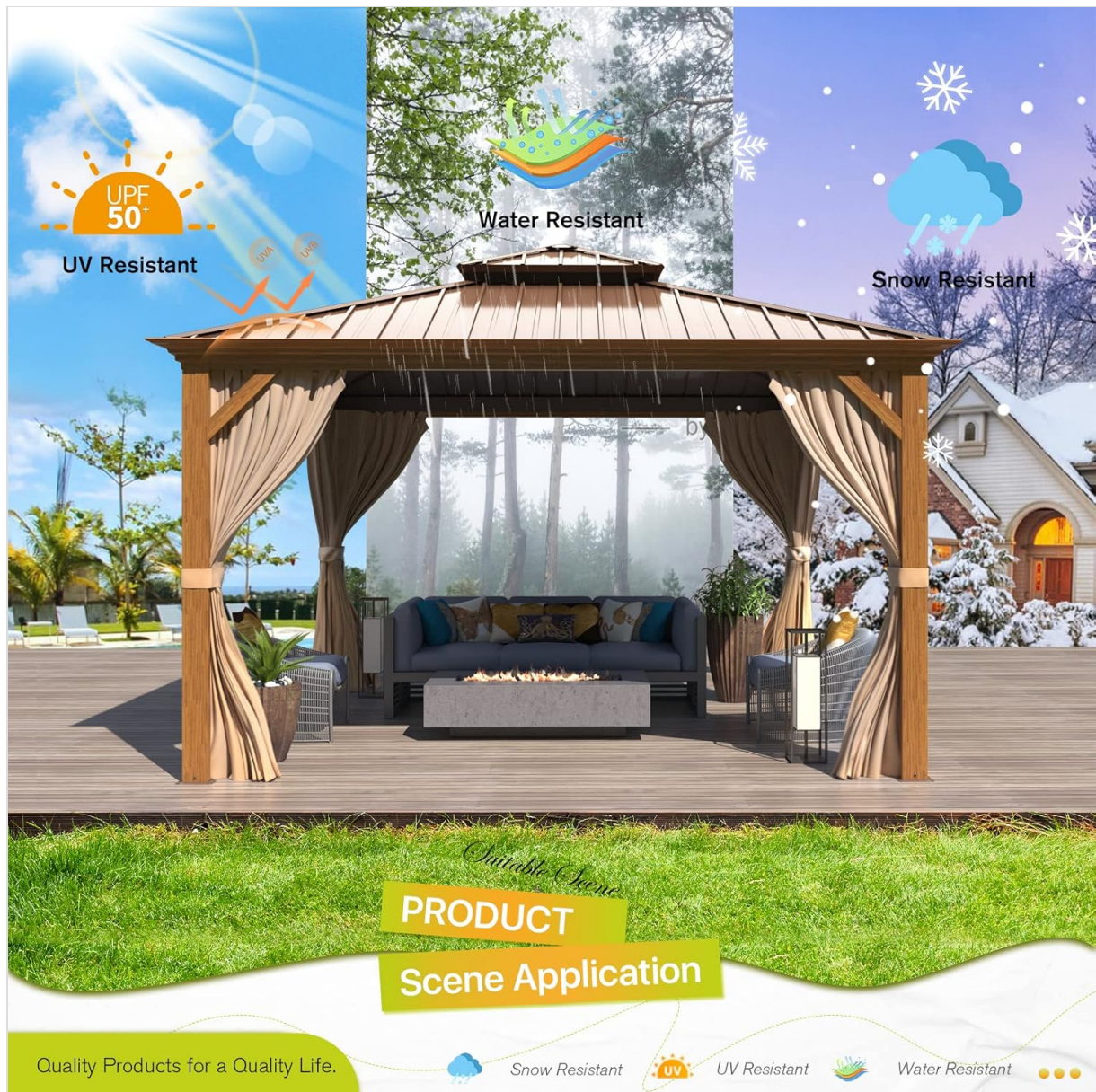
Figure 6: Gazebo features demonstrating resistance to various weather elements.