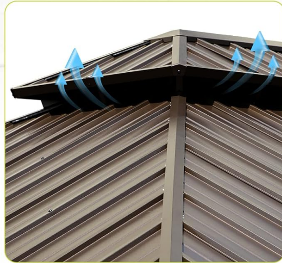
Galvanized Steel Roof: Block harmful UV rays