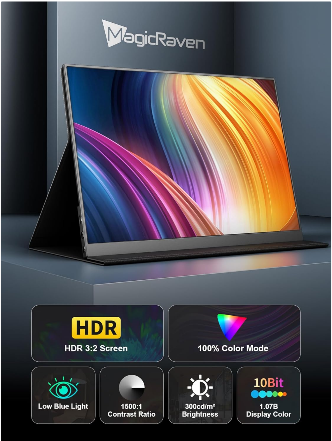
Image: The MAGICRAVEN 16" 2.5K Portable Monitor with its magnetic cover, showcasing its sleek design.

Video: An official MAGICRAVEN video demonstrating the unboxing and initial setup of the portable monitor, highlighting the included accessories.