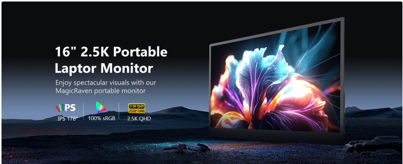
Image: The monitor displaying vibrant colors, with icons indicating 2.5K QHD, IPS 178°, and 100% sRGB color mode.