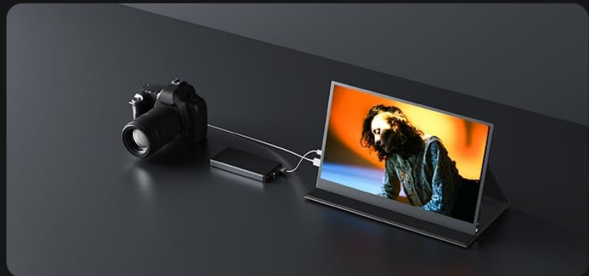
Image: Illustrations of different connection scenarios, including USB-C to USB-C, USB-C with USB Hub, USB-C to phone, and HDMI with USB-C power.