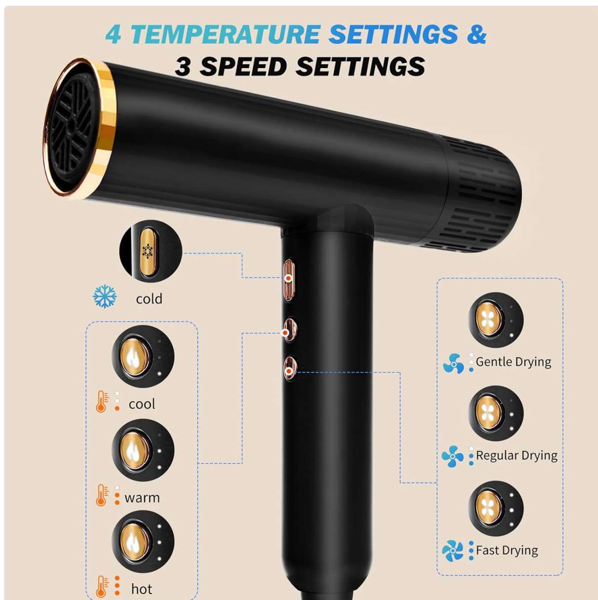
Image: Visual representation of the temperature and speed control buttons and their corresponding settings.