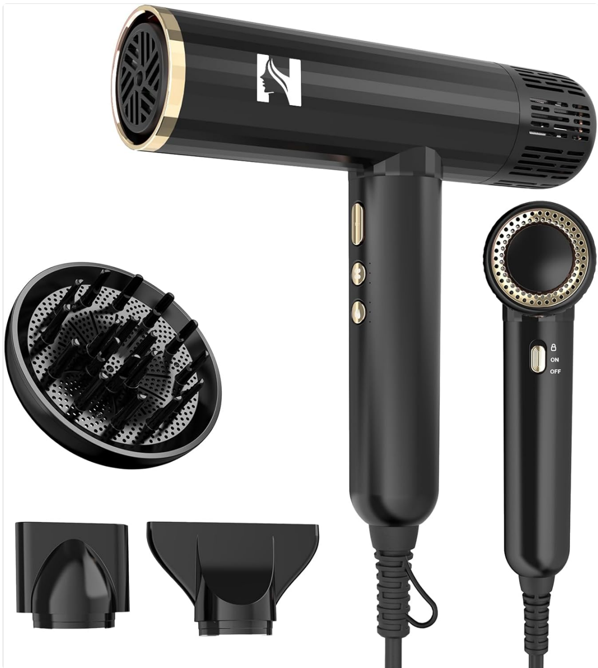
Image: The Nicebay Ionic Hair Dryer along with its magnetic attachments.