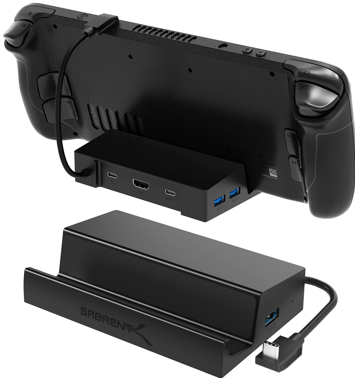
The SABRENT DS-SD6P 6-Port USB-C Docking Station, shown with a Steam Deck connected, highlighting its compact design and multiple ports.