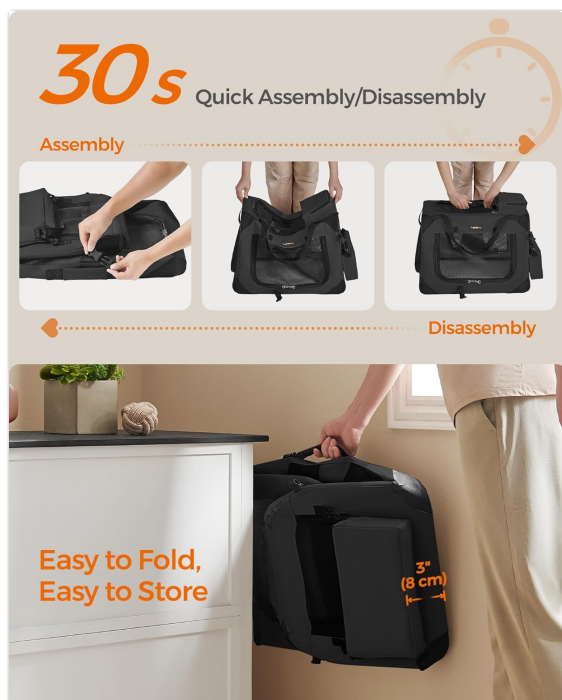
Figure 10: Collapsed carrier for easy storage.