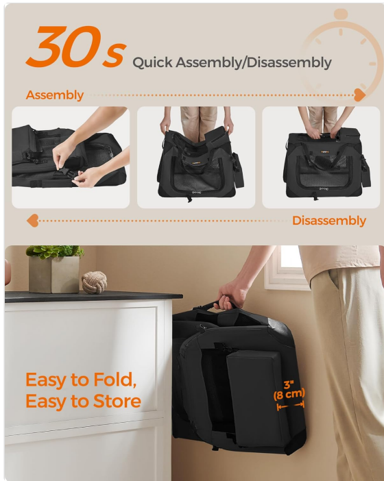
Figure 1: Overview of quick assembly and disassembly process.

The Feandrea pet carrier is designed for quick and easy assembly. Follow these steps to set up your carrier: