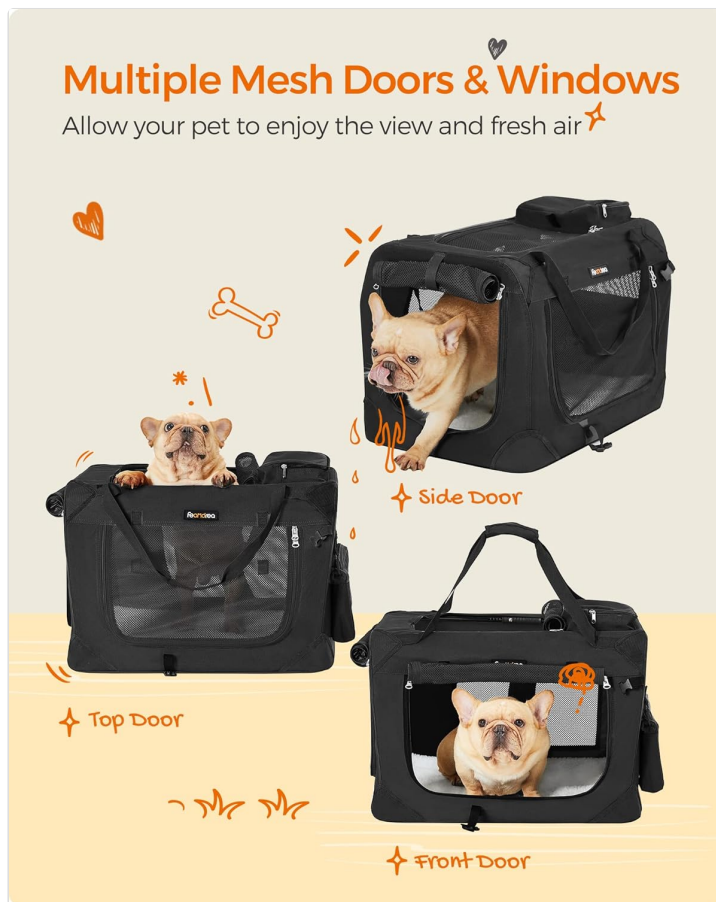
Figure 3: Multiple mesh doors and windows for pet access and ventilation.