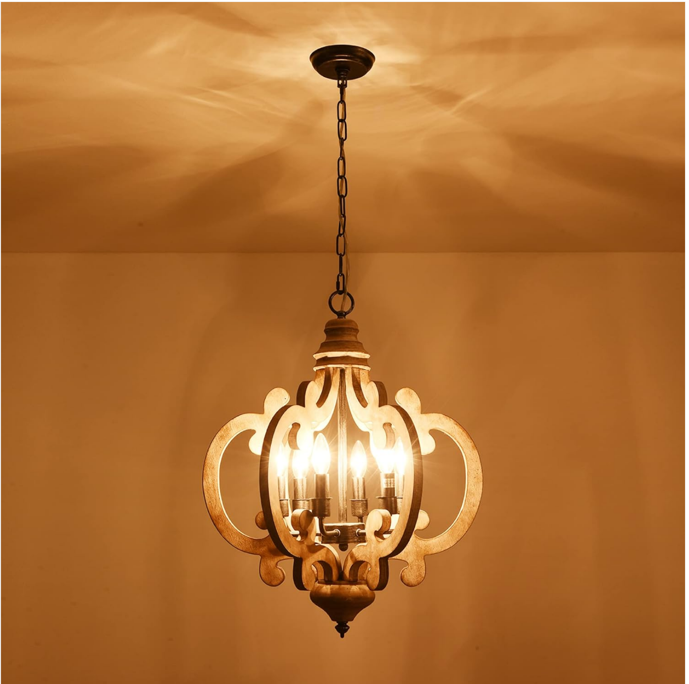
Image: The chandelier illuminated, showcasing the warm light emitted from its six bulbs.