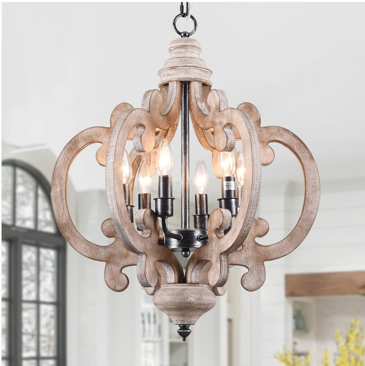
Image: The Bella Depot Farmhouse Chandelier, showcasing its weathered wood finish and six light sockets.