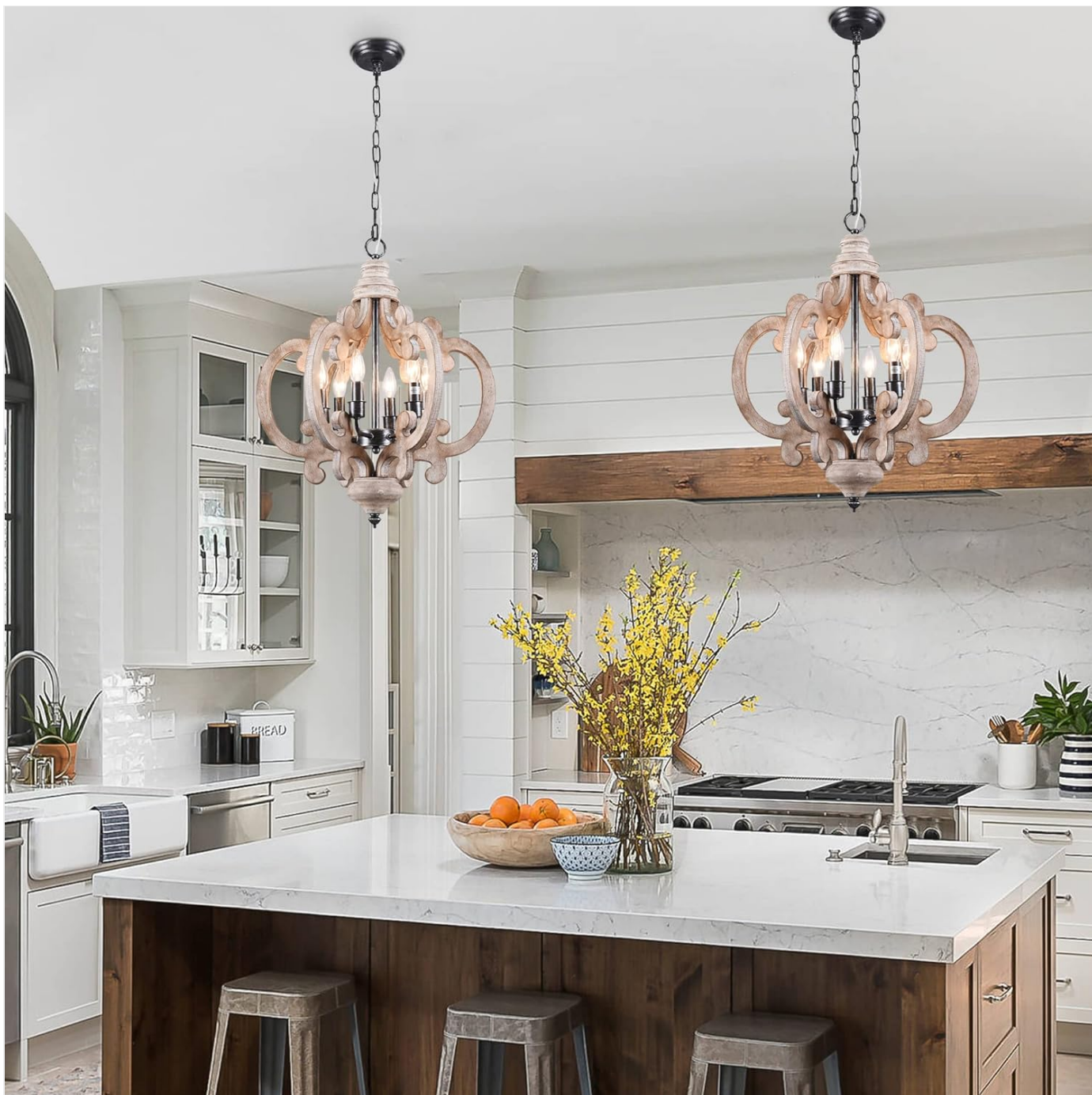
Image: The chandelier installed in a kitchen setting, demonstrating its aesthetic appeal in a typical home environment.