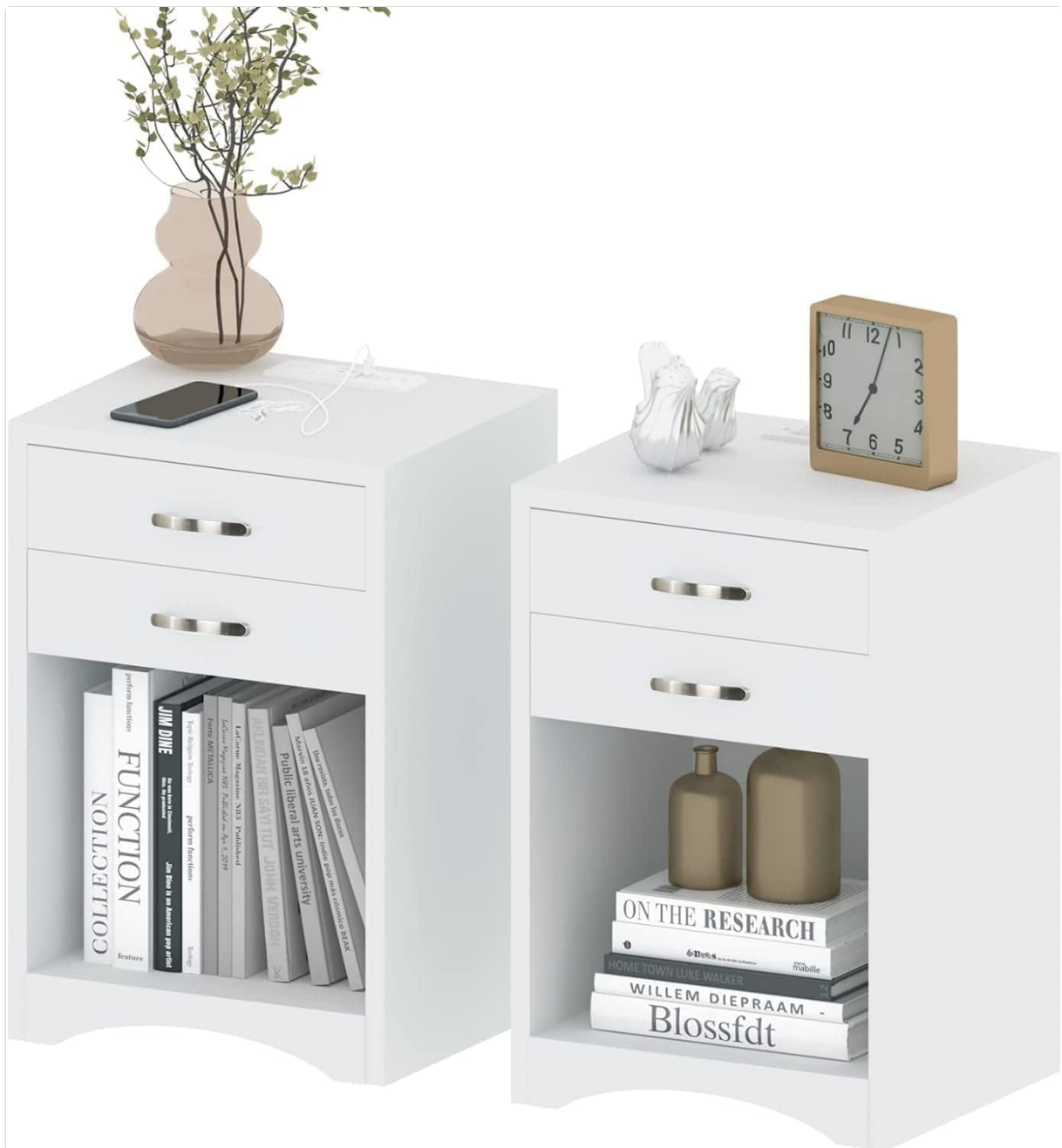
Image: Two hosote VM8011 White Nightstands. One nightstand displays a vase and phone on top, books in the open shelf, and two drawers. The other shows a clock and decorative items on top, books and bottles in the open shelf, and two drawers.