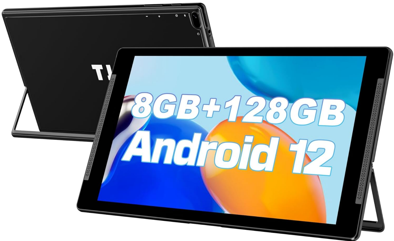
Image 1.1: TJD Android 12 Tablet 10.1 Inch. This image displays the tablet from a front-facing angle, highlighting its screen and overall design.

This manual provides essential instructions for setting up, operating, and maintaining your TJD Android 12 Tablet 10.1 Inch. Please read this manual thoroughly before using the device to ensure proper functionality and longevity.