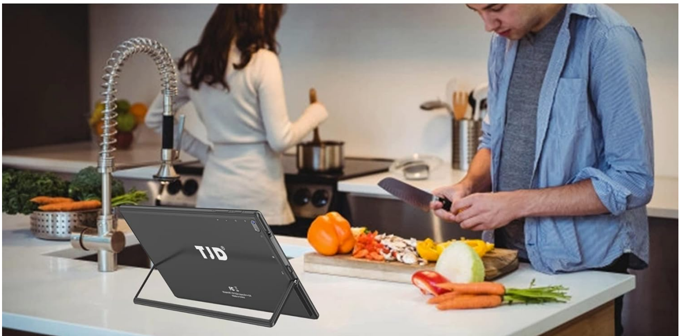
Image 4.1: Tablet with Built-in Stand. This image shows the TJD Android 12 Tablet being used with its integrated metal stand, demonstrating its versatility for various activities like watching videos or working.