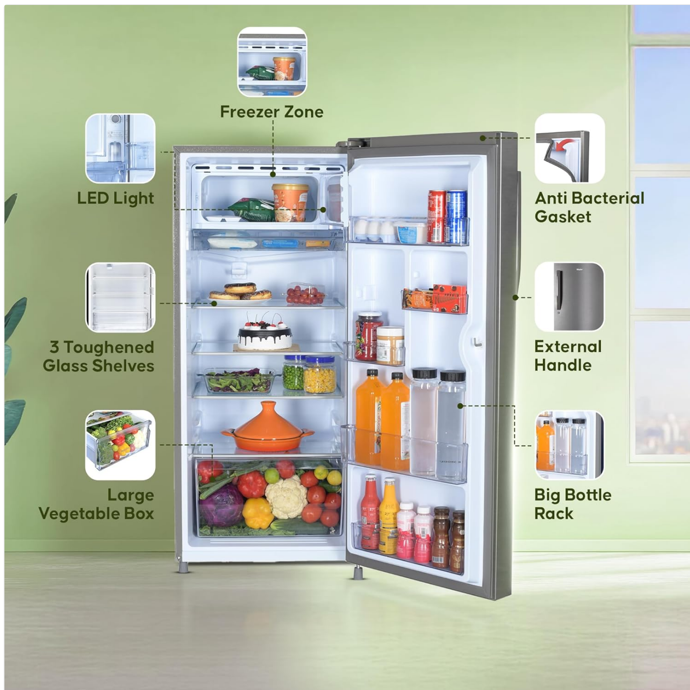
Interior view showing the arrangement of toughened glass shelves, large vegetable box, and door storage for various food items.