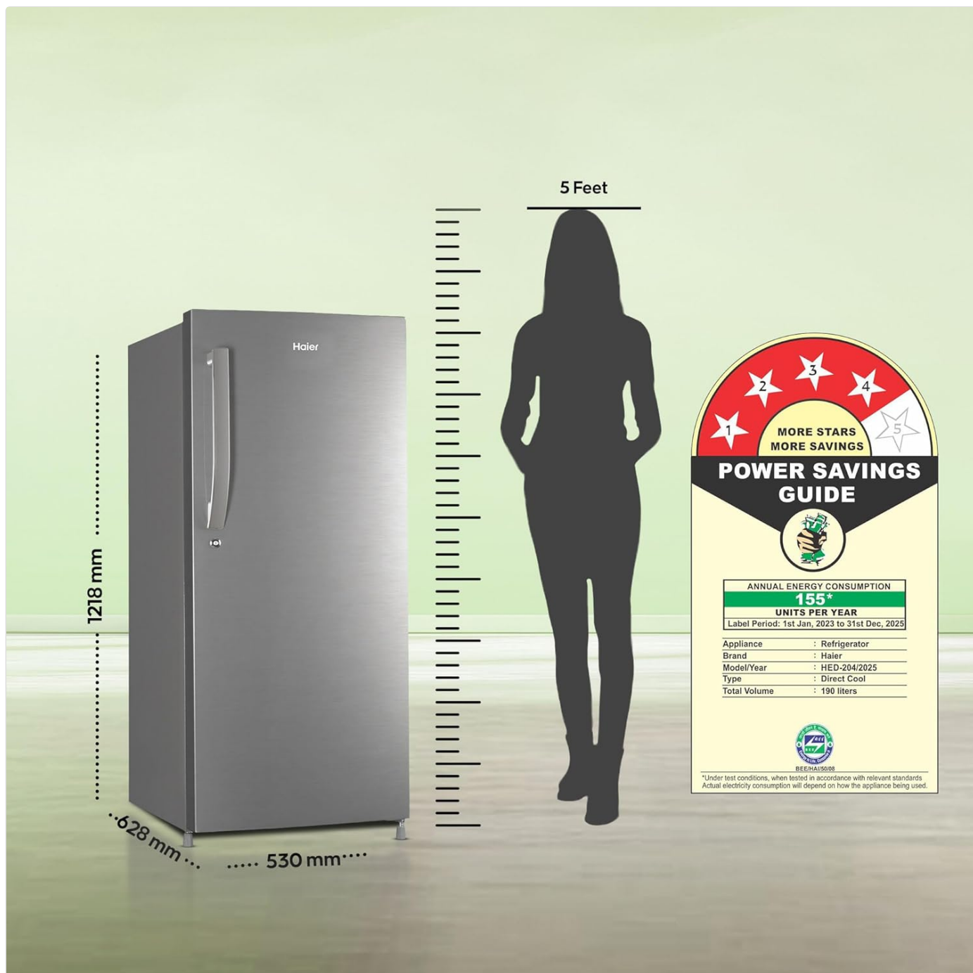
A diagram illustrating the key dimensions of the Haier 190L refrigerator for installation planning.