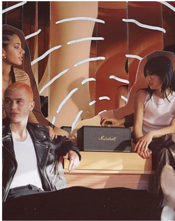
Image: Two Marshall Middleton speakers positioned together, illustrating Stack Mode functionality.

Refer to the Marshall Bluetooth app for detailed instructions on activating and managing Stack Mode.