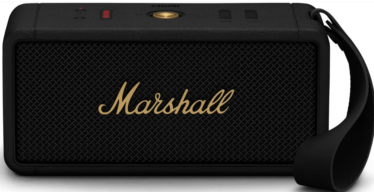
Image: Front view of the Marshall Middleton Portable Bluetooth Speaker in Black and Brass.

The Marshall Middleton is a portable Bluetooth speaker designed to deliver a powerful audio experience. It features a quad-speaker setup and True Stereophonic sound for immersive listening. This manual provides essential information for setting up, operating, maintaining, and troubleshooting your Middleton speaker.