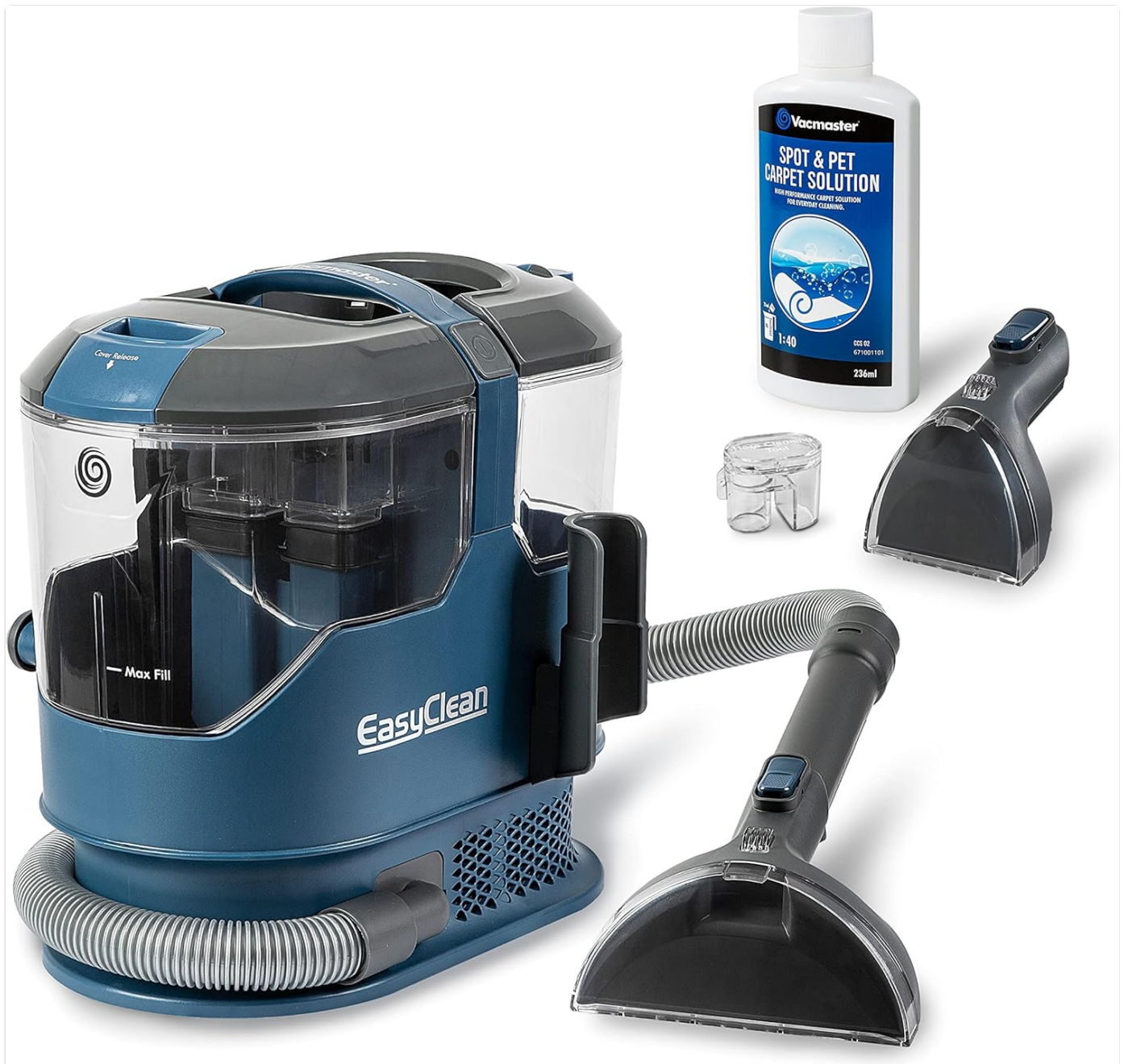
Image: The Vacmaster SCA0801 Spot Cleaner unit, showing its dual tanks, hose, and two cleaning tools, along with a bottle of cleaning solution.