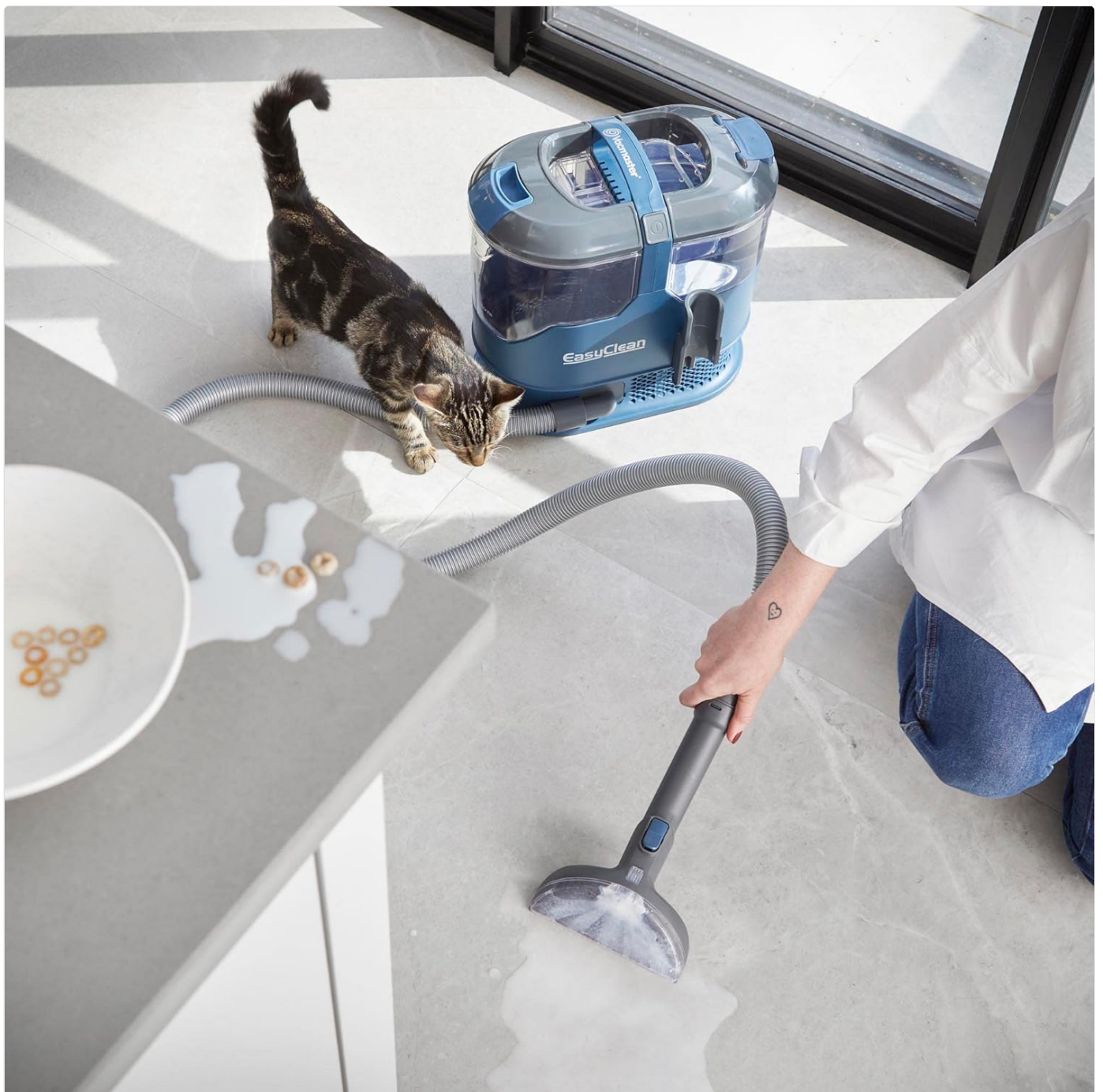
Image: A person using the Vacmaster SCA0801 to clean a spilled liquid on a hard floor, showing its versatility beyond just carpets.