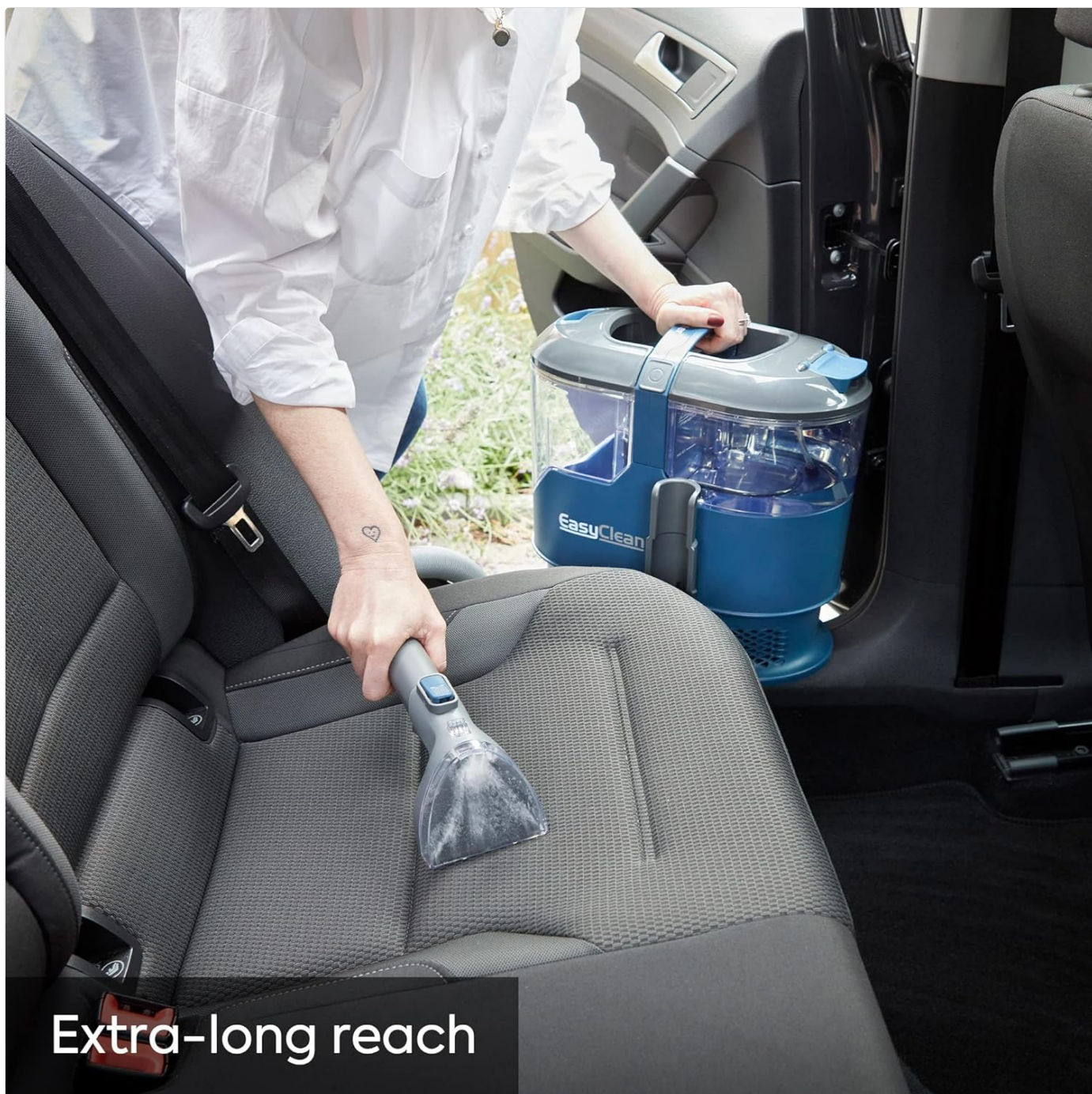
Image: A person using the Vacmaster SCA0801 to clean the interior of a car, specifically the car seats, demonstrating its extended reach and portability for vehicle cleaning.