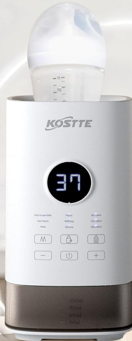
Figure 1: KOSTTE Baby Bottle Warmer Model 9300.