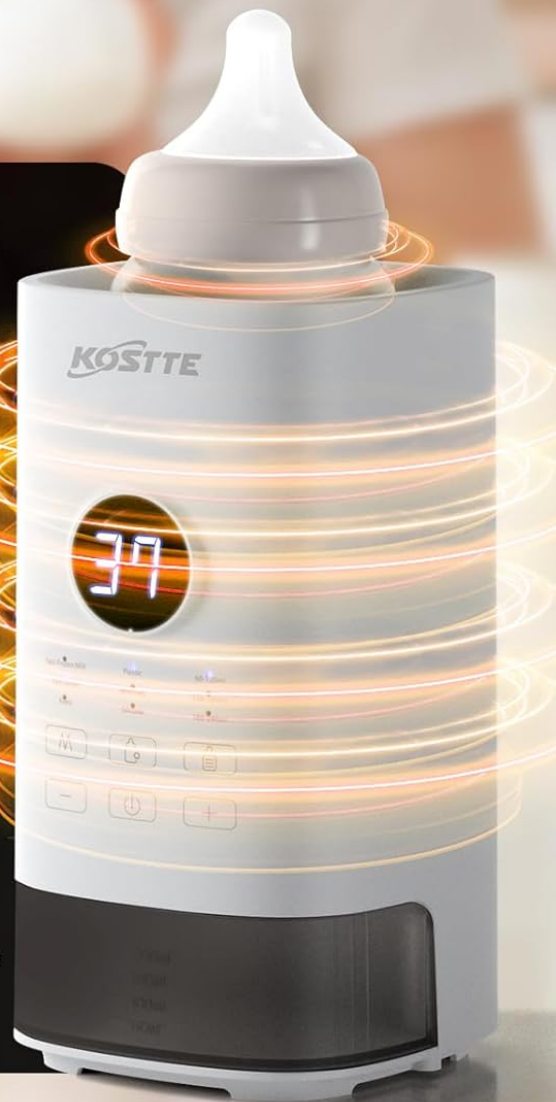
Figure 3: Front view of the bottle warmer showing the digital display and control buttons.