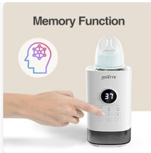
Figure 8: The Memory Function simplifies repeated use.