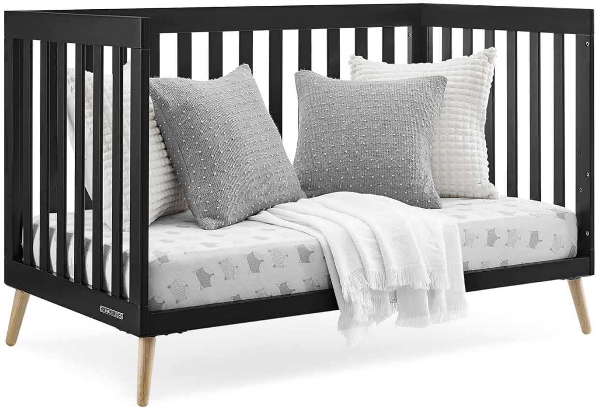
Image: The crib transformed into a functional sofa.

Your browser does not support the video tag.