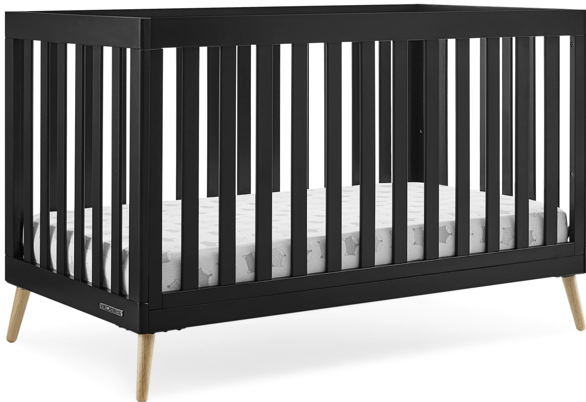
Image: The Essex 4-in-1 Convertible Baby Crib in ebony with natural legs, shown fully assembled in a nursery setting.