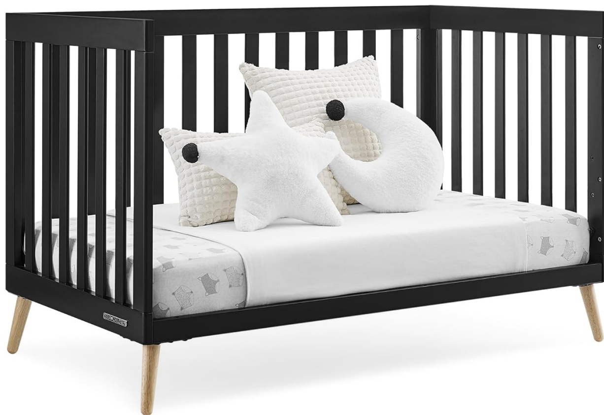
Image: The crib configured as a daybed, suitable for a child's room or play area.