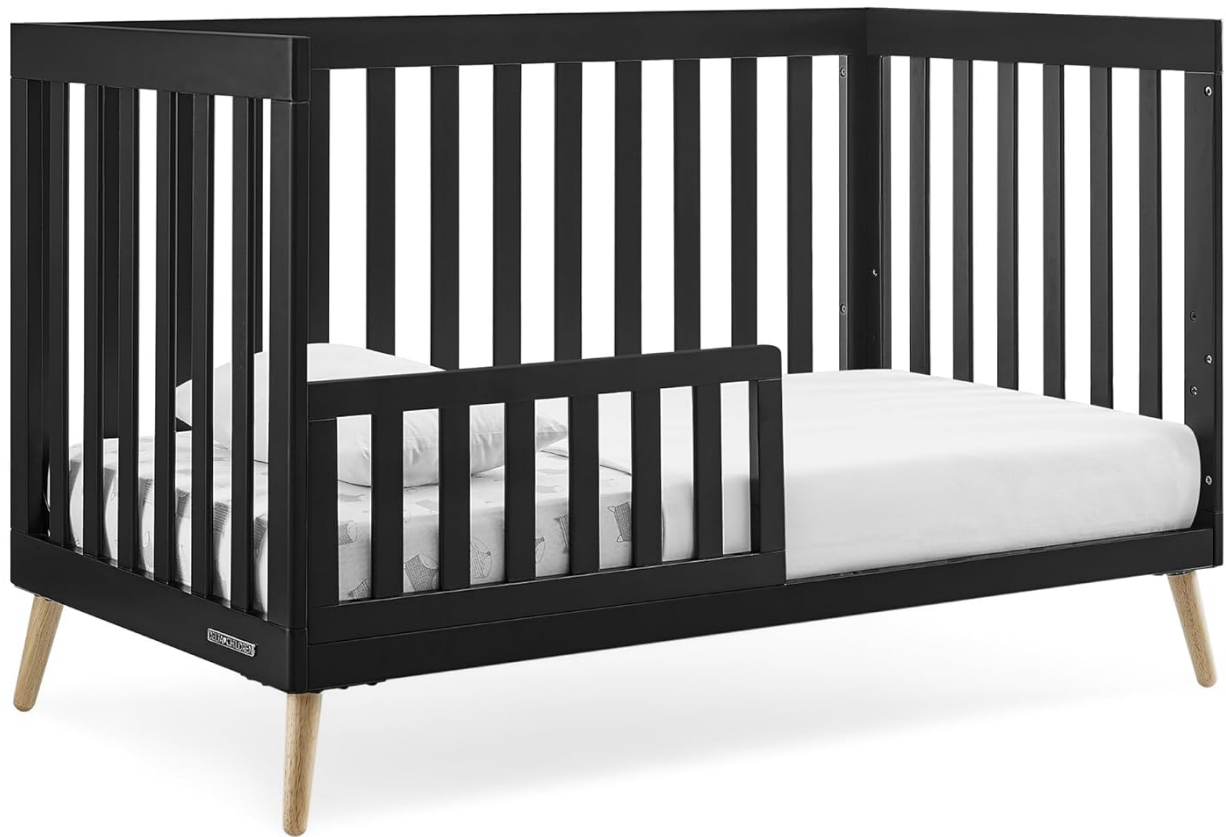
Image: The crib converted into a toddler bed with an optional guardrail.