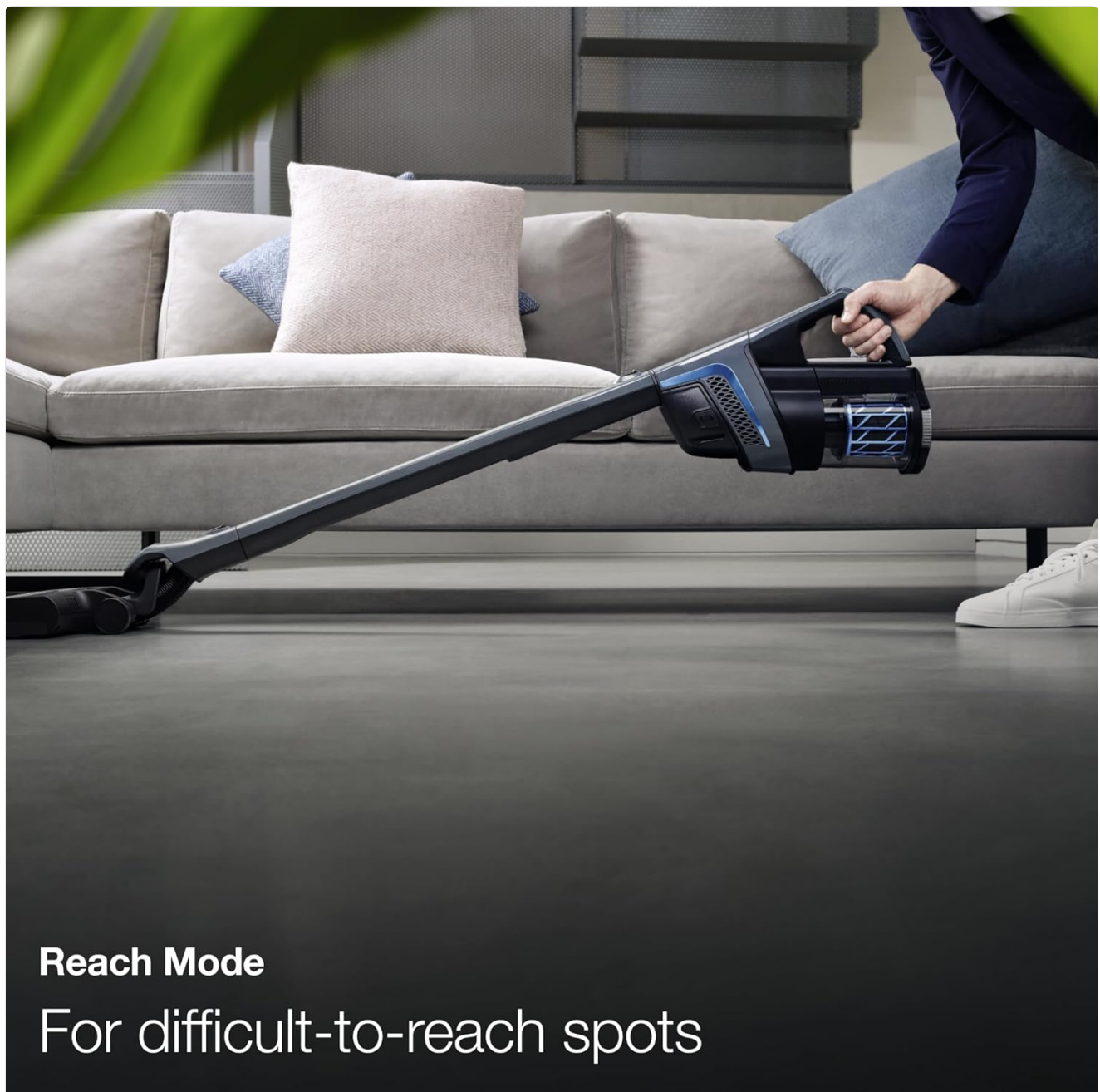
Figure 6: Reach Mode is designed for accessing difficult-to-reach areas.