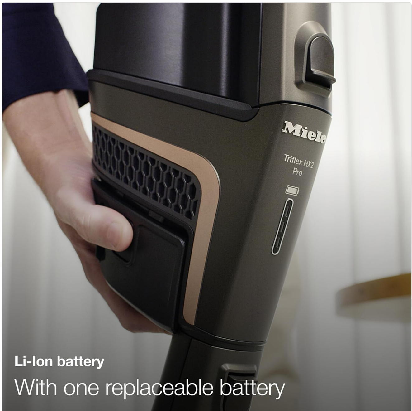
Figure 3: The removable Li-ion battery, providing cordless operation.