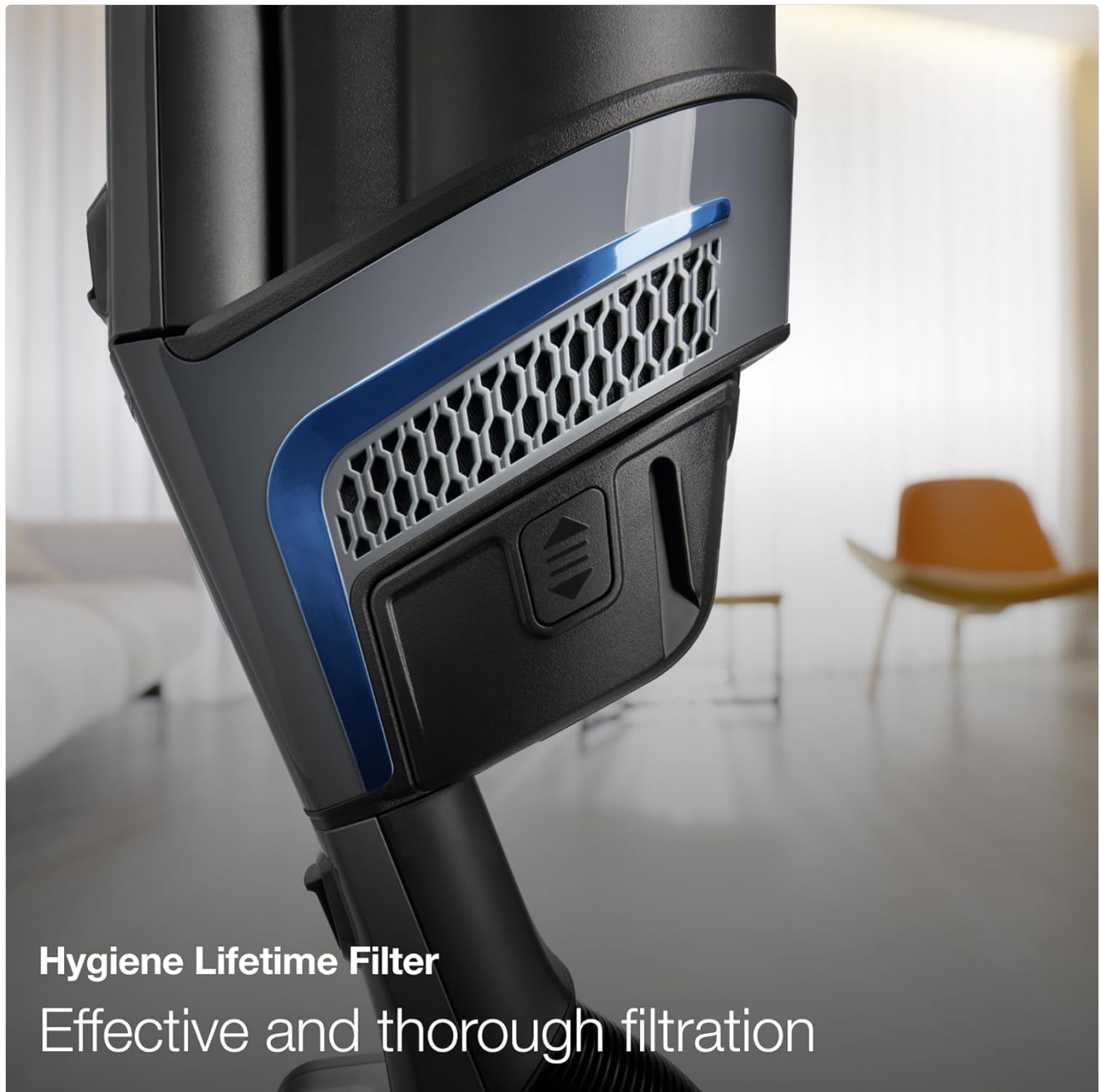
Figure 8: The Hygiene Lifetime Filter system, designed for effective dust retention.