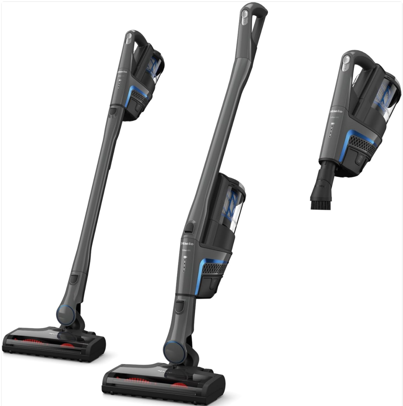
Figure 1: The Miele Triflex HX1 showcasing its three flexible configurations: upright, stick, and handheld.