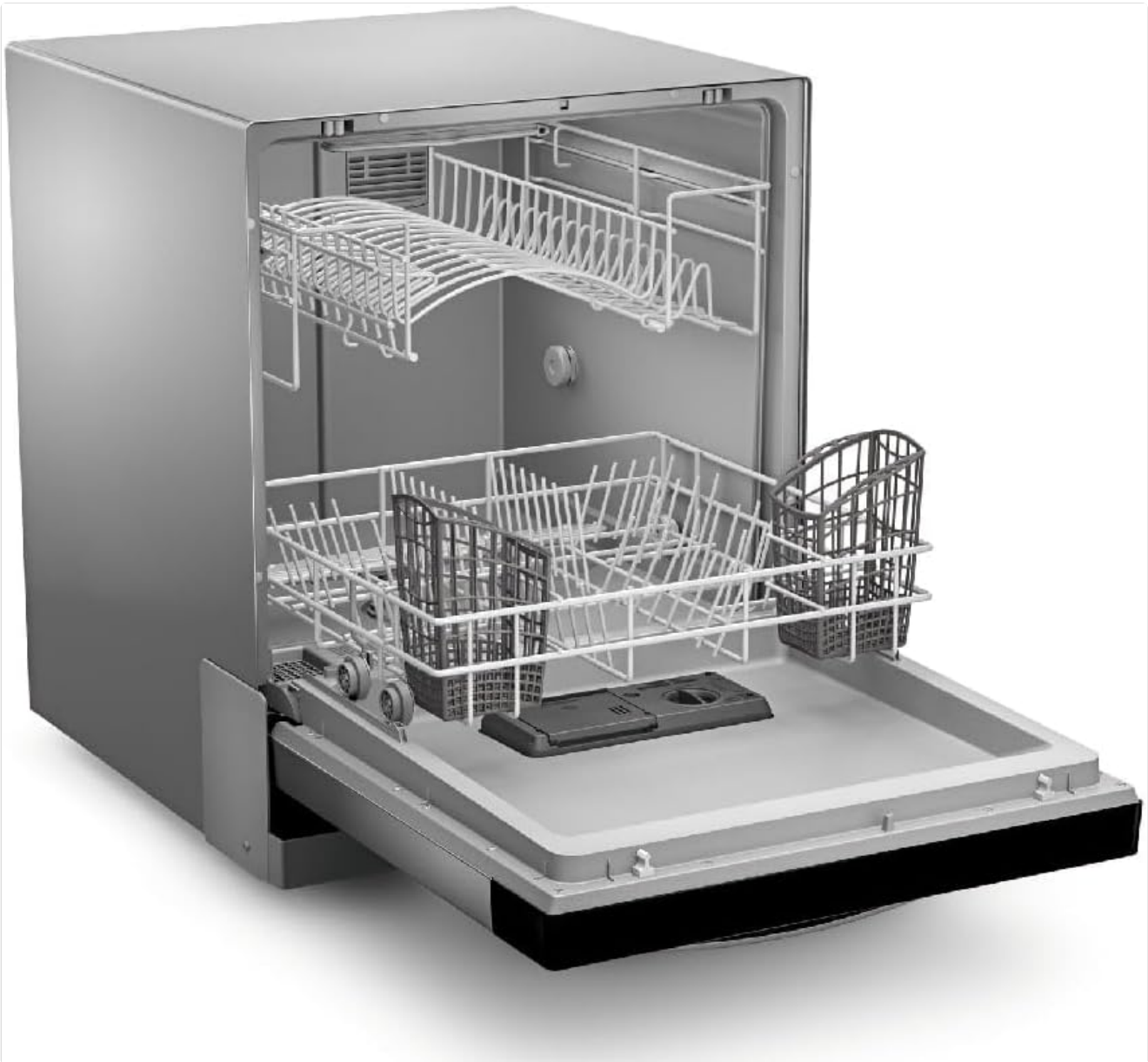
Image: Interior view of the dishwasher with empty racks, showing the layout for loading dishes.