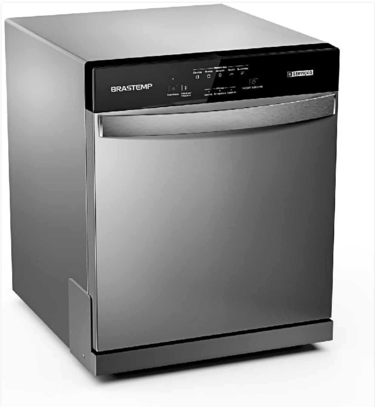
Image: Front view of the Brastemp 8-Service Dishwasher BLF08BS 110V, showcasing its sleek design.