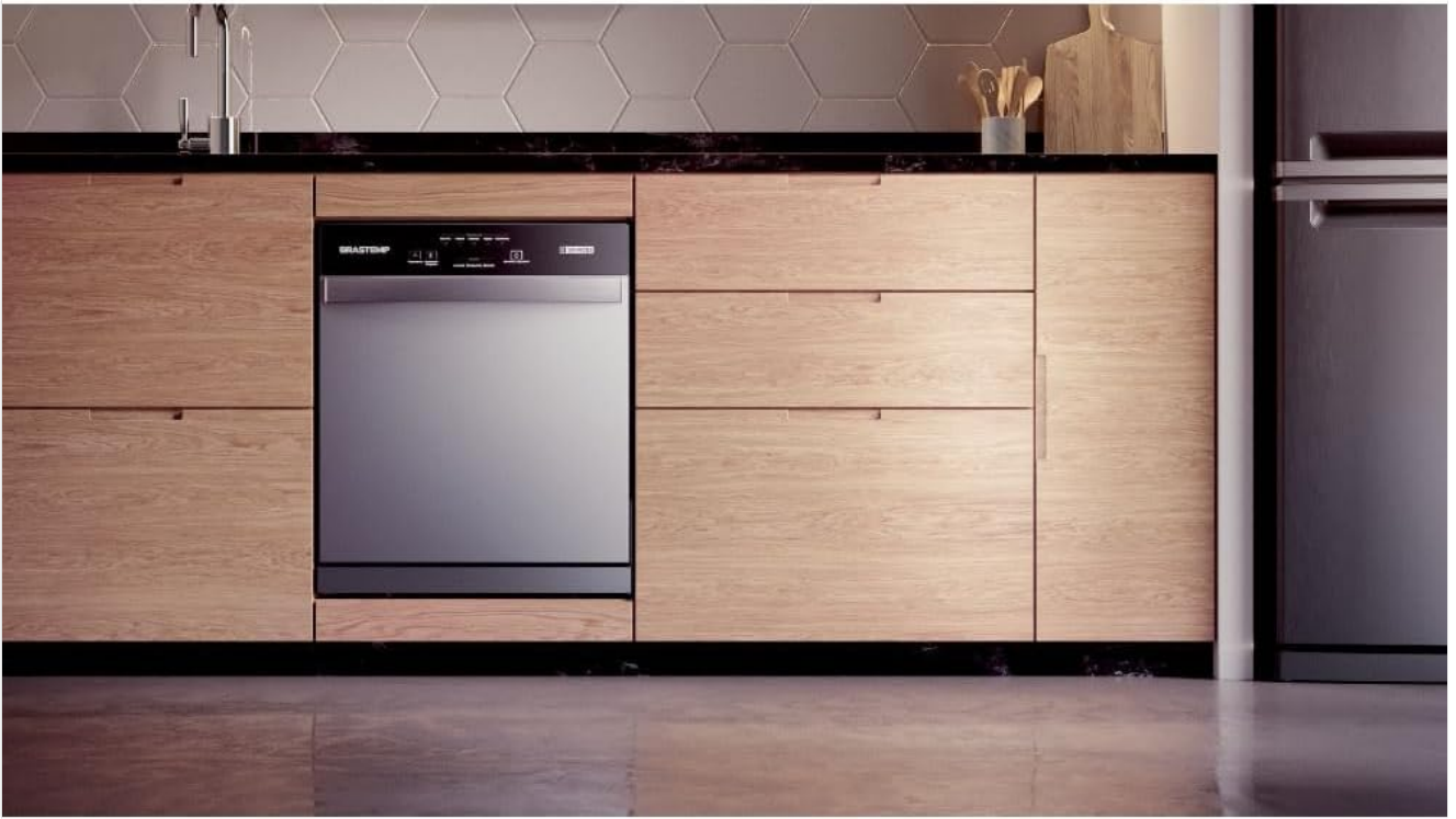
Image: The Brastemp dishwasher seamlessly integrated into a modern kitchen cabinet setup.