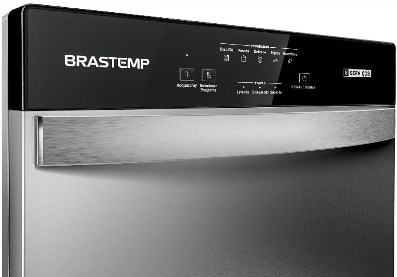
Image: A detailed view of the dishwasher's touch control panel, showing program selections and indicators.