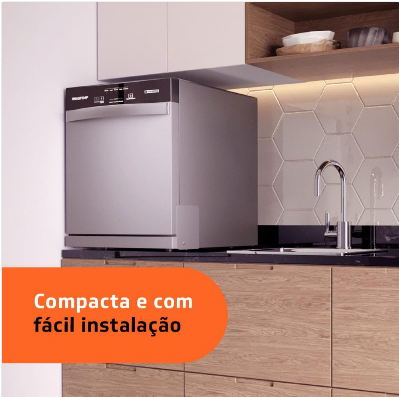
Image: The compact Brastemp dishwasher positioned on a kitchen countertop next to a sink.