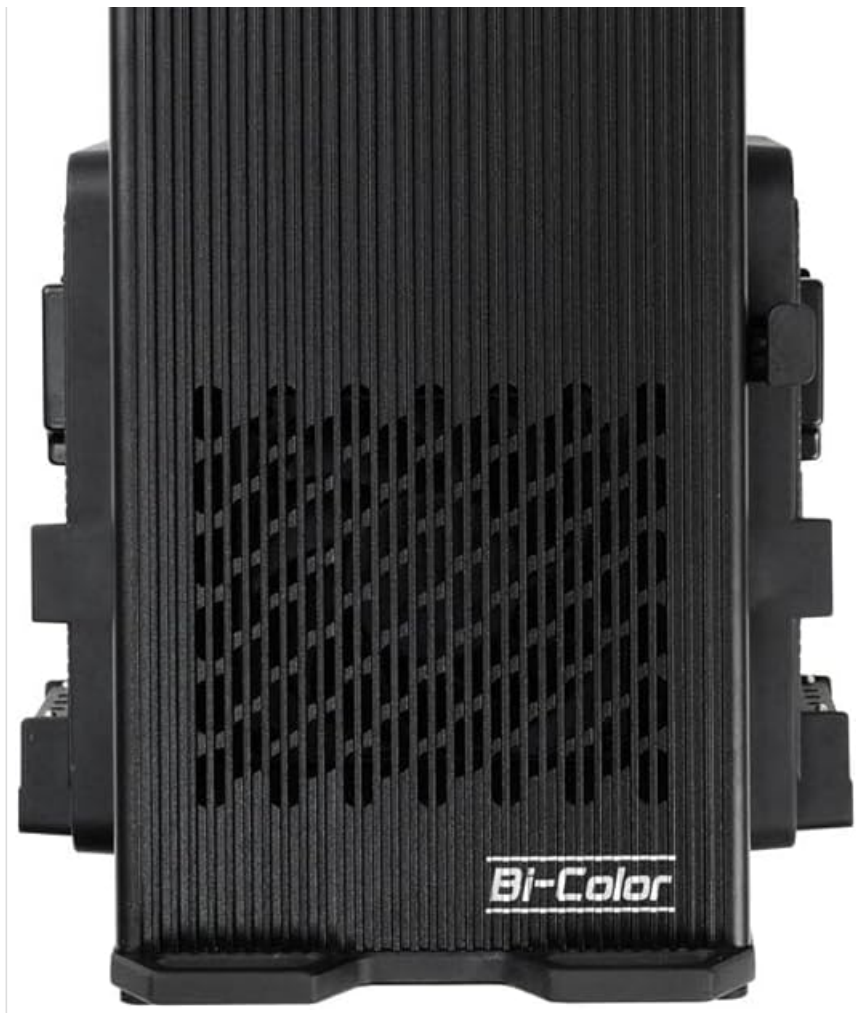
Image: Close-up of the Forza 720B control unit with display and adjustment knobs.