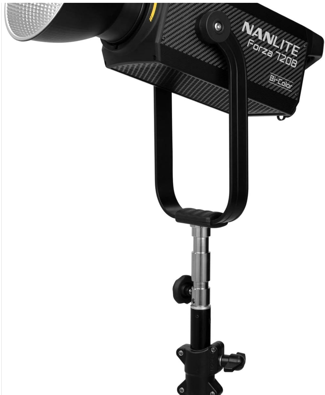
Image: NANLITE Forza 720B LED Spotlight with standard reflector attached.