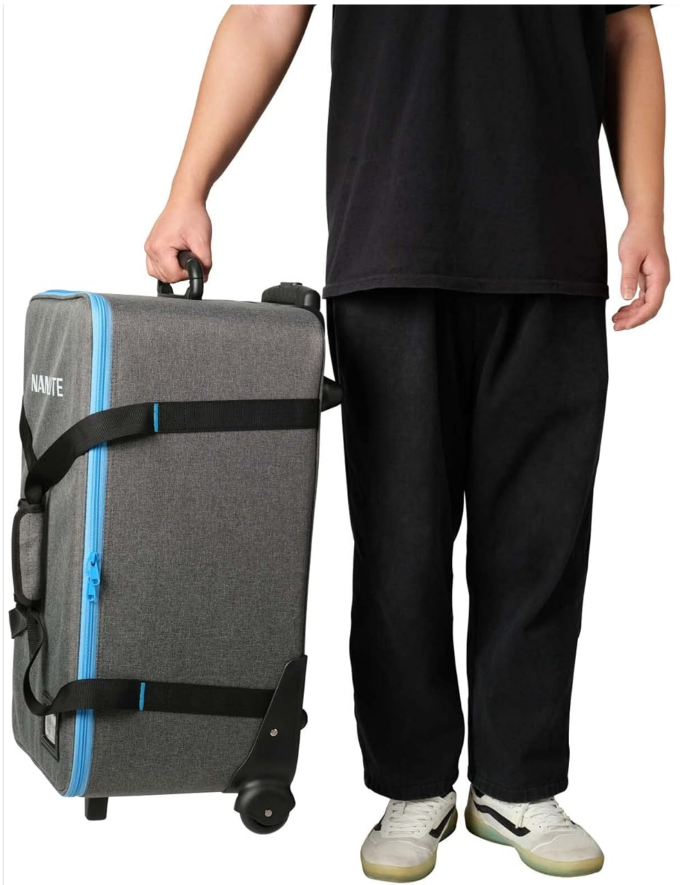
Image: The rolling padded case designed to transport the Forza 720B LED Spotlight and its accessories.