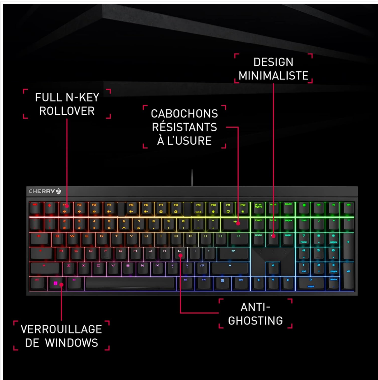
Image: The CHERRY MX 2.0S keyboard connected to a device via its USB-A cable, ready for use.