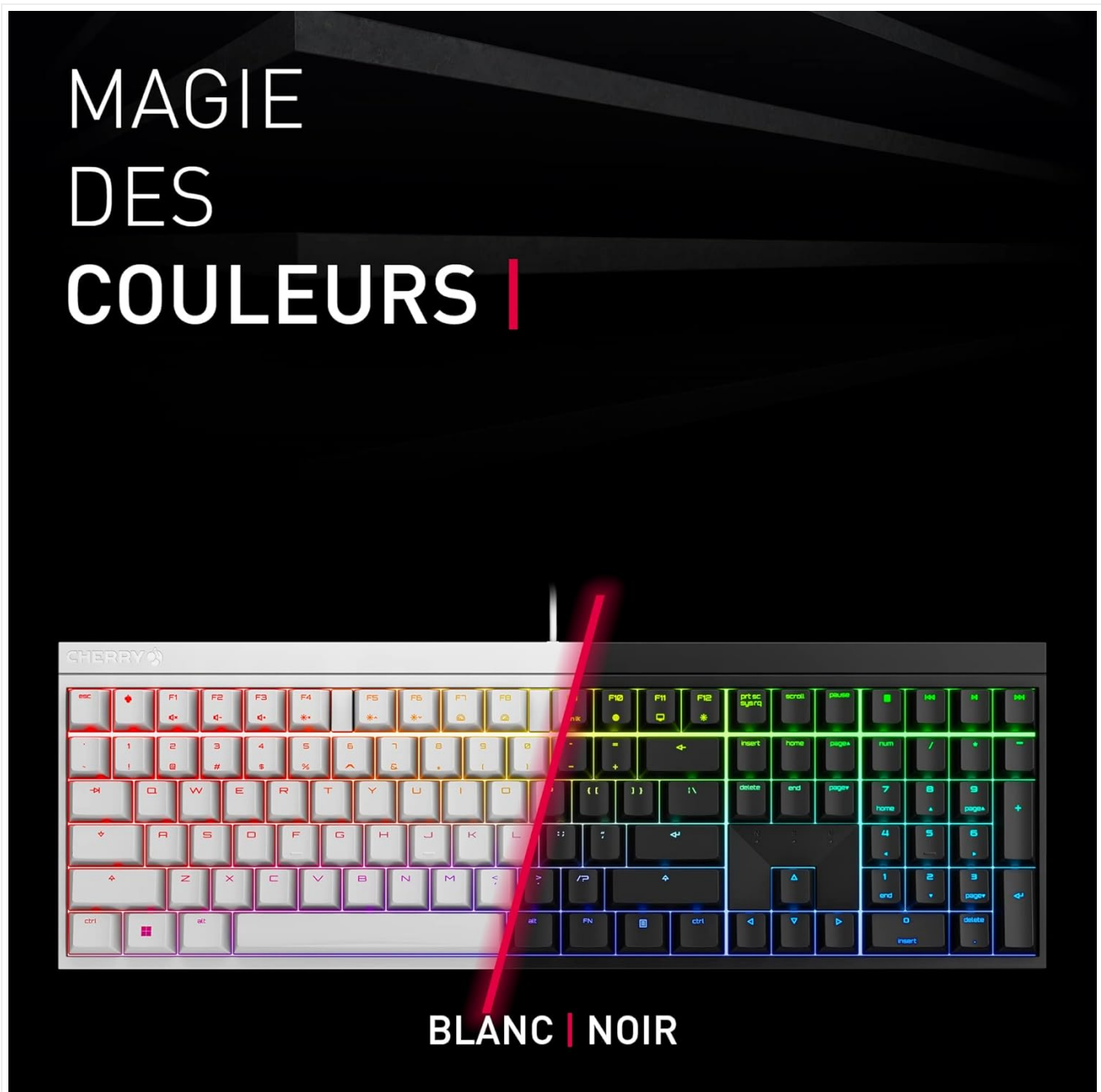
Image: The CHERRY MX 2.0S keyboard showcasing its "COLOR FUN RGB" capabilities with multiple integrated effects and 16.8 million colors.