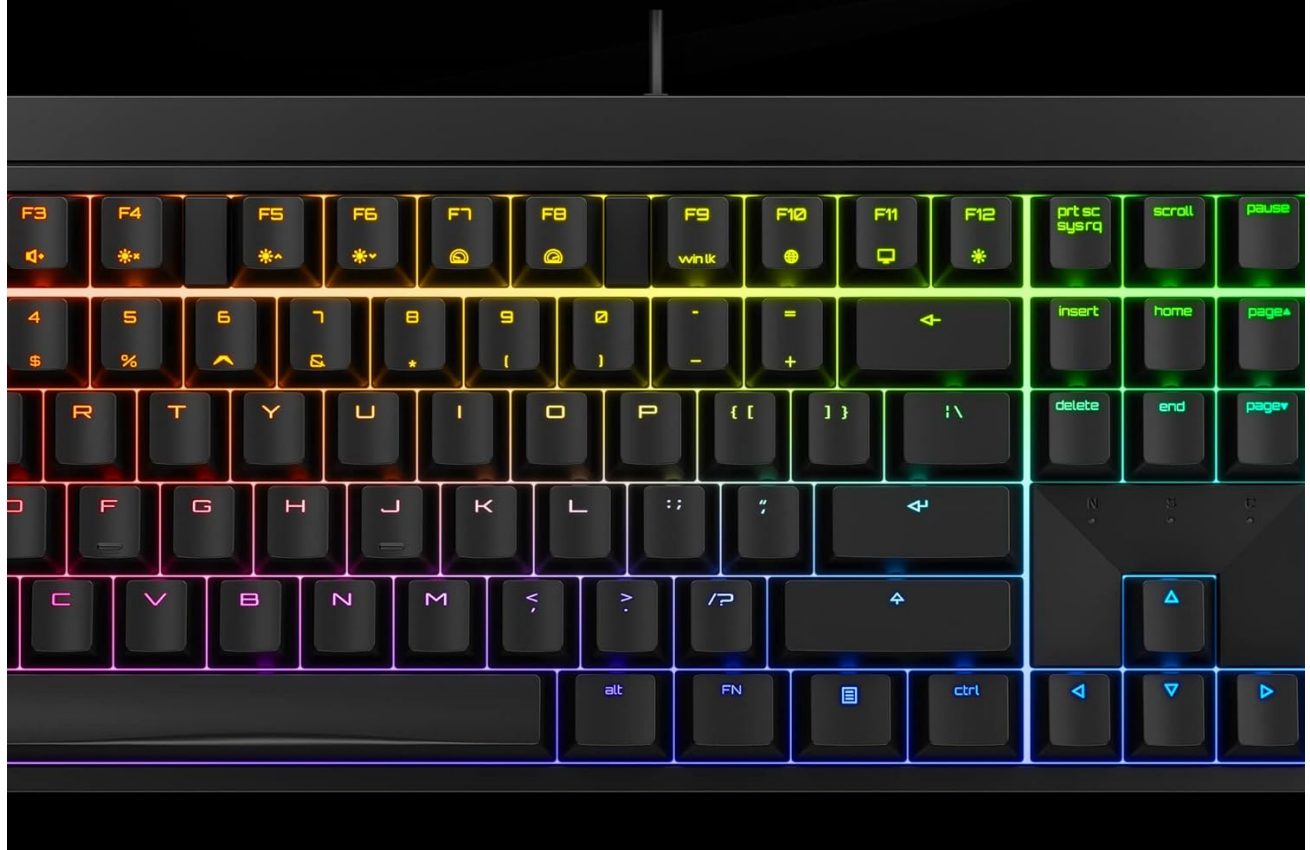
Image: Illustration of CHERRY MX mechanical keyswitch technology, highlighting precise contact, fast input, unique typing feel, and durability up to 100 million keystrokes. Made in Germany.