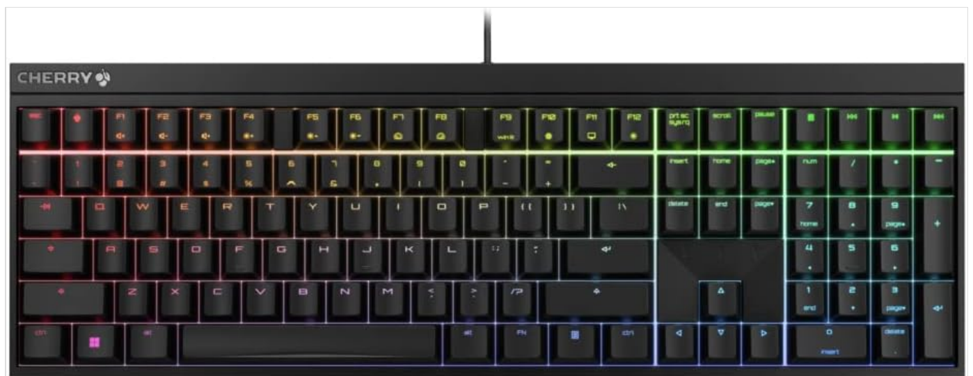
Figure 1: Top view of the Cherry MX 2.0S Wired Gaming Keyboard, showcasing its full layout and active RGB lighting.