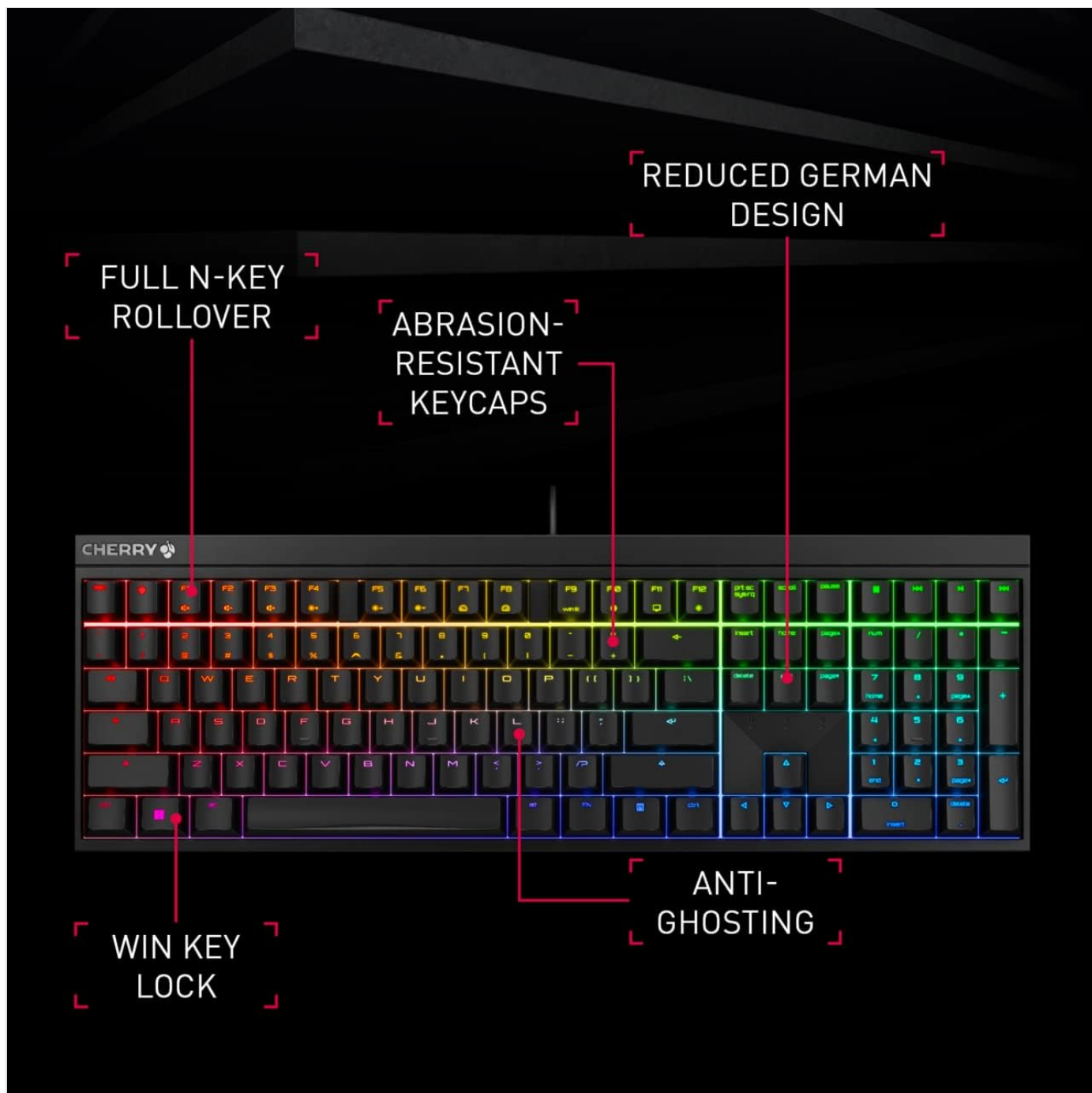
Figure 3: Key features of the Cherry MX 2.0S keyboard, including N-Key Rollover and Anti-Ghosting for precise input.