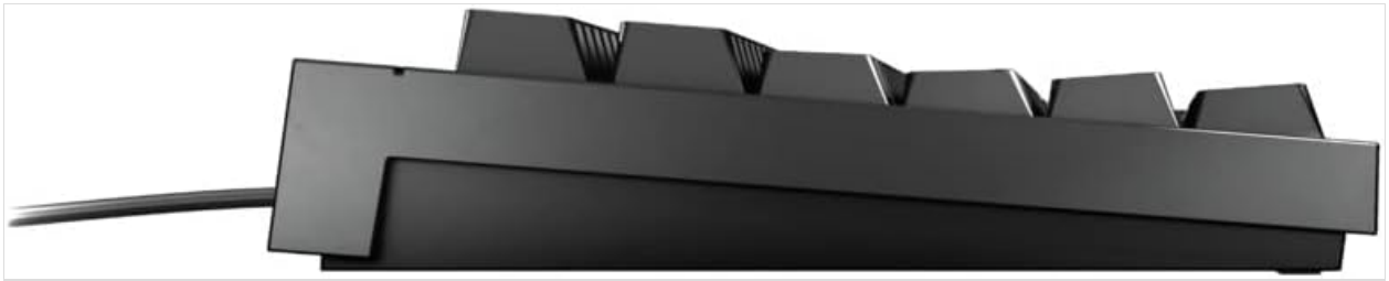
Figure 2: Side profile of the keyboard, highlighting its compact and ergonomic design.