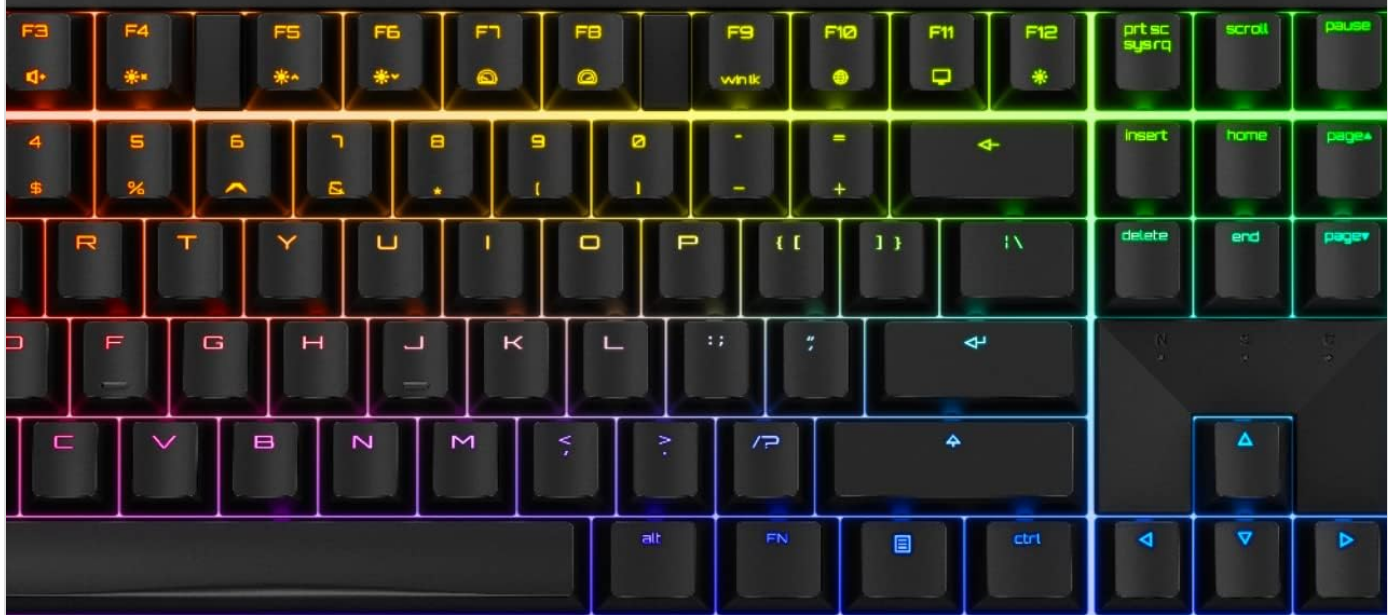
Figure 5: The keyboard's RGB lighting capabilities, offering extensive color options and dynamic effects.