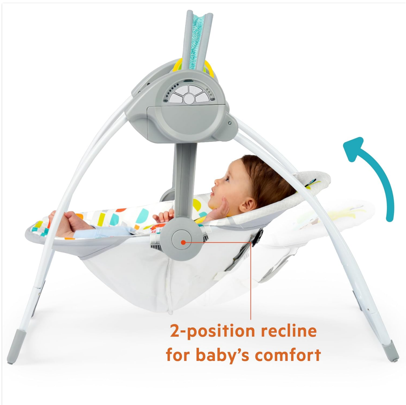
Image: A baby in the swing, demonstrating the 2-position recline feature for enhanced comfort.