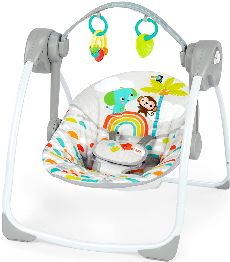
Image: The Bright Starts Playful Paradise Portable Swing shown fully assembled, highlighting its compact design and colorful seat pad with animal motifs.