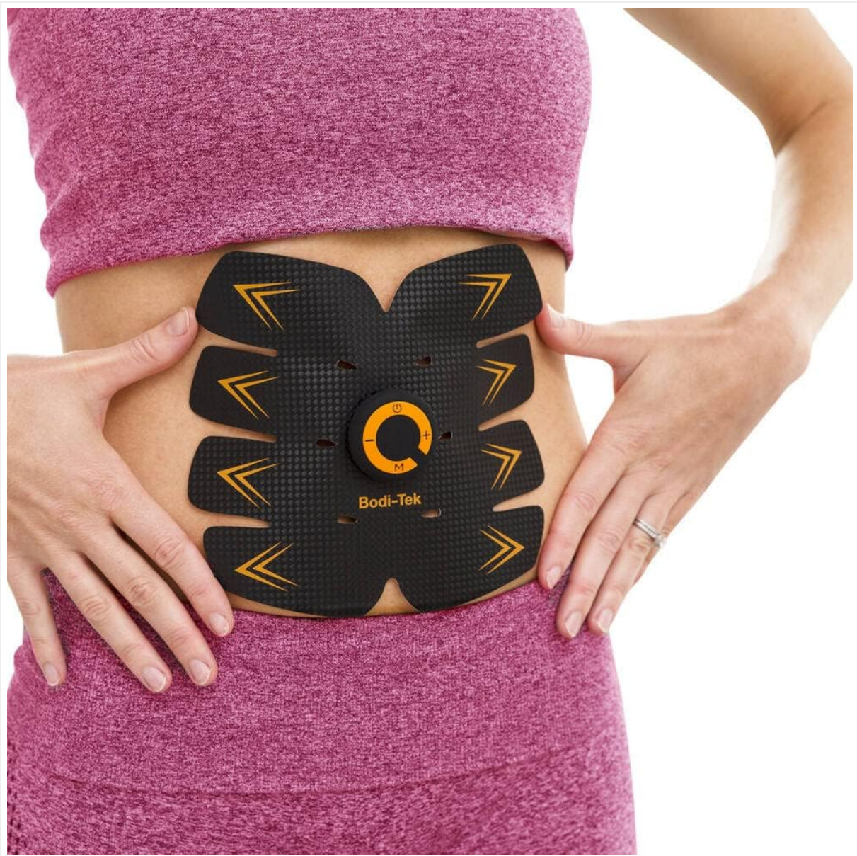
Image: A woman demonstrates the correct placement of the Bodi-Tek Ab Trainer on her abdominal area.