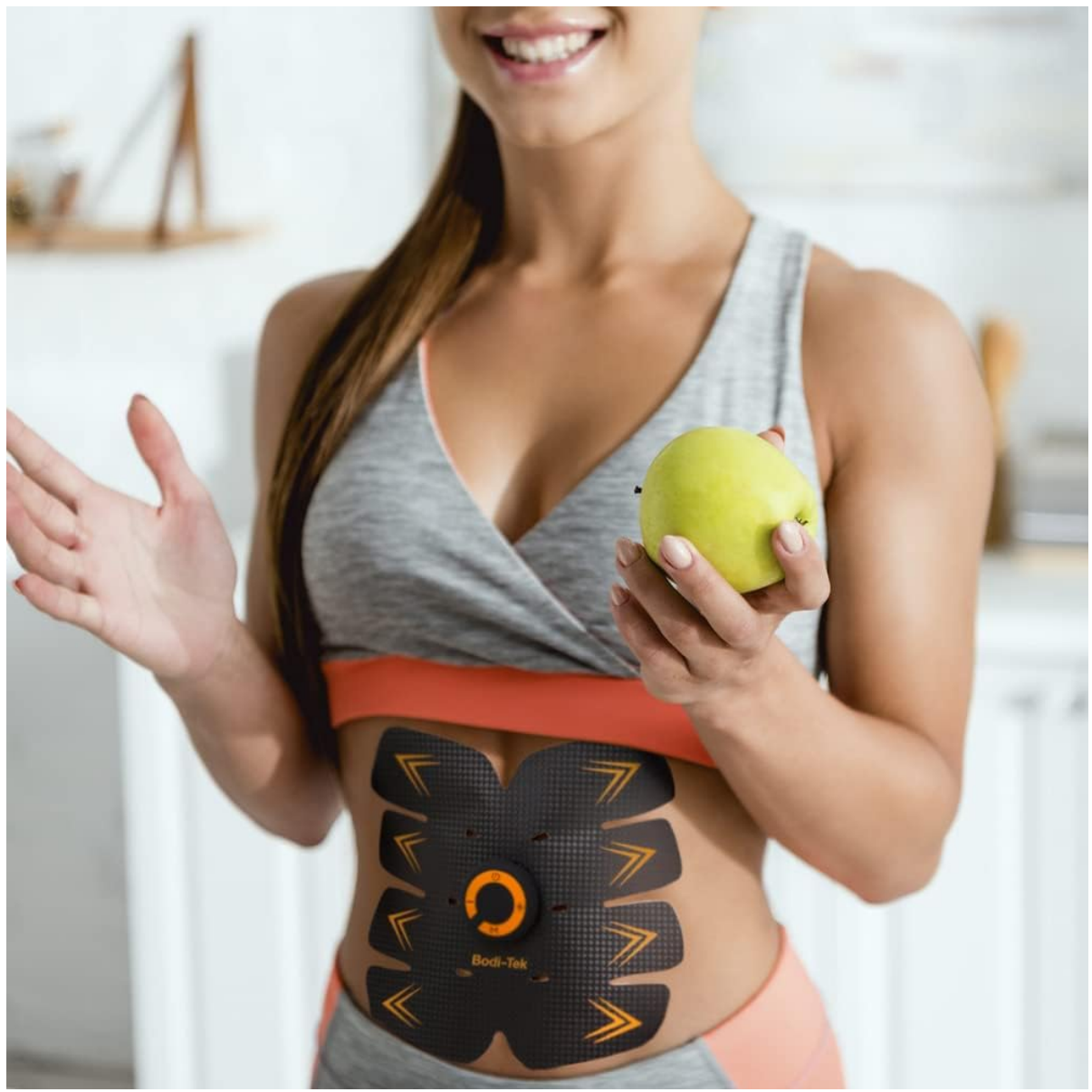
Image: A woman wearing the Bodi-Tek Ab Trainer, illustrating its discreet and comfortable fit for use during light activities.