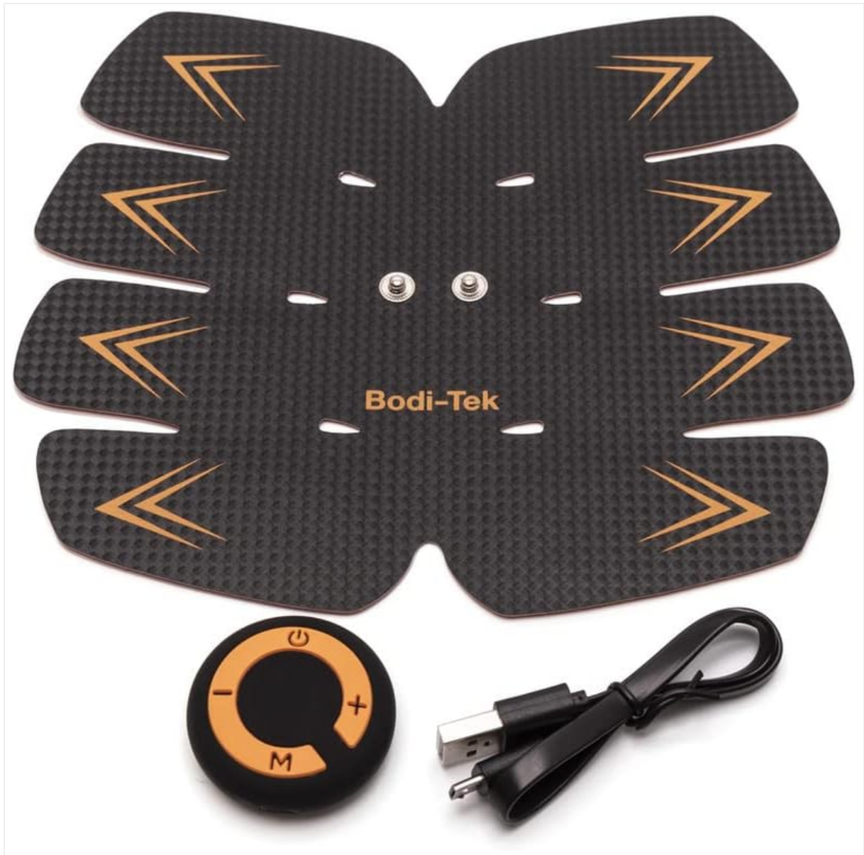
Image: The Bodi-Tek Ab Trainer controller, the 8-in-1 conductive gel pad, and the USB charging cable, laid out on a white surface.