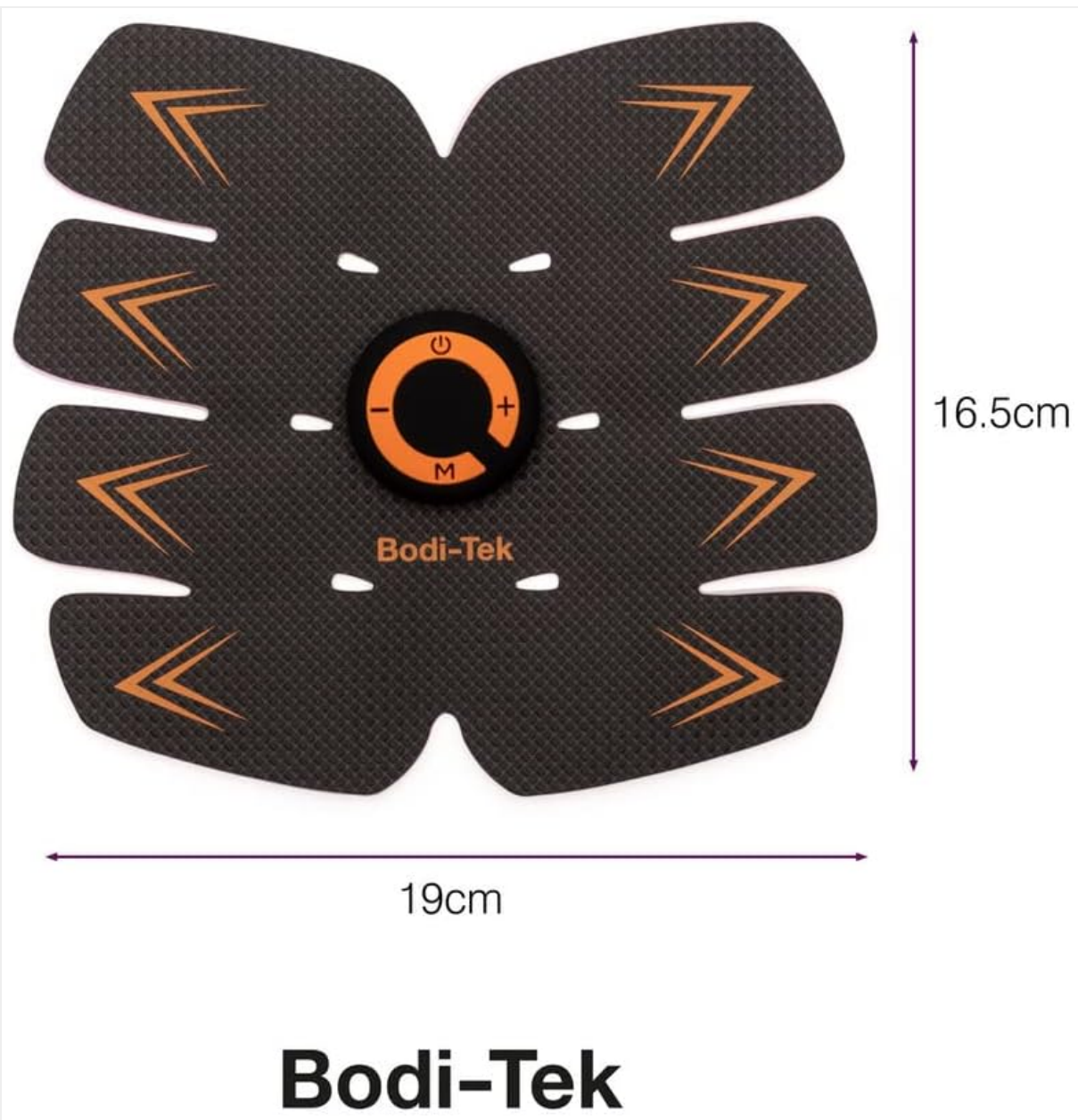
Image: The Bodi-Tek Ab Trainer pad with indicated dimensions of 19cm in width and 16.5cm in height.