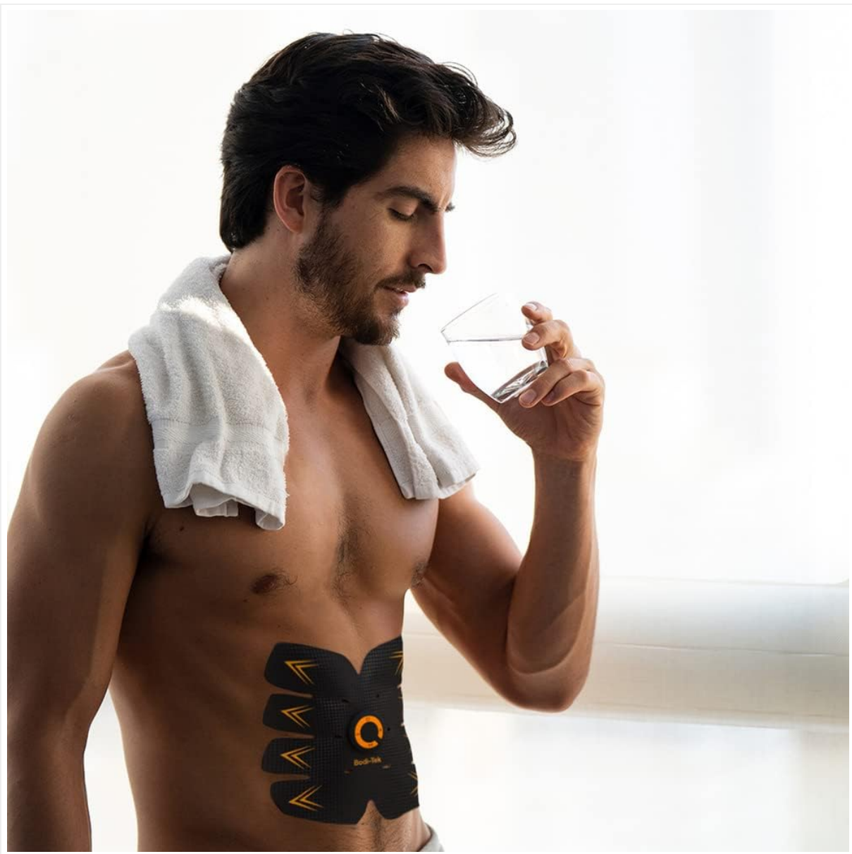
Image: A man using the Bodi-Tek Ab Trainer, highlighting its suitability for both men and women.