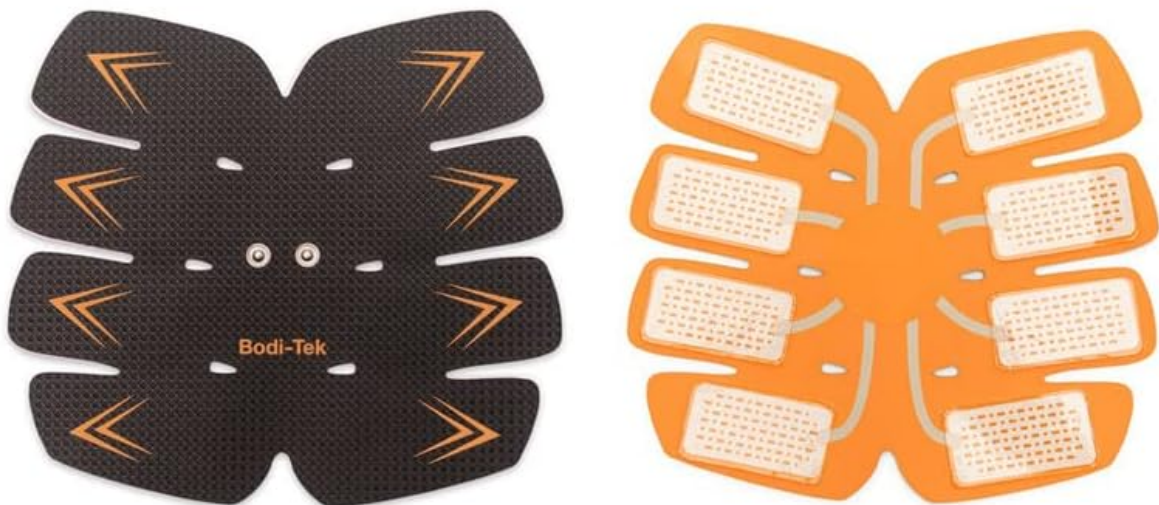
Image: A detailed diagram illustrating the controller's buttons and ports, along with front and back views of the 8-in-1 conductive gel pad, showing the placement of the adhesive pads.