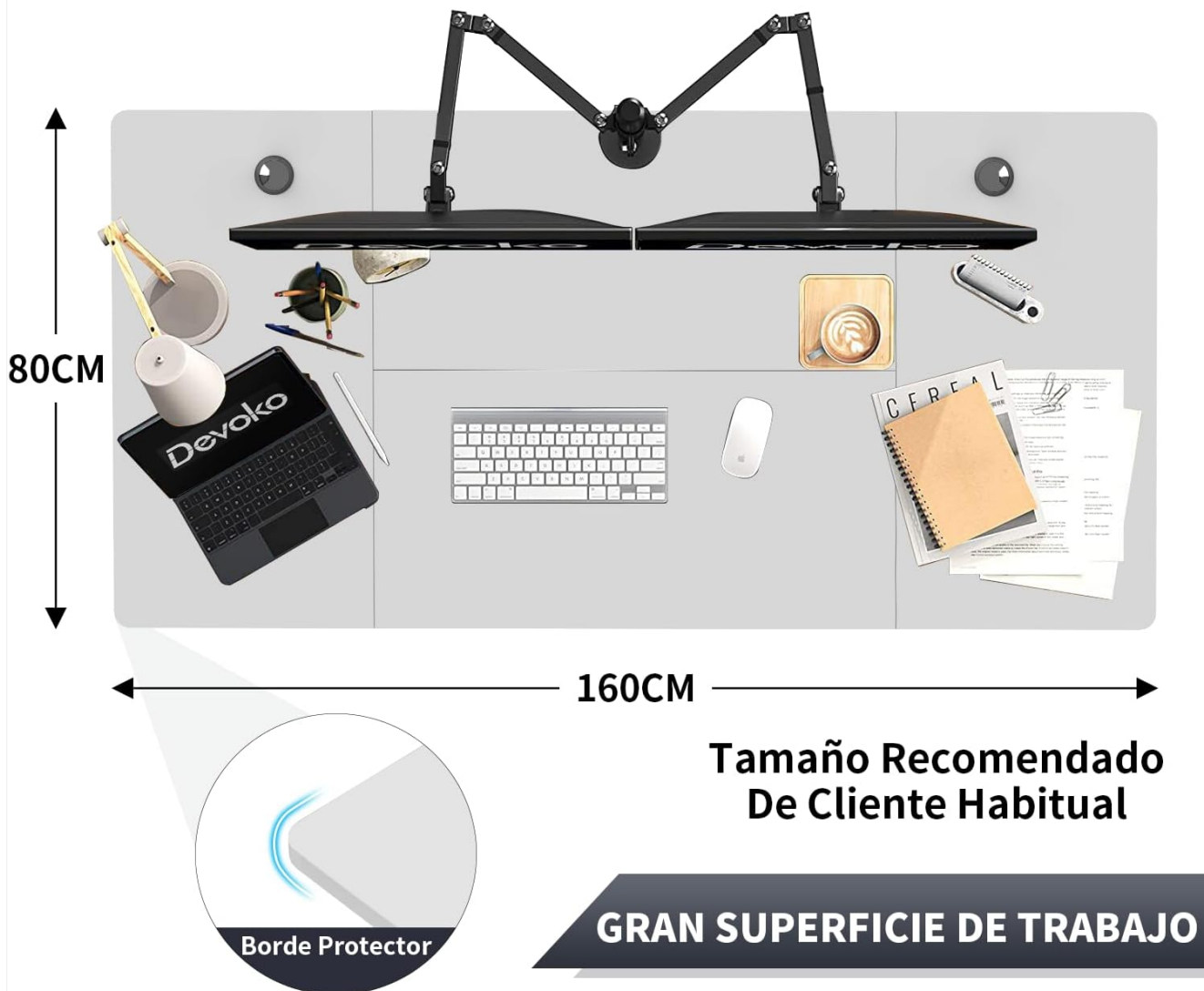
Image: Overview of the Devoko Electric Height Adjustable Desk setup, including optional caster wheels.