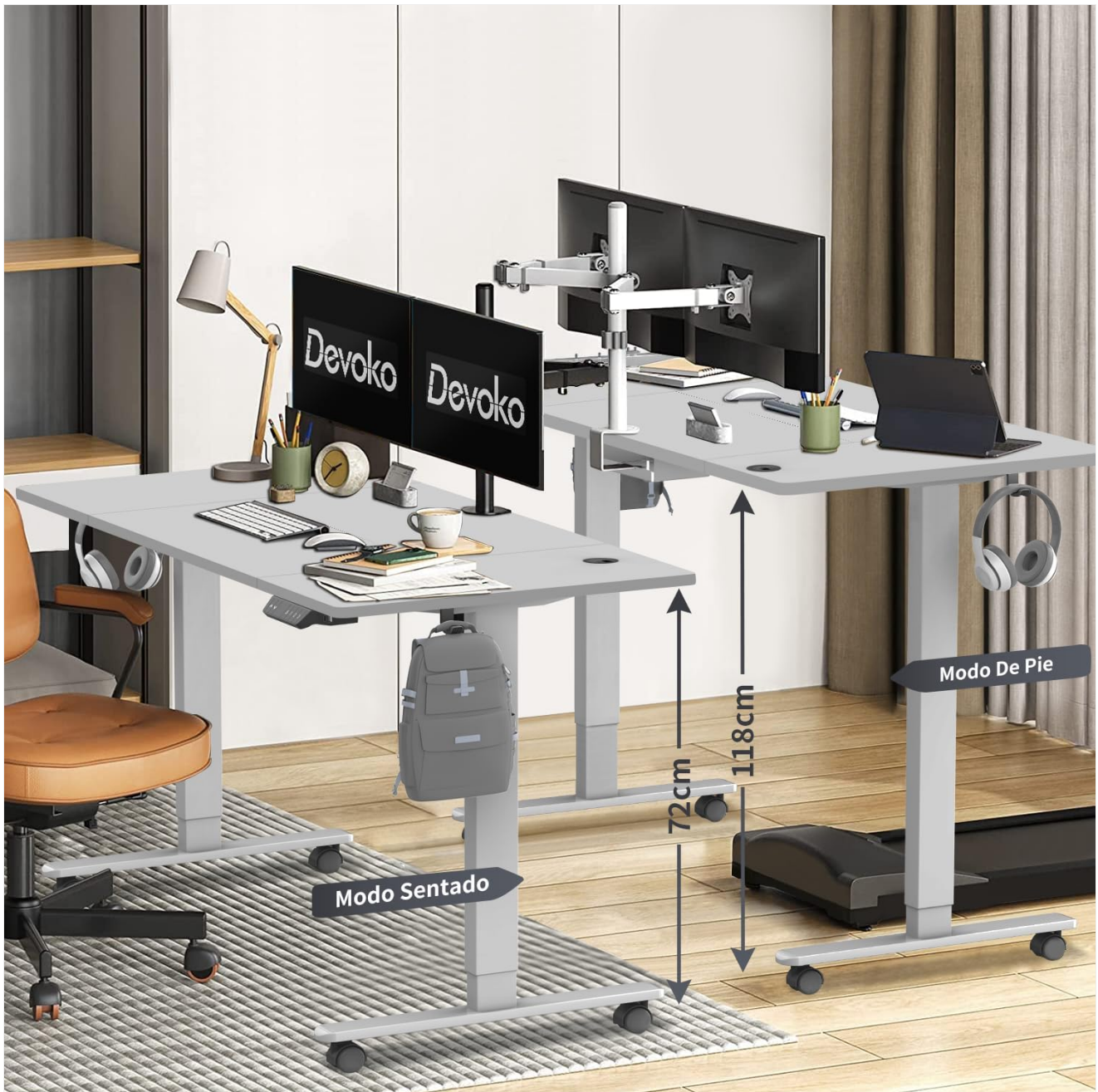
Image: Desk height adjustment range from 72cm (sitting) to 118cm (standing).