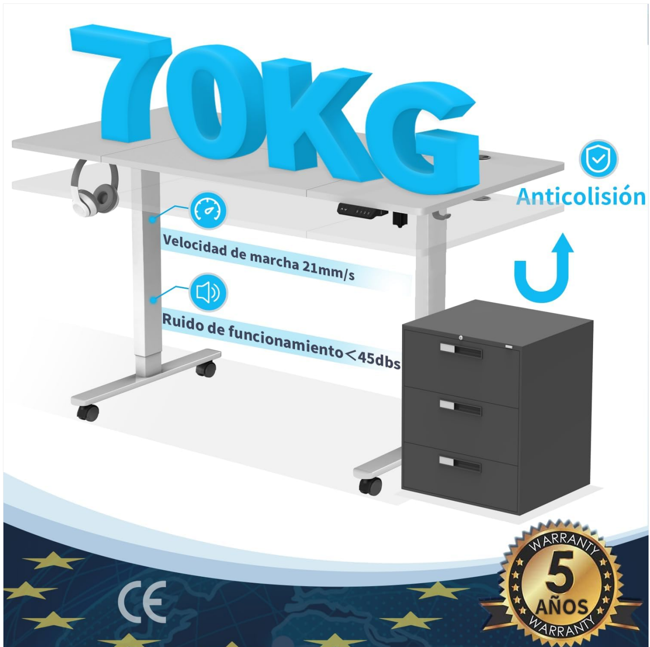
Image: Desk highlighting 70KG load capacity, anti-collision system, 21mm/s lift speed, and quiet operation (under 45dB).