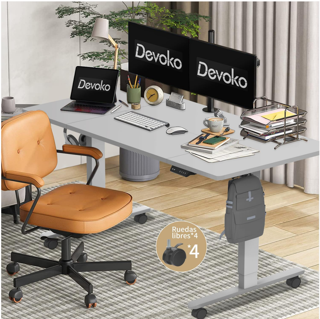
Image: Desk dimensions (160cm x 80cm) with protective edge detail.