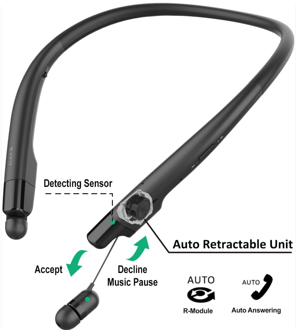
Figure 5.3: Auto Retractable Unit. This image shows the detecting sensor and the auto-retractable unit, indicating how pulling the earbud accepts a call and retracting it declines or pauses music.

Your browser does not support the video tag.