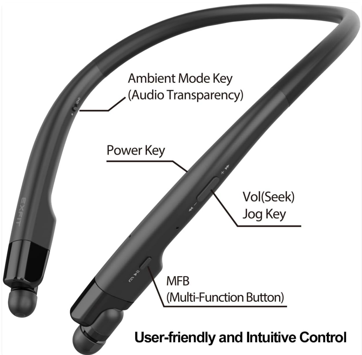
Figure 3.2: User-friendly and Intuitive Control Buttons. This image highlights the location of the Power Key, Ambient Mode Key (Audio Transparency), Vol(Seek) Jog Key, and Multi-Function Button (MFB) on the neckband.