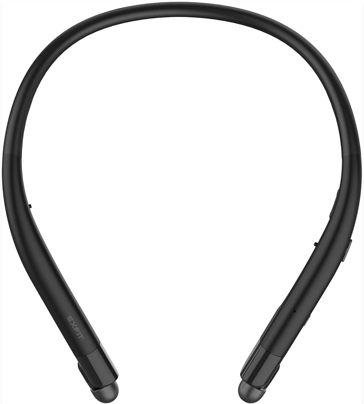
Figure 3.1: EXFIT BCS-700 Pro Neckband Wireless Headphones. This image shows the overall design of the headphones, featuring a flexible neckband and retractable earbuds.