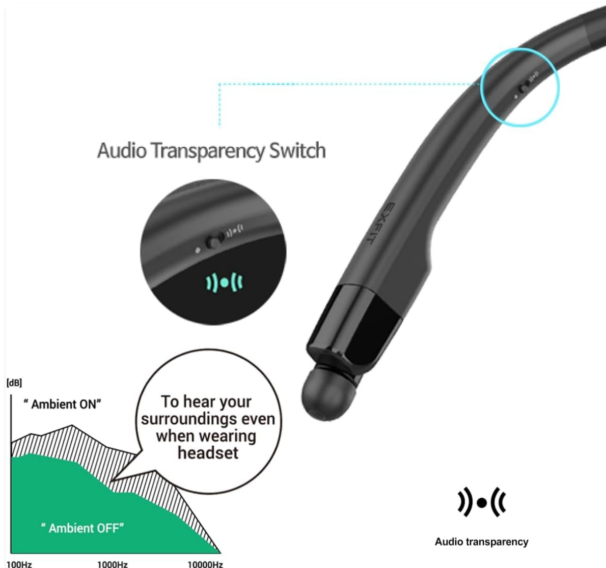
Figure 5.1: Audio Transparency Switch. This image shows the location of the switch to activate or deactivate the ambient sound feature, allowing users to hear their surroundings.