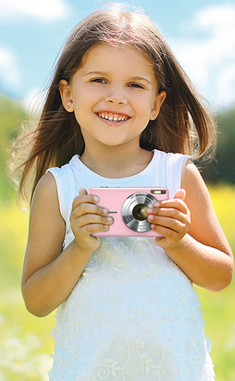
Image: The self-timer feature with 2, 5, and 10-second options, useful for capturing group photos.