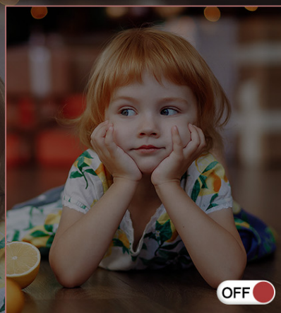
Image: The 5-Axis Image Stabilization feature, which effectively prevents image blur during movement.