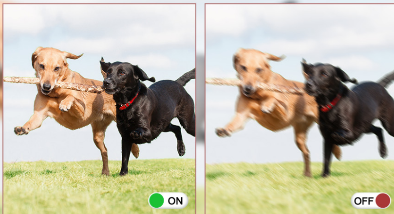
Image: The camera's capability to capture both video and high-resolution photos, perfect for special occasions.