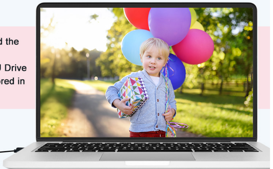
Image: A demonstration of the 20 creative filter effects available for artistic photo capture.