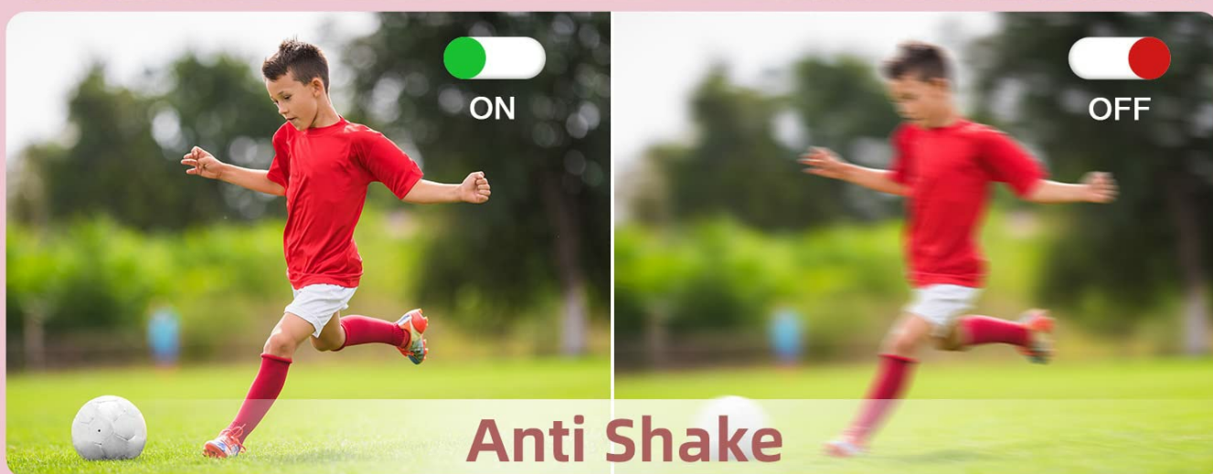
Image: The camera's self-timer, continuous shooting, and anti-shake functions in action.