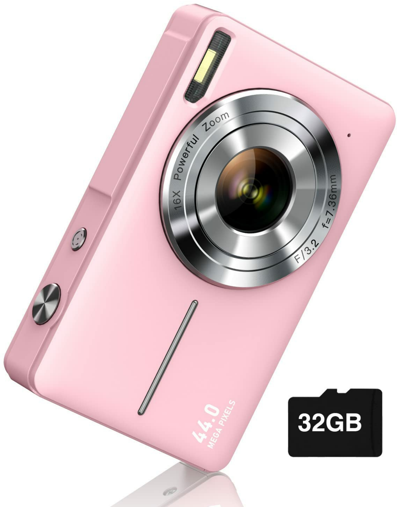
Image: The CAMKORY Digital Camera in pink, shown alongside a 32GB SD card, highlighting its compact design and included storage.