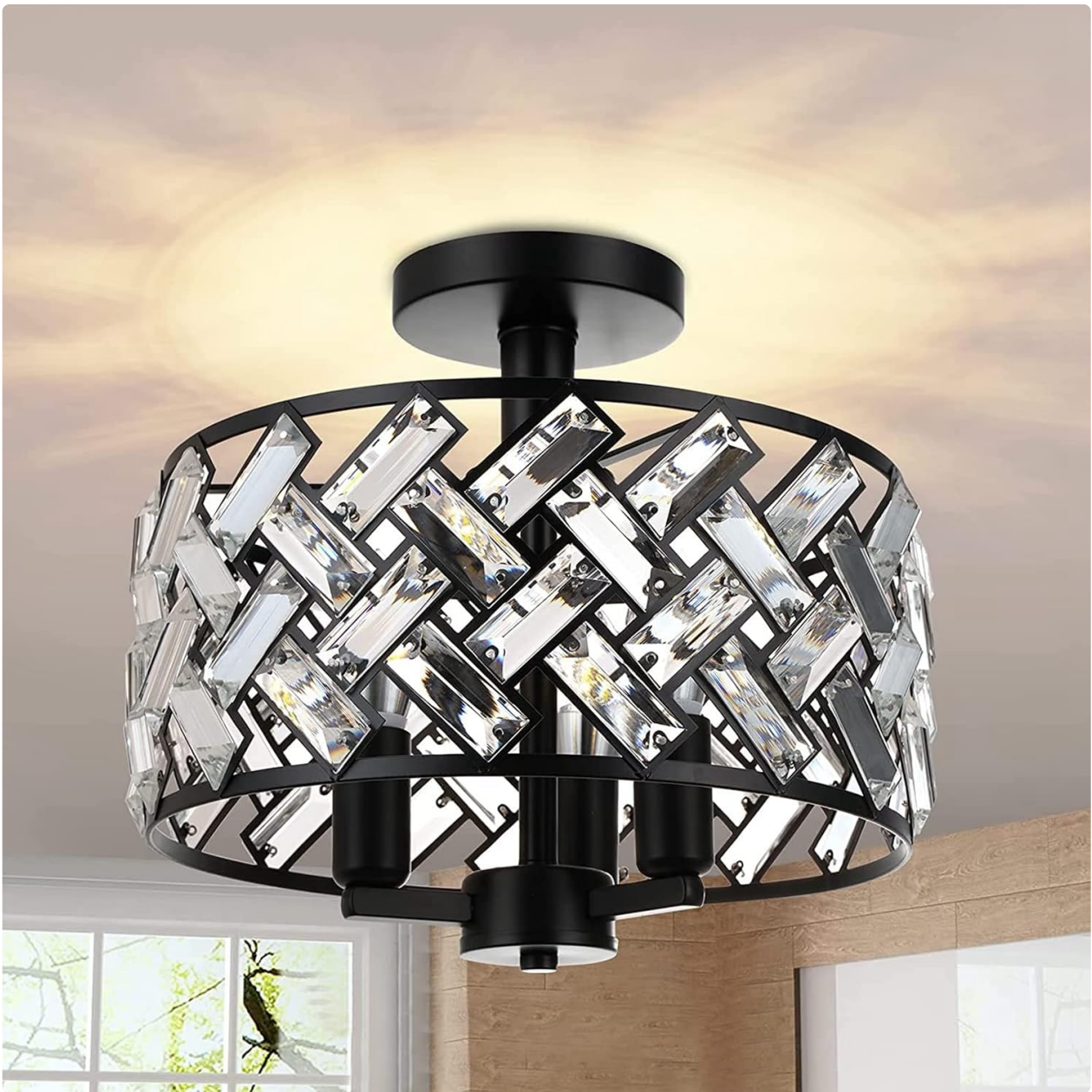
Figure 1: FRIDEKO HOME Semi Flush Mount Ceiling Light