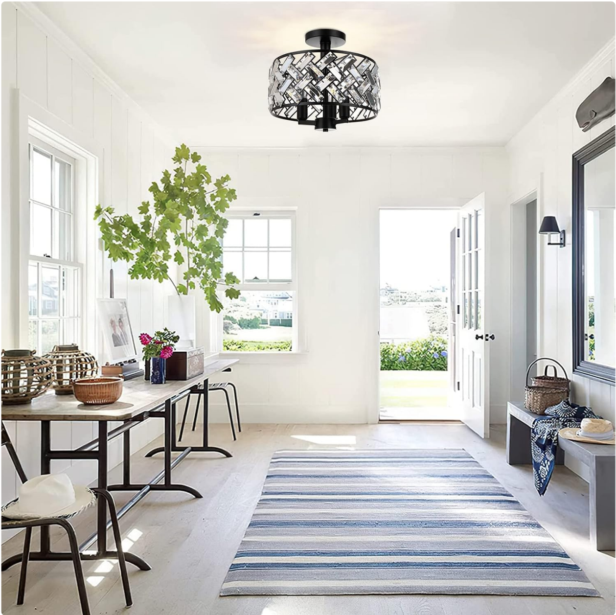
Figure 4: Example of installed light in a hallway