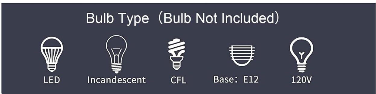
Figure 3: Product Dimensions and Bulb Compatibility