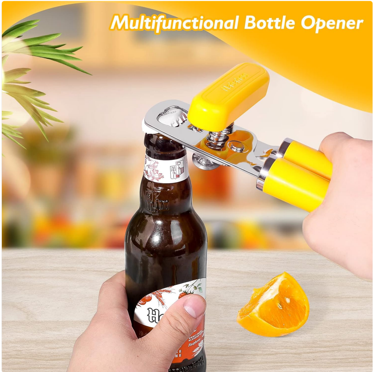
Image 4.2: Demonstration of using the multifunctional bottle opener.