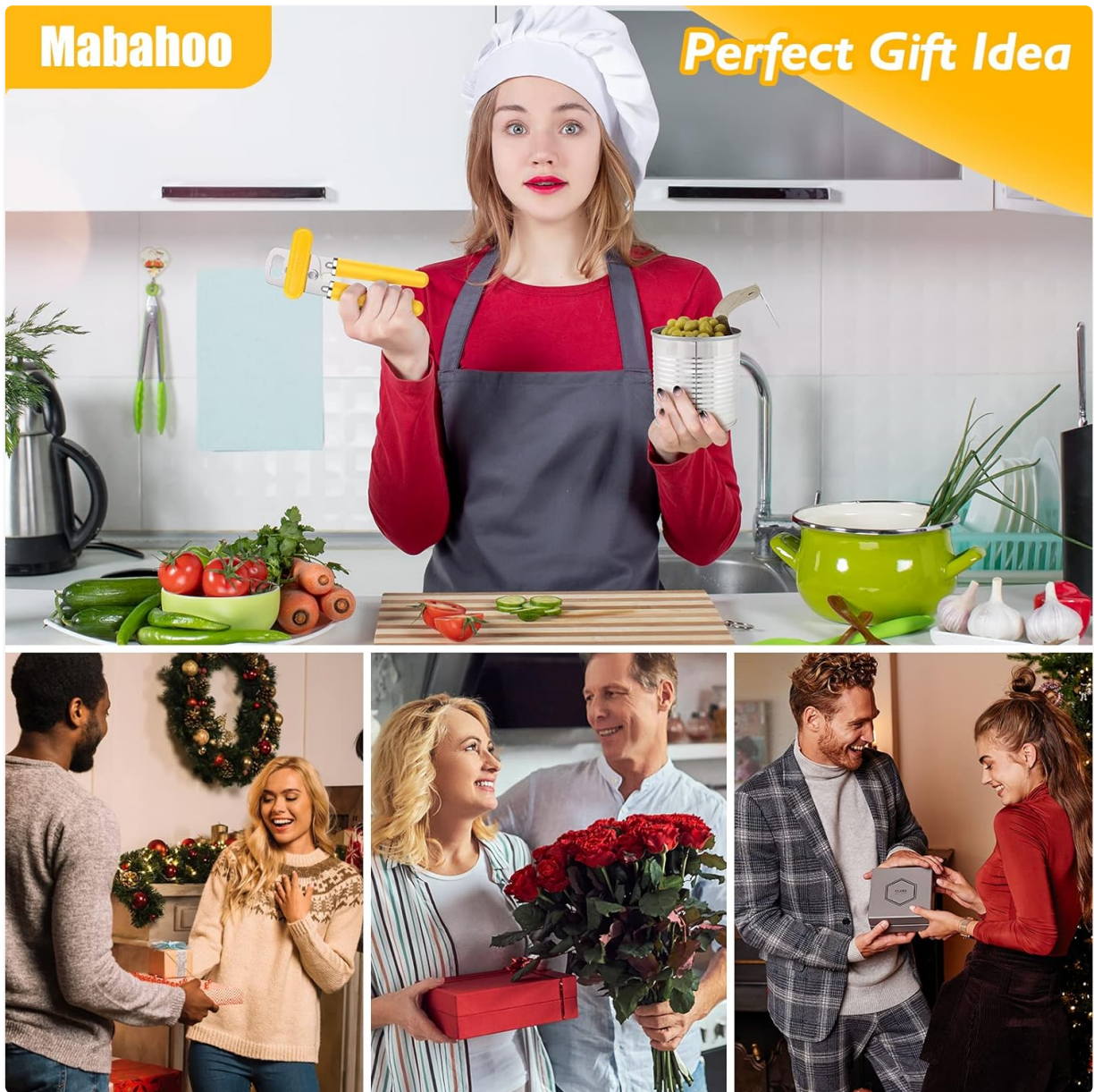
Image 3.2: Features of the Mabahoo Can Opener, including its dimensions and ergonomic design.