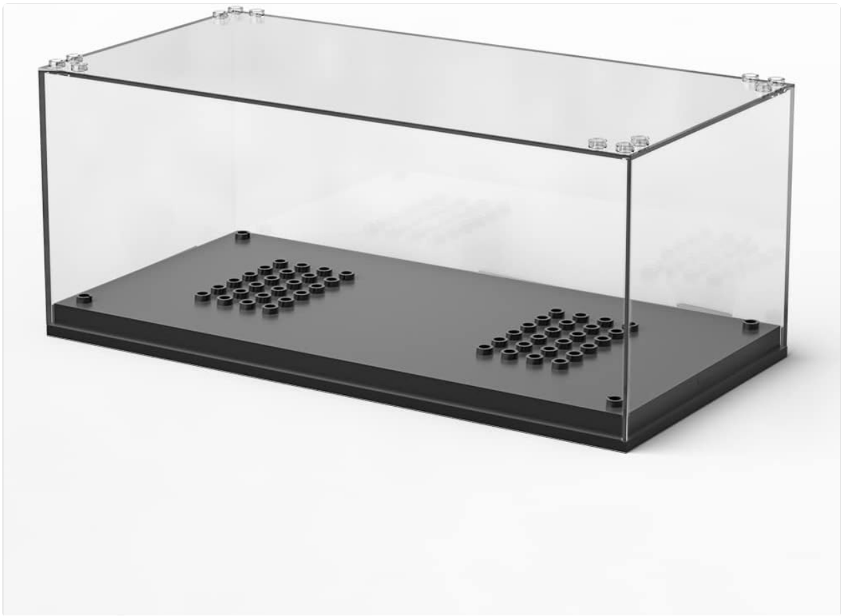
Image 4.1: The fully assembled Mould King Clear Display Case, showing the transparent acrylic panels and the black base with studs for model placement.