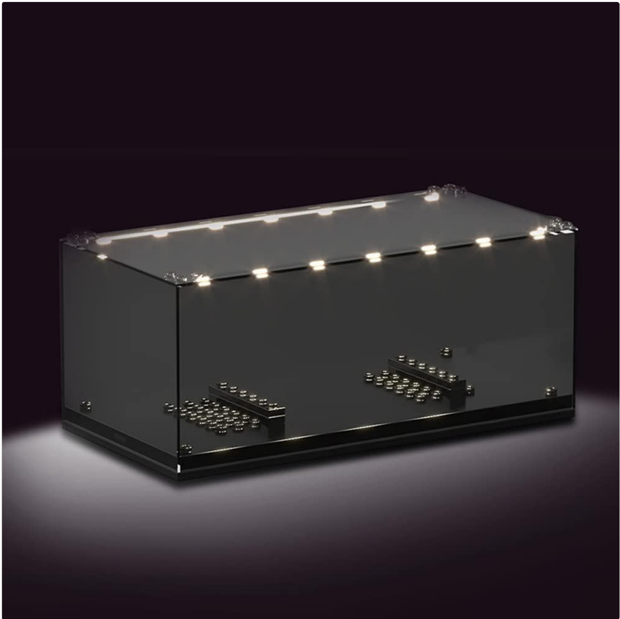
Image 5.1: The display case with its LED lights activated, providing illumination for the displayed model.