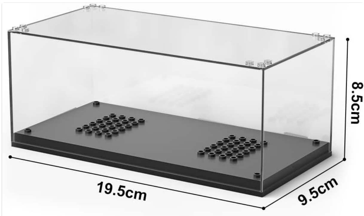
Image 8.1: Detailed dimensions of the display case, indicating its length, width, and height for compatibility assessment.