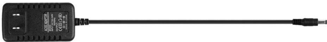
Image: The CJP-Geek AC Adapter demonstrating its compact size and portability, suitable for use in various environments such as home, office, or while traveling.