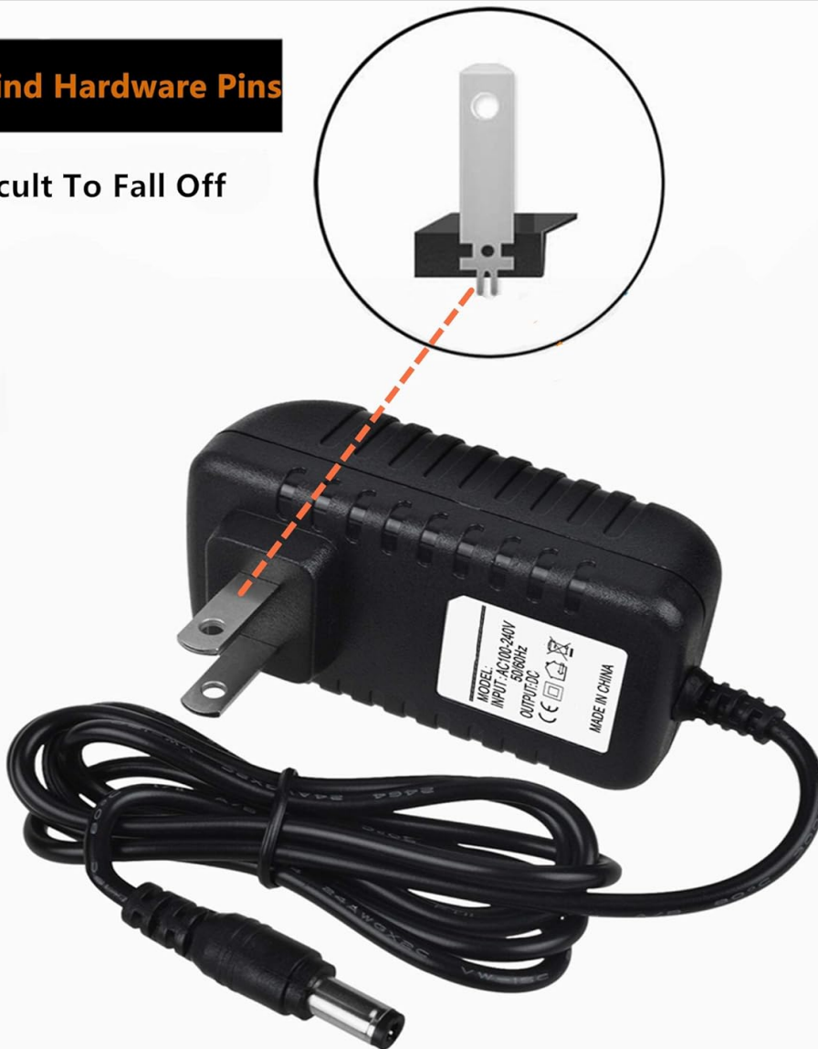
Image: The CJP-Geek AC Adapter highlighting its built-in safety protections, including short circuit, over-current, over-voltage, and over-temperature protection, along with the CE certification mark.