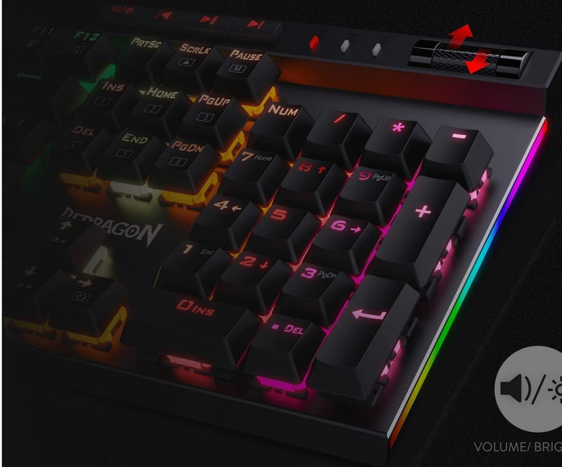
Image 3.3: The dedicated scroll bar on the Redragon K580 VATA keyboard for adjusting system volume and keyboard backlight brightness.

THE BAR IS DESIGNED AT TOP RIGHT ALLOWS ADJUSTMENT OF SYSTEM VOLUME / KEYBOARD BACKLIGHT BRIGHTNESS.