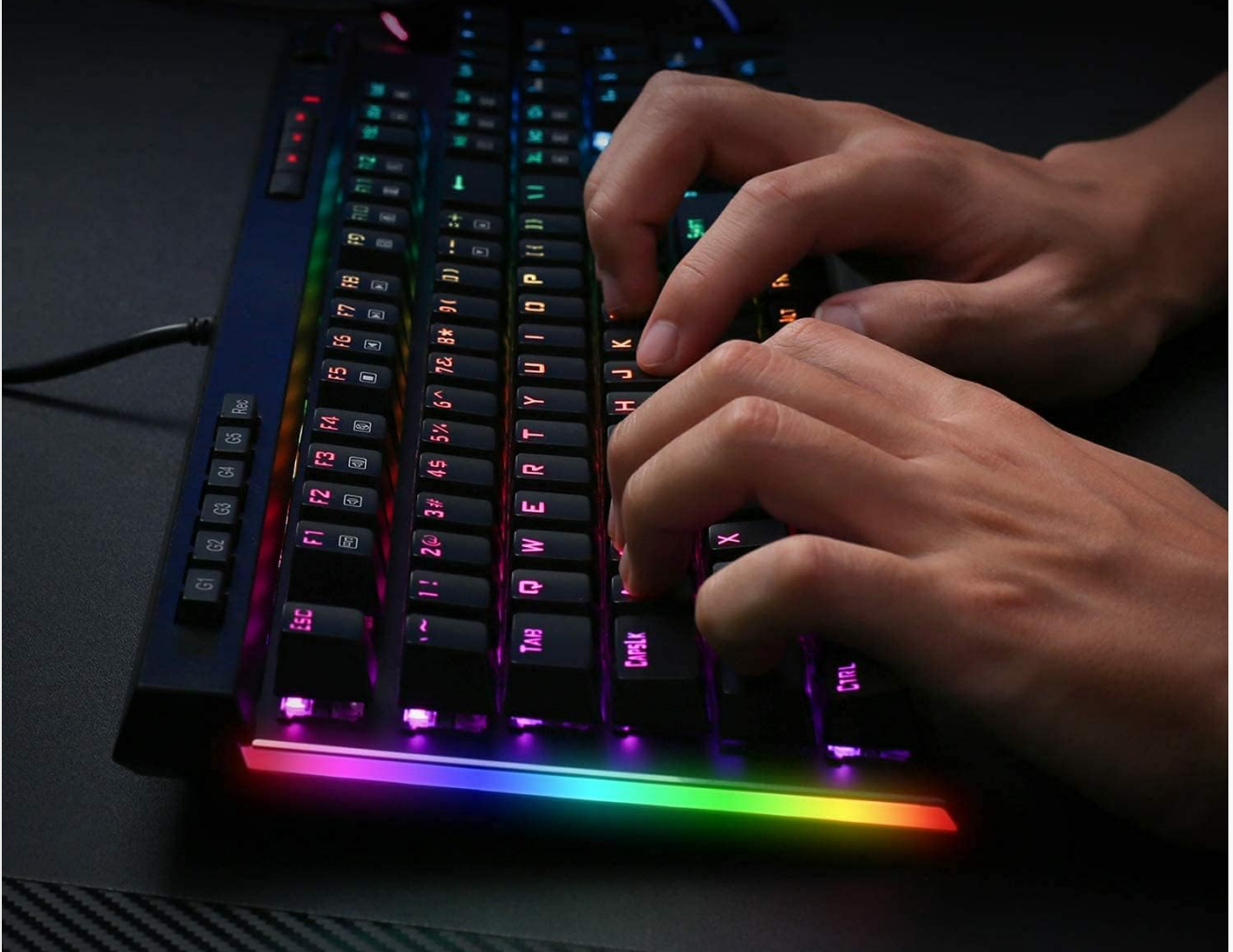
Image 3.4: A user's hands positioned comfortably on the Redragon K580 VATA keyboard, highlighting the ergonomic wrist rest.

KEEP YOU SATISFIED WITH NOT ONLY FROM KILLING AND LOOTING BUT ALSO KILL YOUR FATIGUE