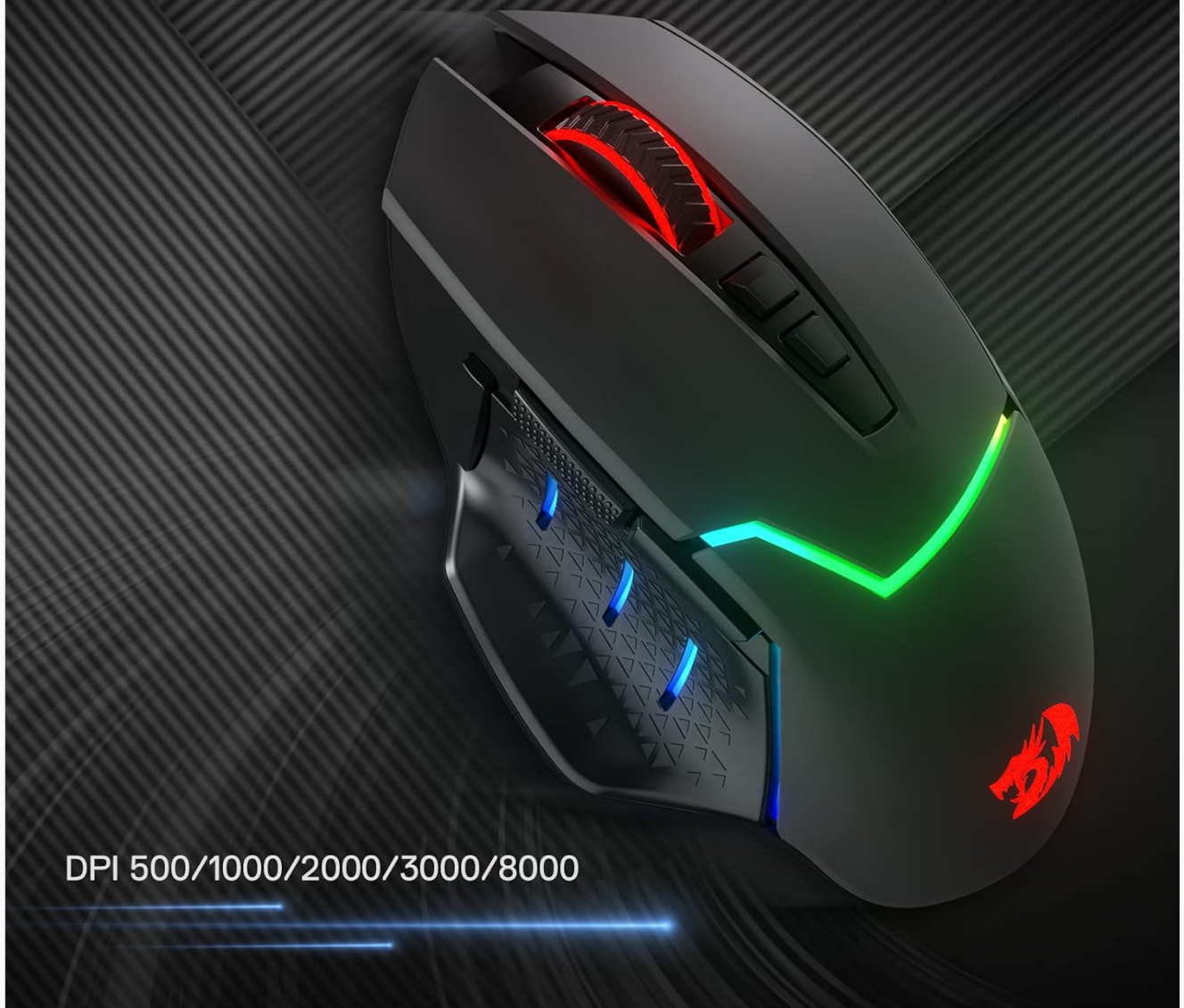
Image 4.2: The Redragon M690 PRO mouse demonstrating its 2.4GHz wireless connection via a USB receiver.