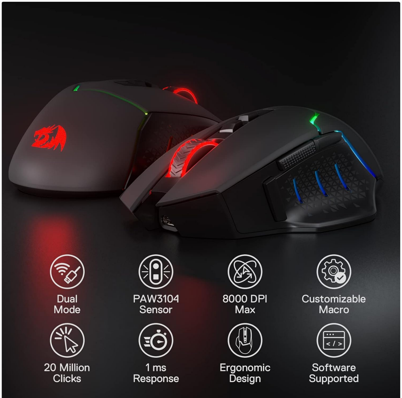
Image 4.1: The Redragon M690 PRO Wireless Gaming Mouse, showcasing its design.