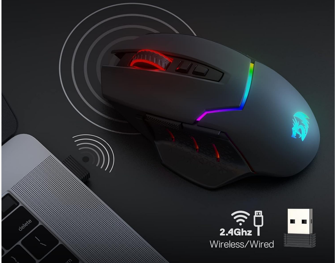
Image 4.4: Overview of key features for the Redragon M690 PRO Wireless Gaming Mouse.

Stable 2.4Ghz Transmission at Max 10m(32.8ft) Range