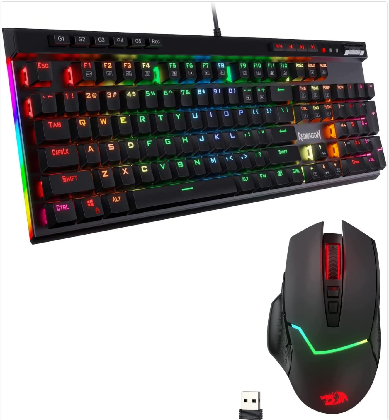
Image 1.1: The Redragon K580 VATA RGB Mechanical Gaming Keyboard and M690 PRO Wireless Gaming Mouse, along with the USB receiver.