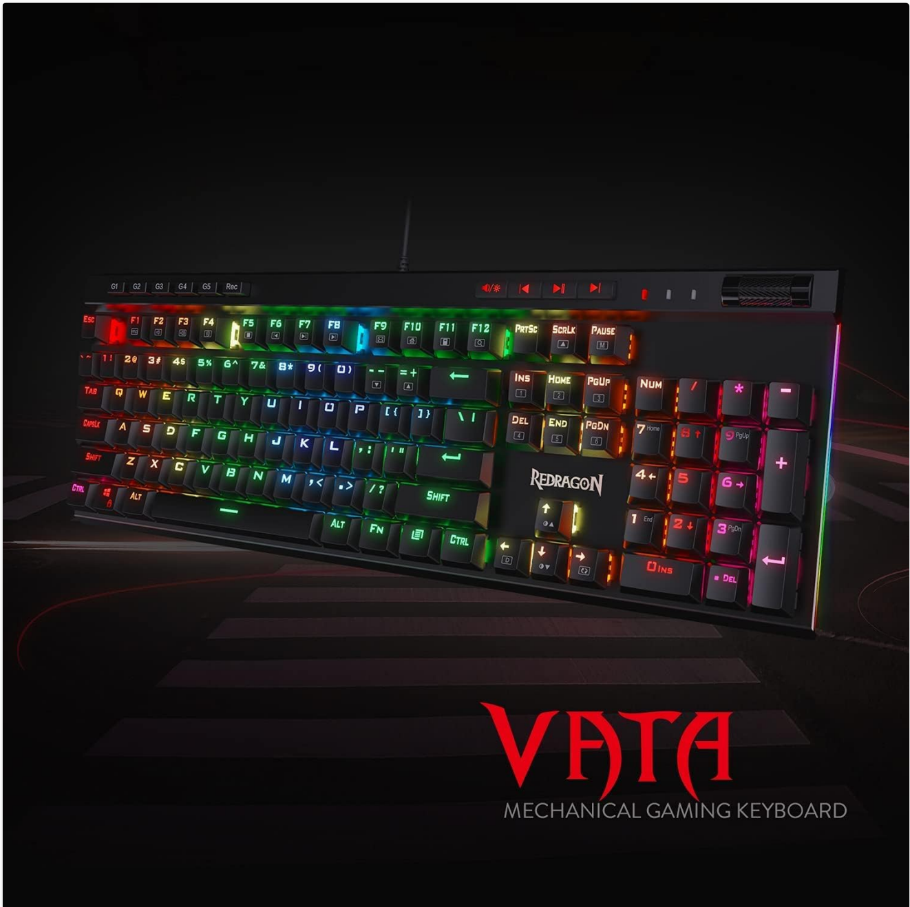
Image 3.1: The Redragon K580 VATA Mechanical Gaming Keyboard with RGB backlighting.

The Redragon K580 VATA keyboard offers a range of features for an optimized gaming and typing experience.