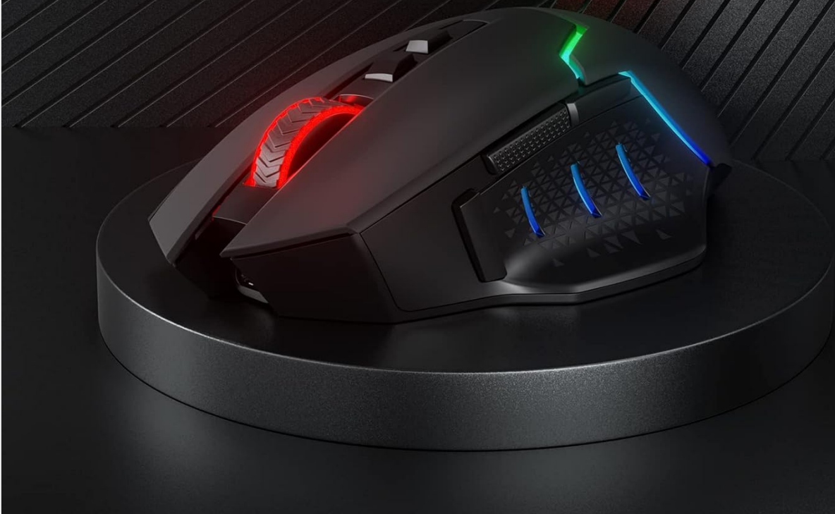
Image 4.3: The Redragon M690 PRO mouse highlighting its 5 adjustable DPI settings.