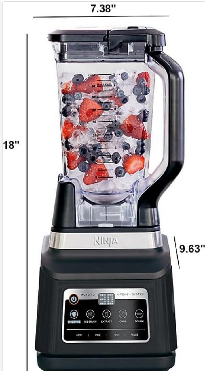
Figure 8: Product dimensions for space planning.