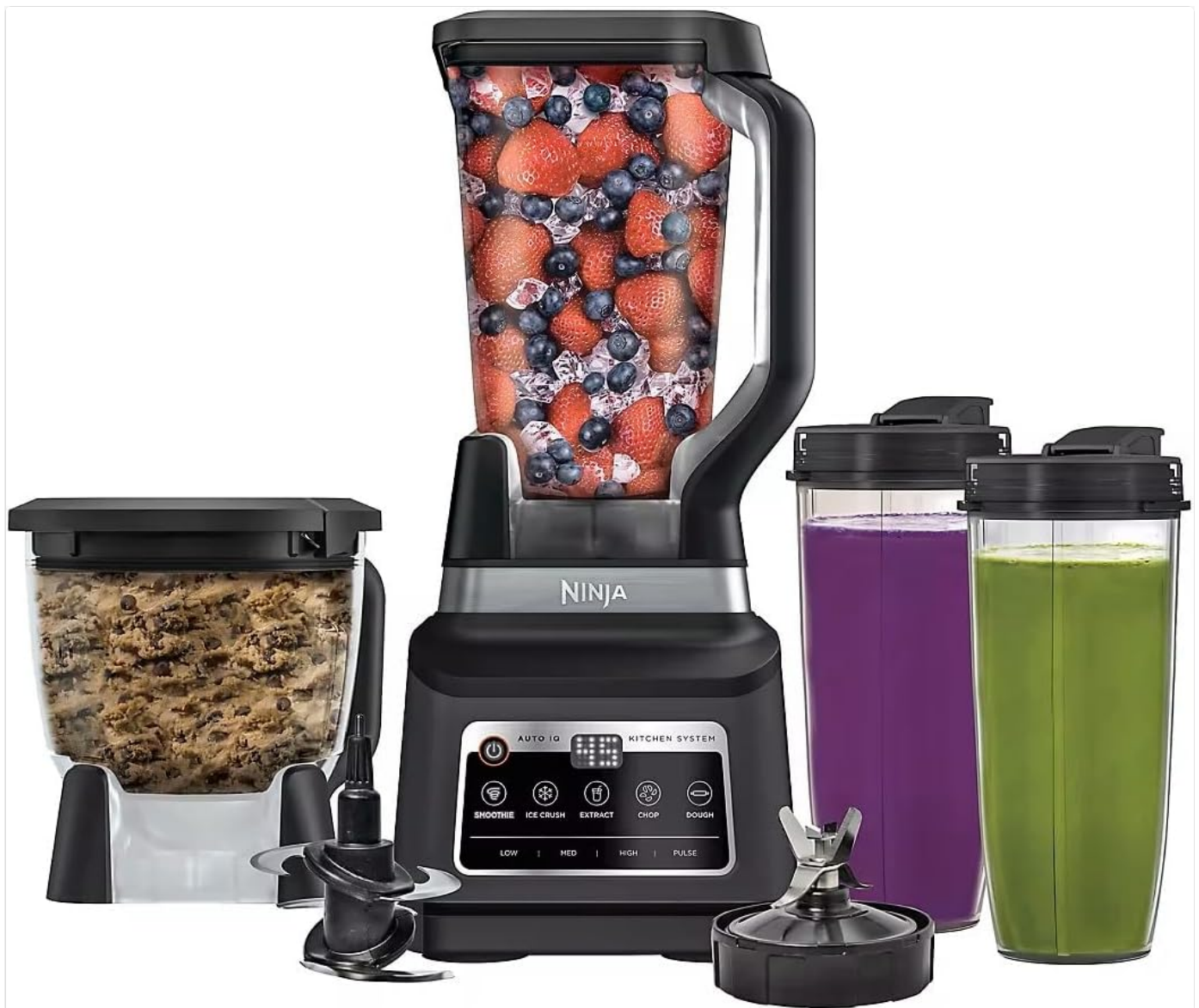
Figure 1: Overview of the Ninja BN805A Pro Plus Kitchen System components.