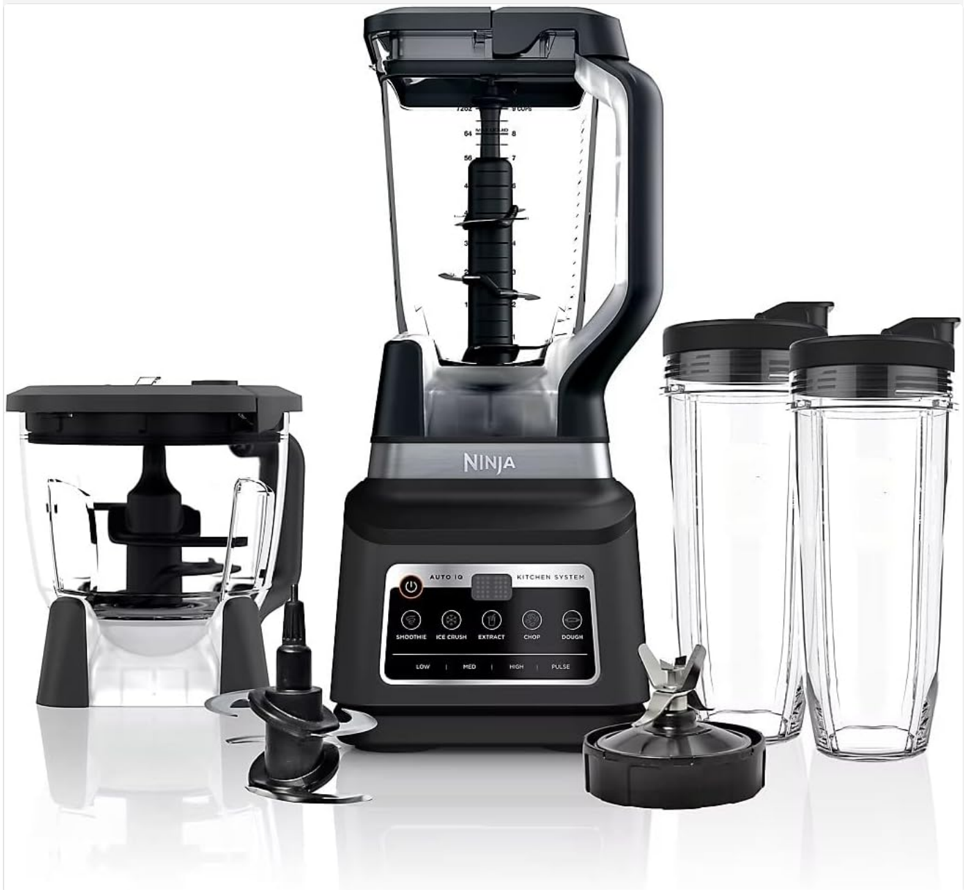
Figure 2: All included components of the Ninja Kitchen System.