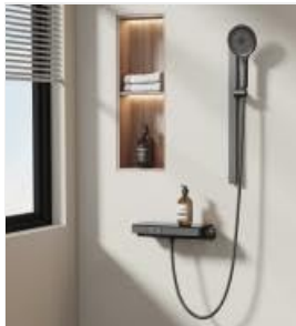
Modern wall-mounted shower head and hand-held shower system in chrome finish, installed on a white bathroom wall with a built-in storage niche.