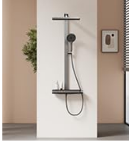
Modern shower system installation showing mounted rain shower head and hand-held sprayer on a white bathroom wall.