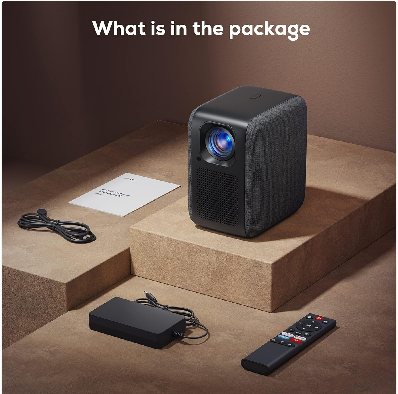
Image showing the iZEEKER Projector, remote control, power adapter, and user manual included in the package.