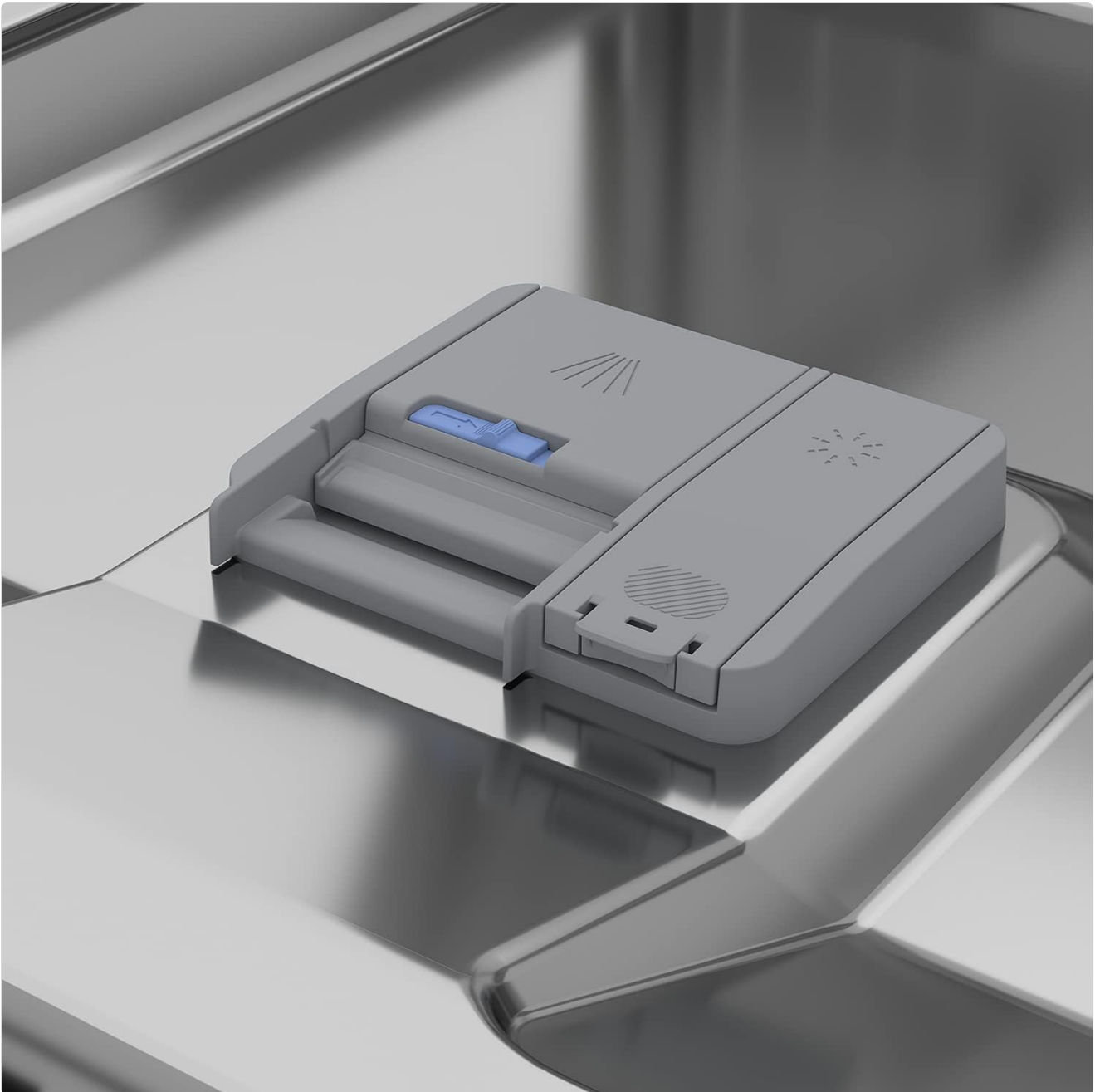
Image 4: The detergent and rinse aid dispenser located on the inside of the dishwasher door, ready for filling.