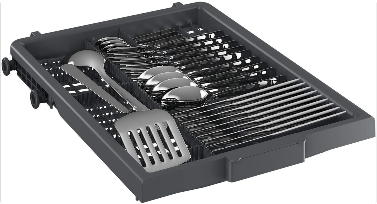
Image 3: A close-up view of the third cutlery tray, showing organized placement of knives, forks, and spoons for thorough washing.