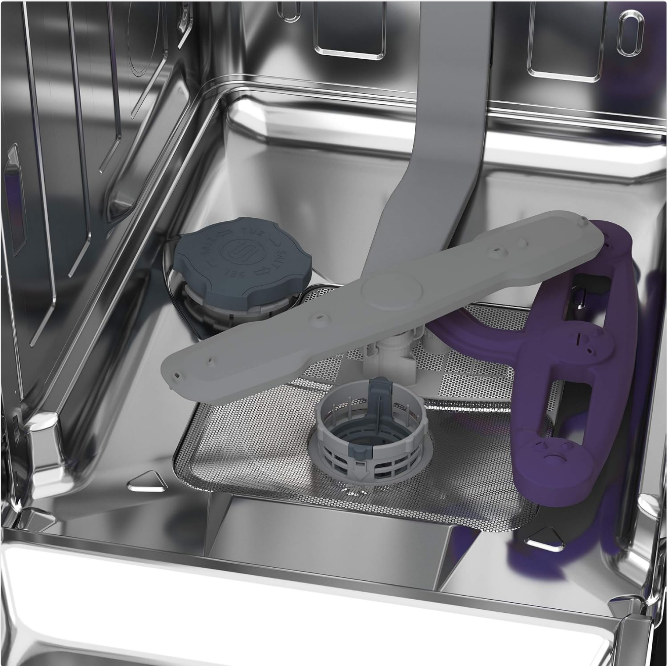
Image 5: Interior view of the dishwasher, highlighting the filter assembly at the bottom and the lower spray arm.

4. Reassemble the filters in reverse order, ensuring they are securely locked in place.