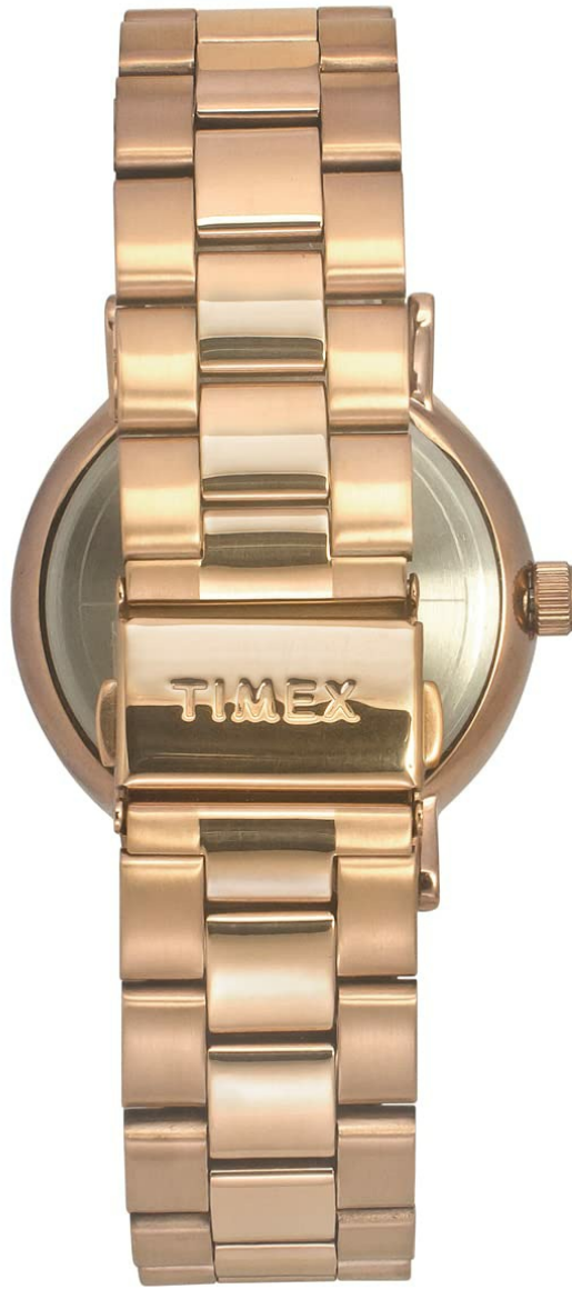
Figure 3.1: View of the watch's stainless steel band and clasp mechanism. Proper band adjustment ensures comfort and security on the wrist.