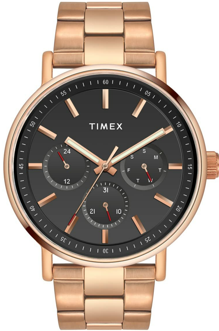
Figure 2.1: Front view of the TIMEX Analog Watch TWEG20018. This image shows the watch face with its black dial, hour markers, and hands, encased in a gold-tone brass case with a matching stainless steel band.