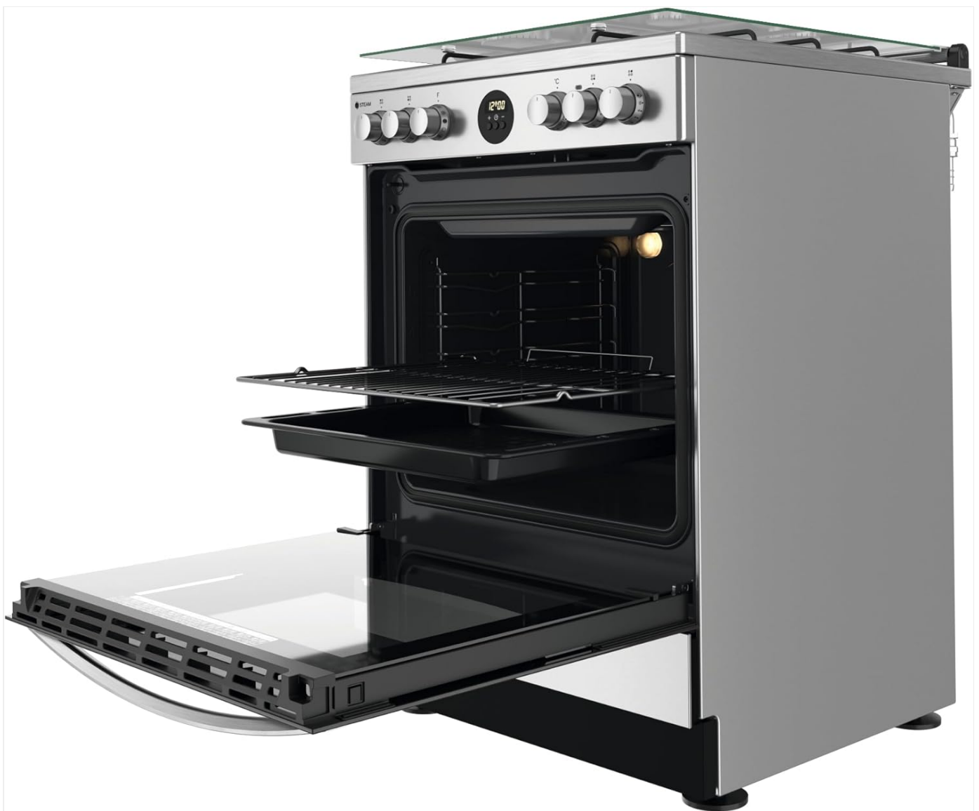
Figure 5.1: The oven interior with the door open, highlighting the removable inner glass for easy cleaning and the adjustable oven racks.

The inner glass door of the oven can be easily removed in two simple steps for thorough cleaning. This feature, known as "Click and Clean," facilitates access to all glass surfaces.