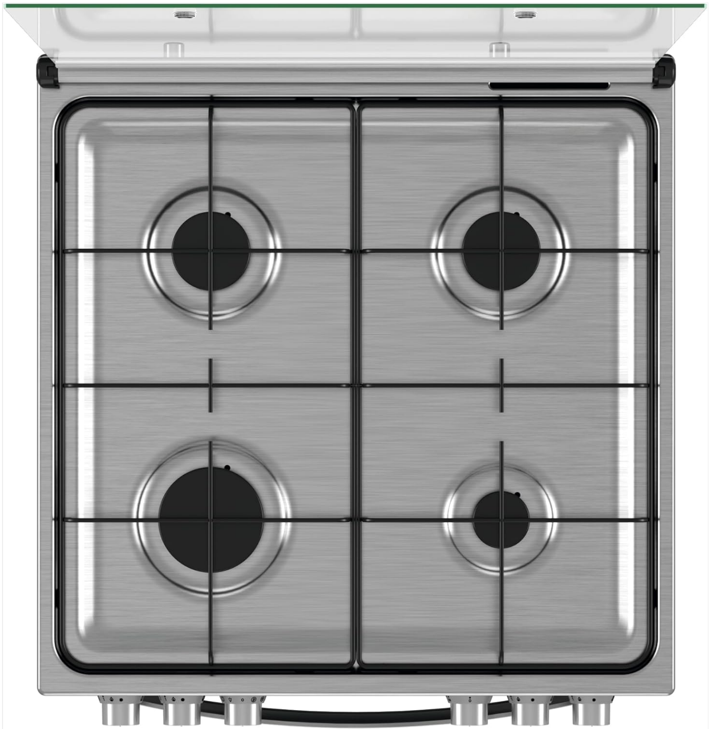
Figure 4.1: Top view of the gas hob, showing the four burners and the enameled cast-iron effect grids.