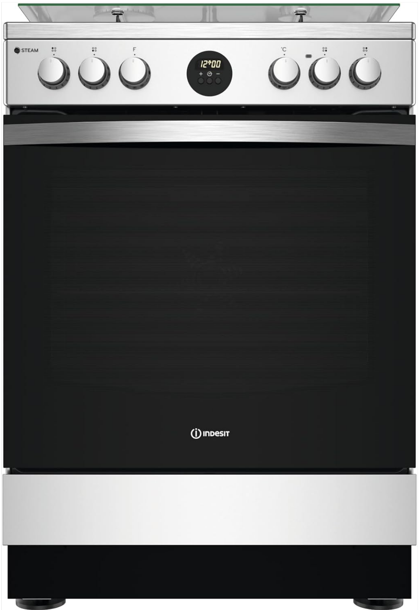
Figure 1.1: Front view of the Indesit IS67G8CHX/E Gas Cooker, showcasing the control panel, oven door, and gas hob cover.