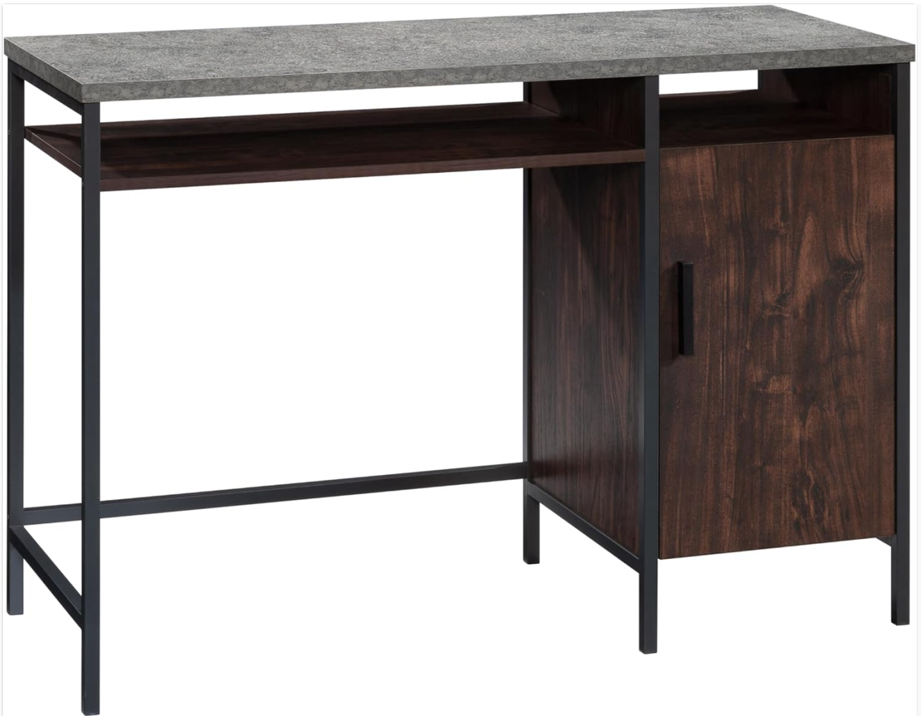
Image 1.1: The Sauder Market Commons Single Pedestal Desk, showcasing its rich walnut finish and metal frame.