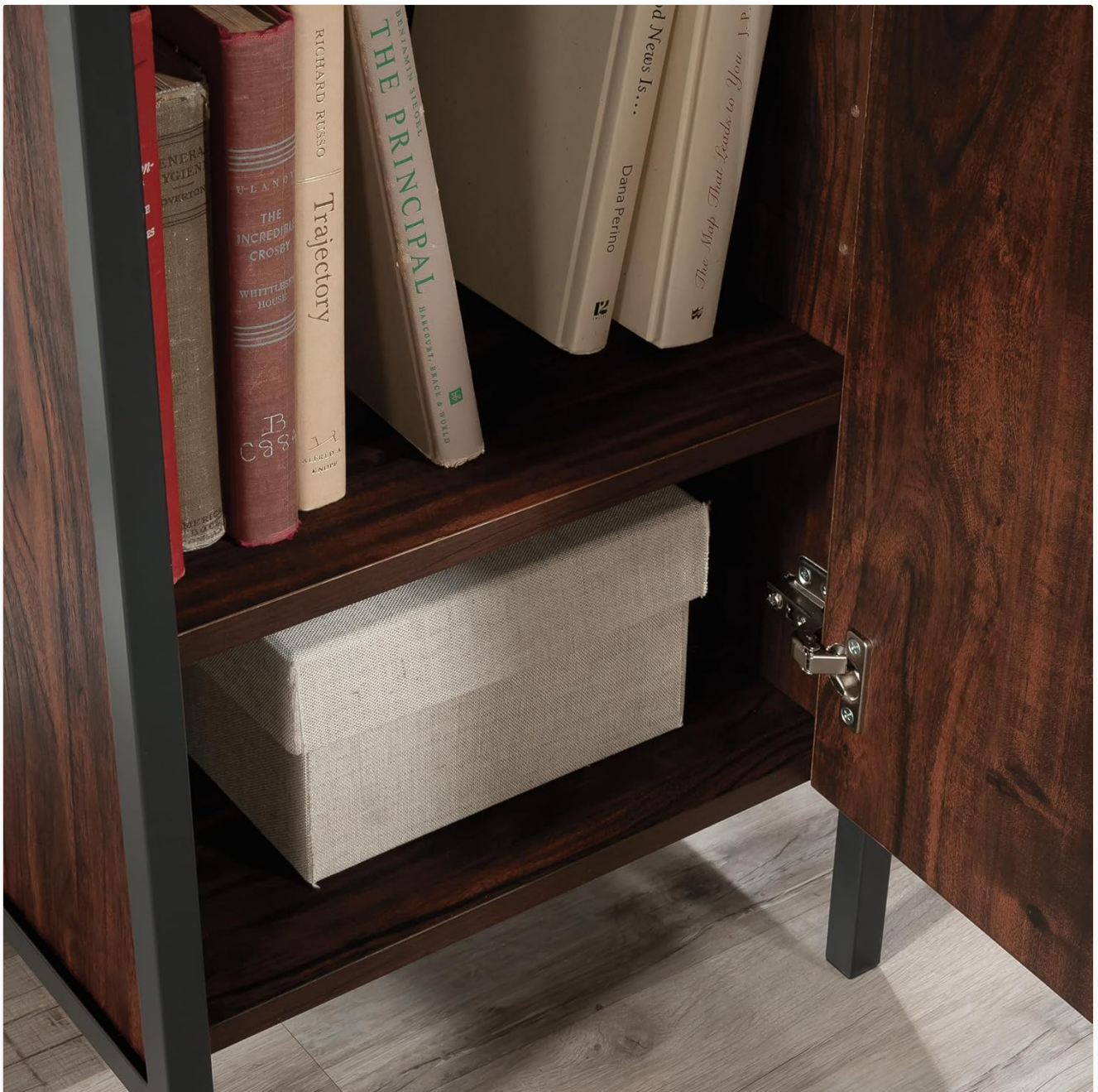
Image 5.1: Detail of the desk's storage compartment, featuring an adjustable shelf for organizing various items.