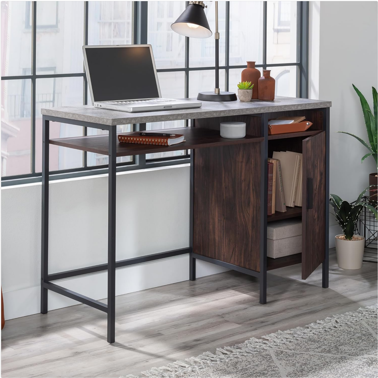
Image 6.1: The desk integrated into a home office, demonstrating its use with a laptop and decorative items.