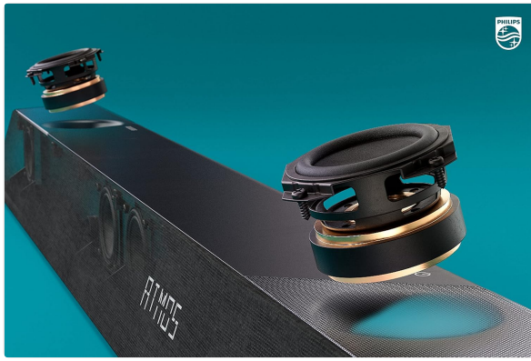
Image: A close-up shot of the soundbar's angled speakers, designed to broaden the soundstage and enhance audio immersion.