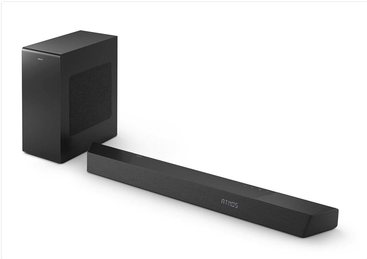
Image: The PHILIPS B8907 Soundbar and its accompanying wireless subwoofer, presented together.