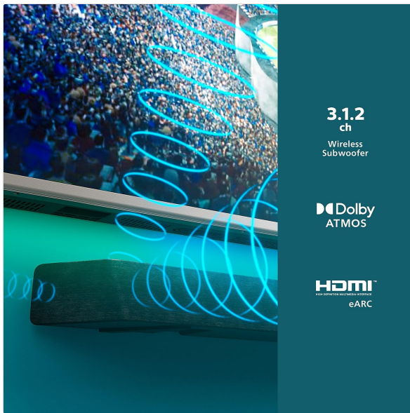
Image: Visual representation highlighting the 3.1.2 channel configuration, Dolby Atmos support, and HDMI eARC connectivity of the soundbar.