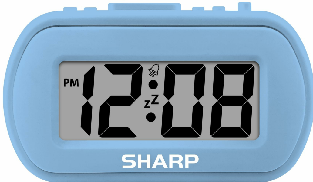
Image: The Sharp SPC483 Digital Alarm Clock, showcasing its compact design and clear digital display.