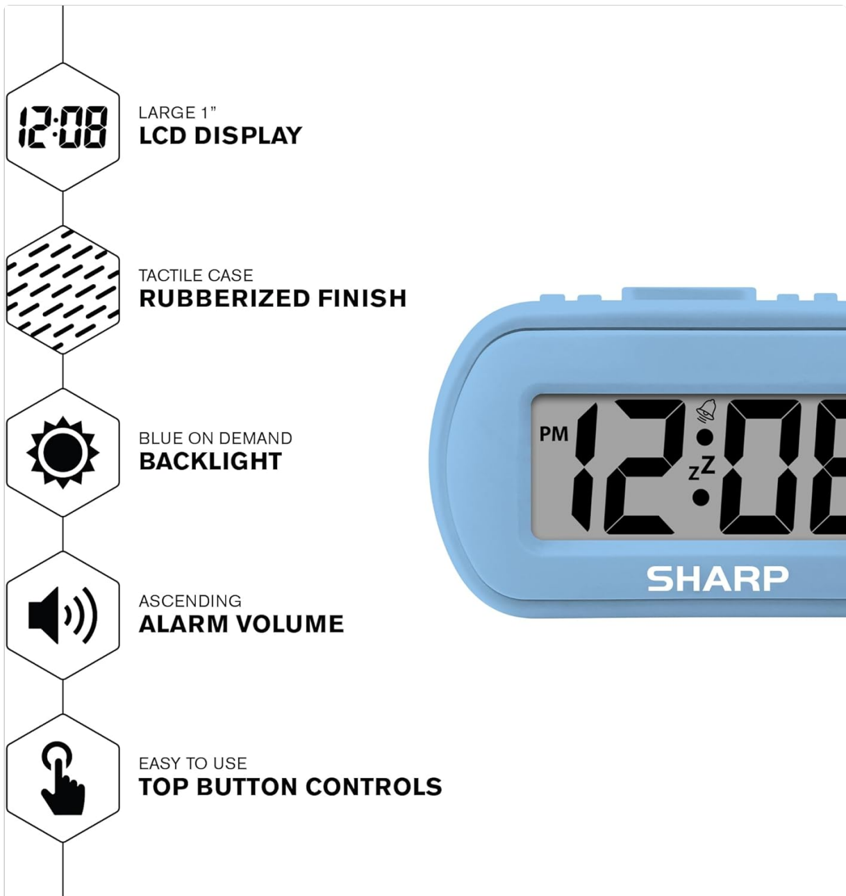
Image: Key features of the Sharp SPC483 Digital Alarm Clock, including its display, finish, backlight, and alarm type.