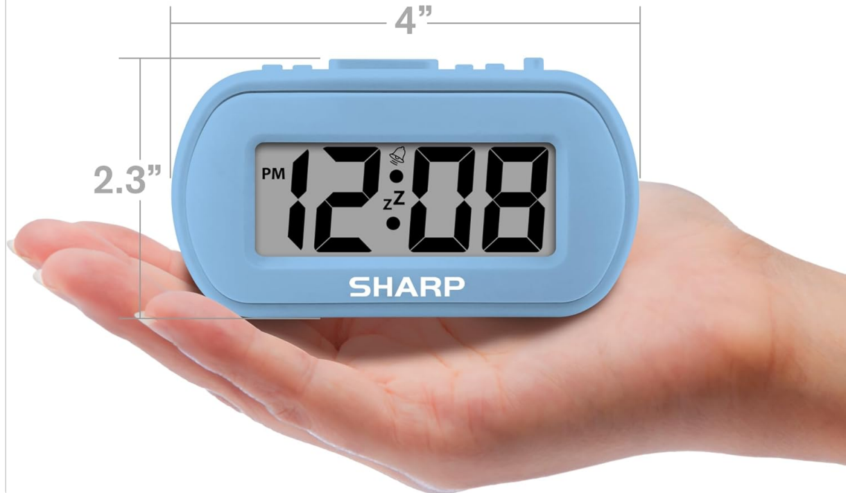
Image: Dimensions of the Sharp SPC483 Digital Alarm Clock, illustrating its compact size.