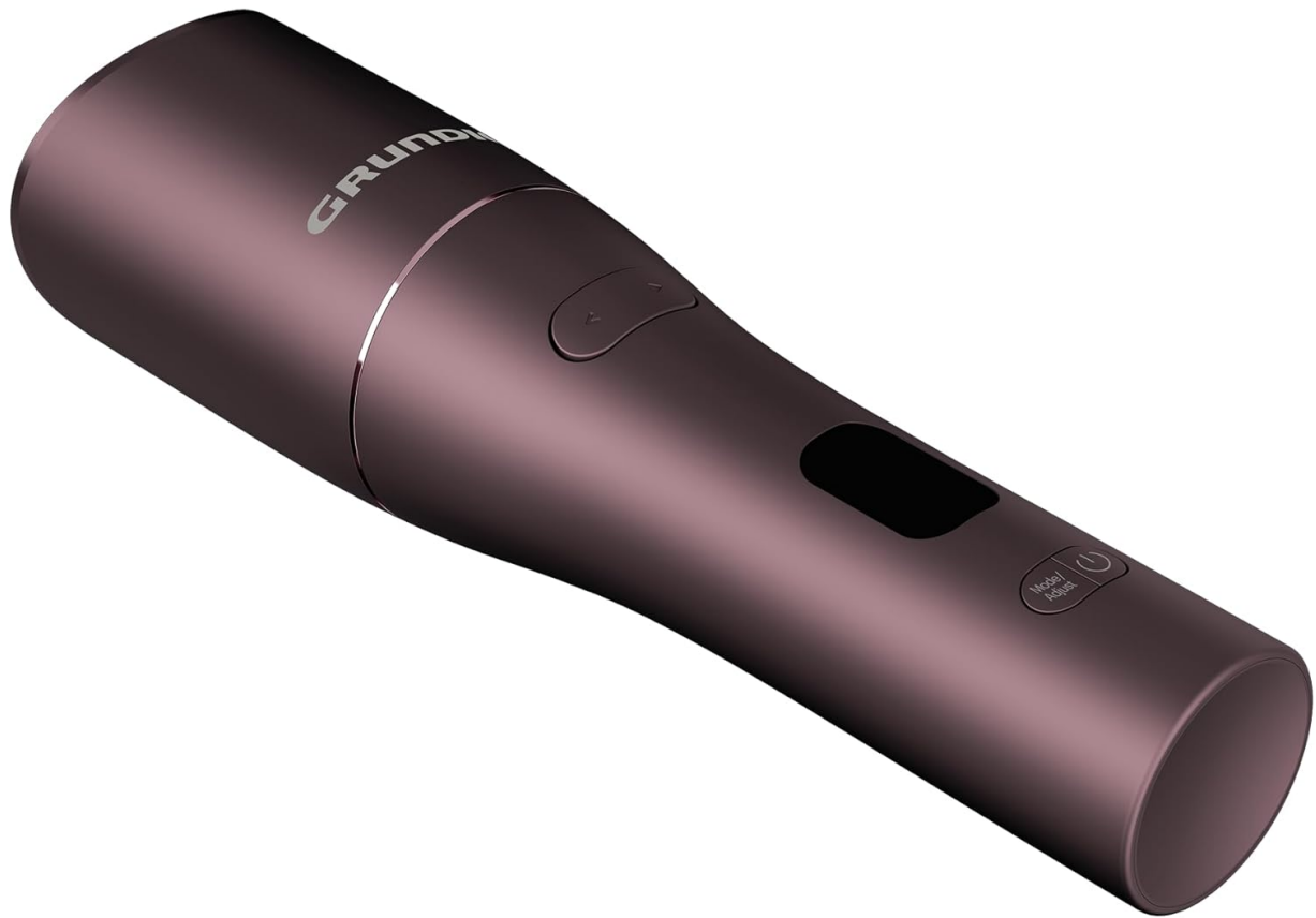
Image 3.1: Back view of the curler, showing the USB charging port.