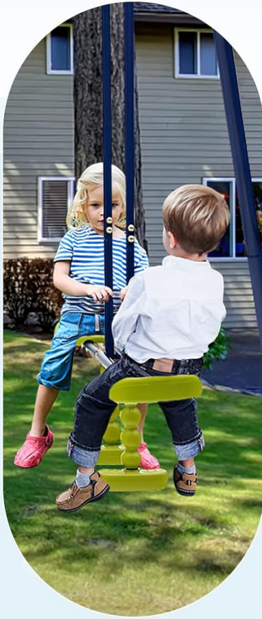
Planeur pour 2 Personnes

Moins de Temps d'Écran et Plus de Divertissement en Plein Air