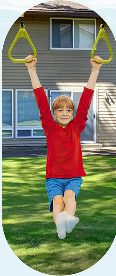
Anneaux de Gymnastique