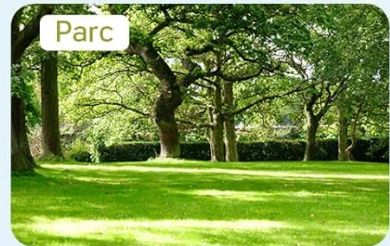
Image: The swing set shown in different outdoor settings, emphasizing its suitability for gardens, yards, and parks.