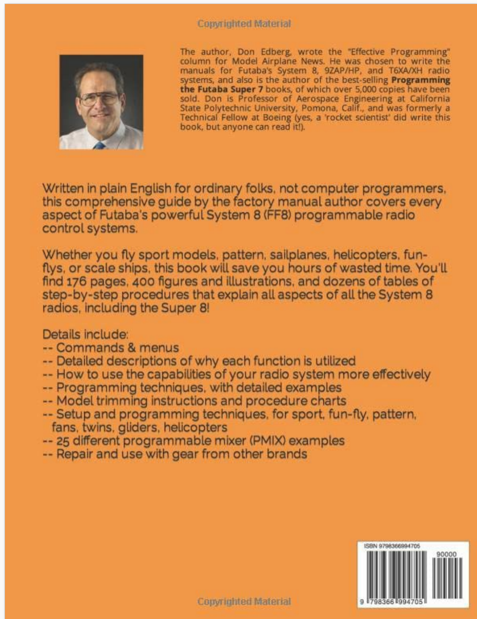
Figure 2: Back cover detailing the author and content summary.