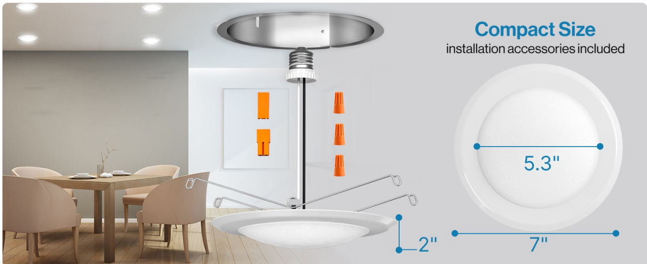
Image: Detailed illustration of the easy installation process, including options for J-Box and E26 can connections.

Your browser does not support the video tag.