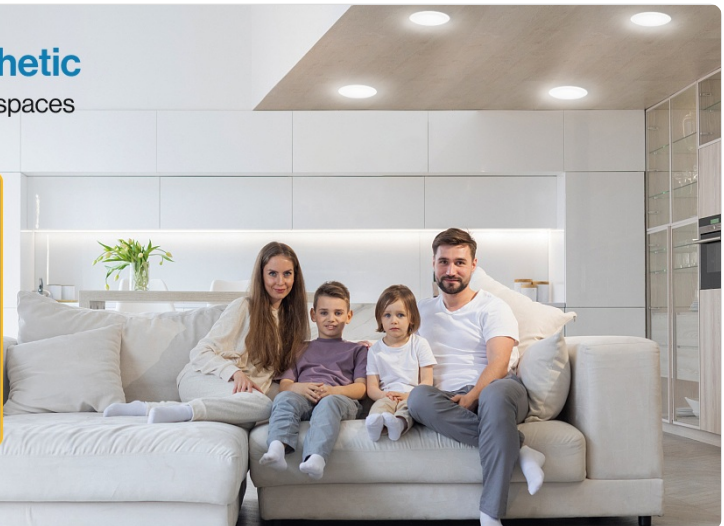
Image: Sunco LED Disc Lights illuminating a modern living area, showcasing key features like brightness and energy efficiency.