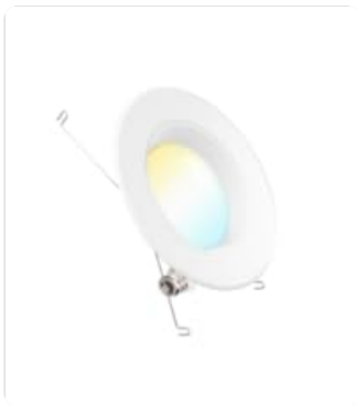
Image: Demonstration of the 10%-100% dimmable range using a compatible dimmer switch.