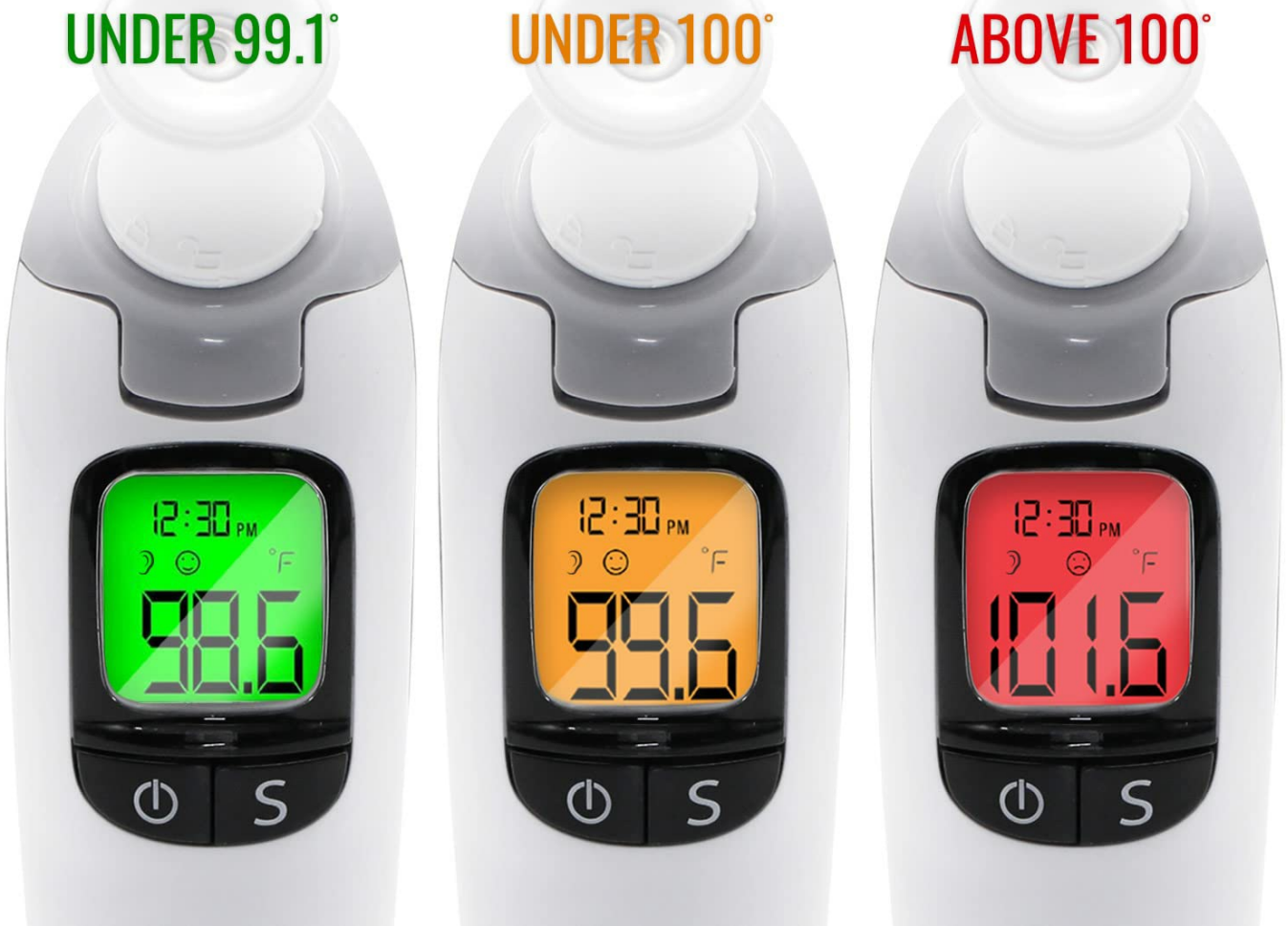
Figure 5: Visual fever alarm with three-color backlit display.