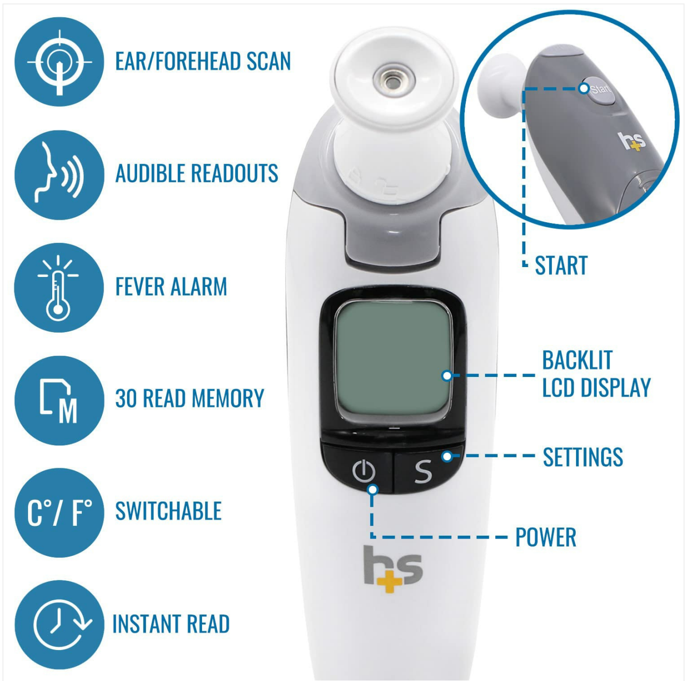
Figure 3: Thermometer controls and display features.