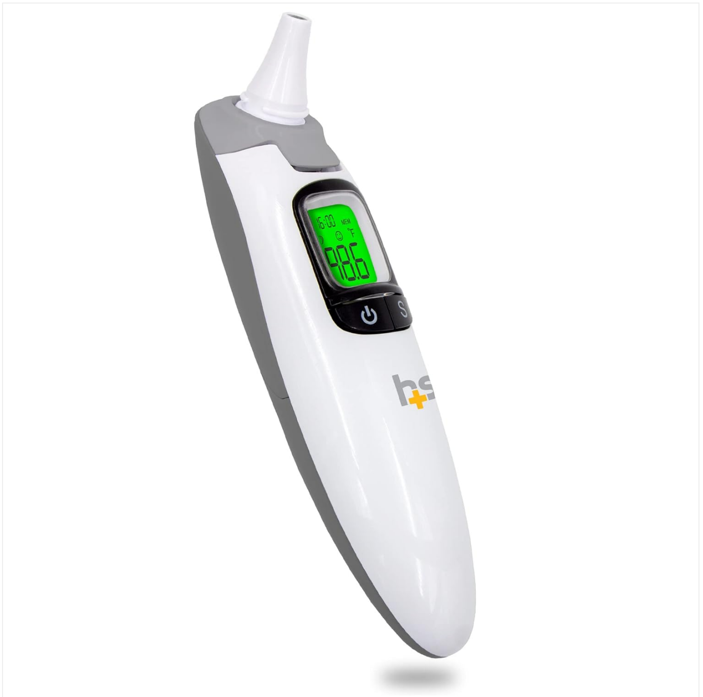
Figure 1: HealthSmart Talking Infrared Ear & Forehead Thermometer.