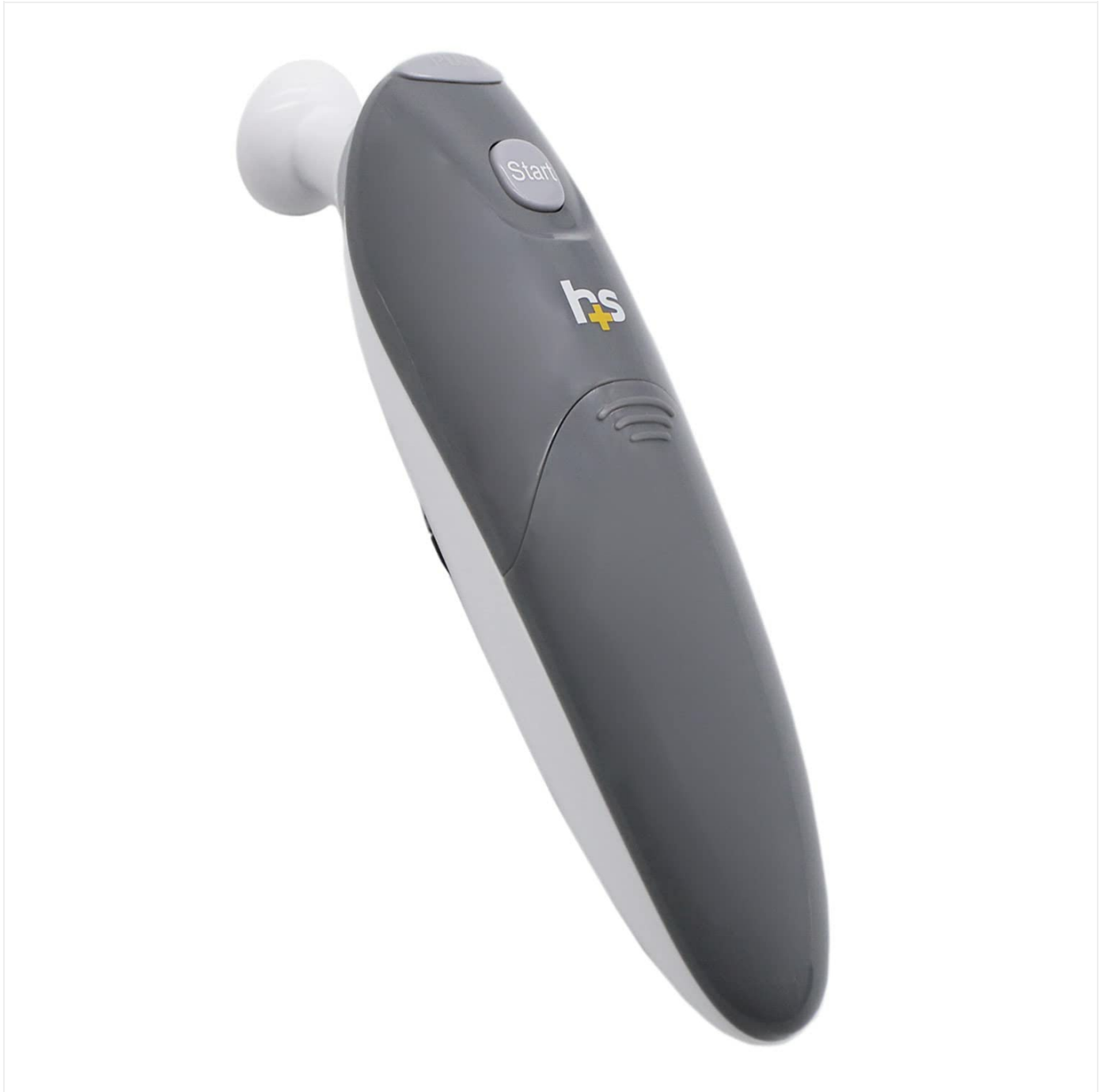
Figure 2: Rear view of the thermometer showing the battery compartment.