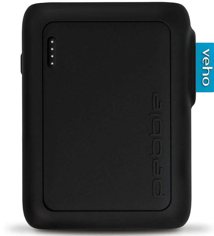
Image 1: Top view of the Veho Pebble PZ-12, highlighting the LED power indicators.