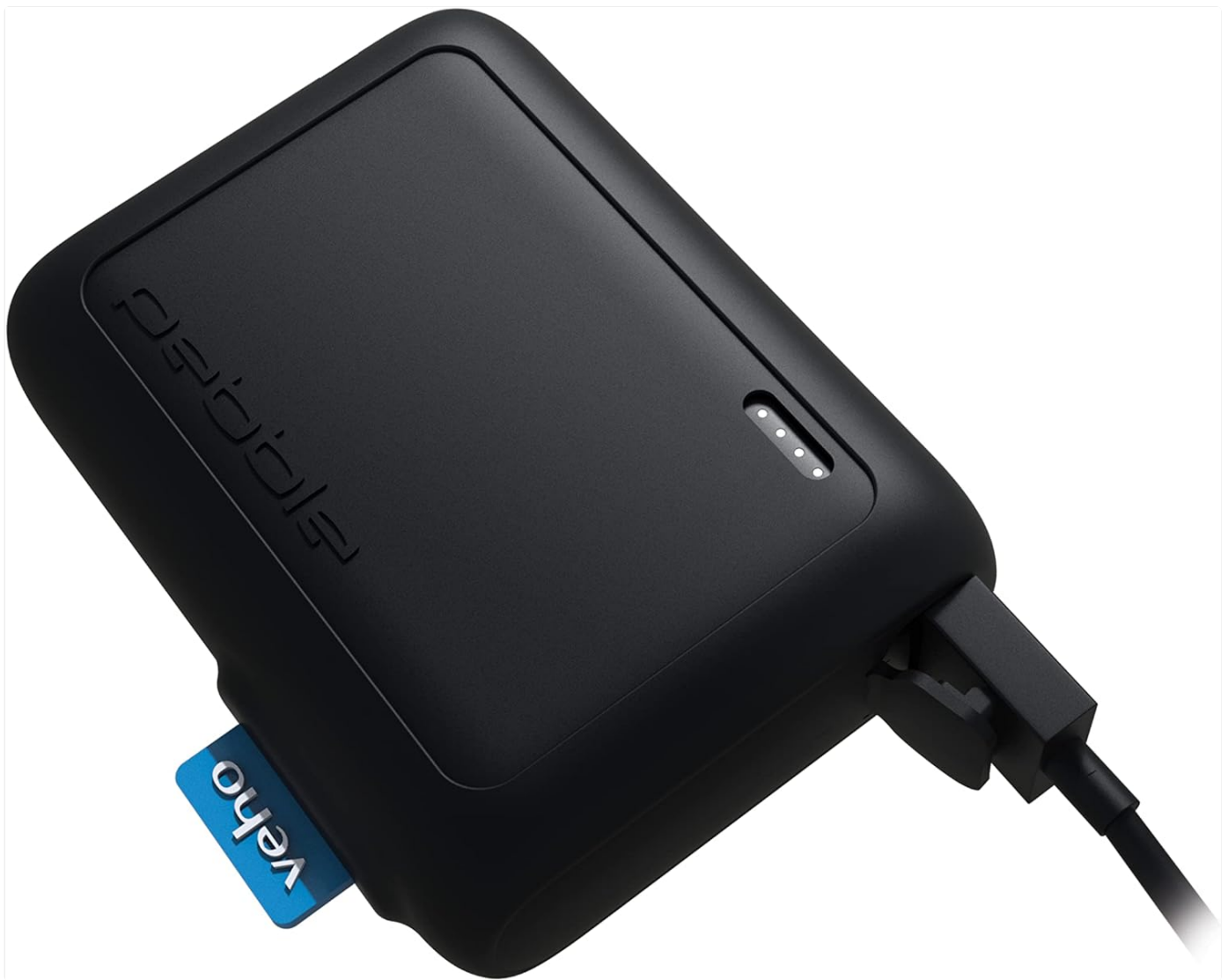
Image 3: The power bank connected to a USB-C charging cable, illustrating the charging process.