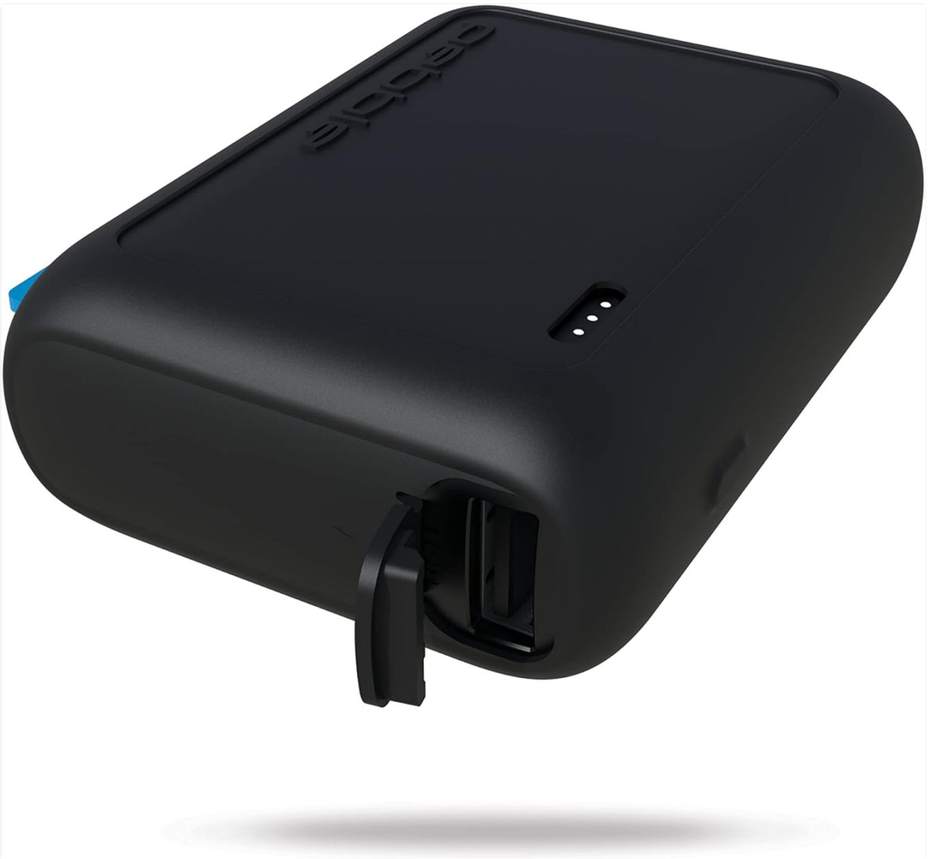
Image 2: Side view of the power bank with the protective cover for the USB-C port open.

The Pebble PZ-12 features a robust design with a silicone outer sleeve for shock and splash protection. It includes an integrated LED indicator to display the remaining power and charging status. The universal USB-C Power Delivery (PD) port supports both input and output for fast charging.