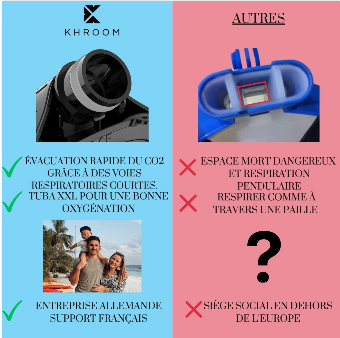
Image: A close-up view of the Khroom Seaview Y snorkel mask, showing the snorkel tube being attached to the top of the mask.