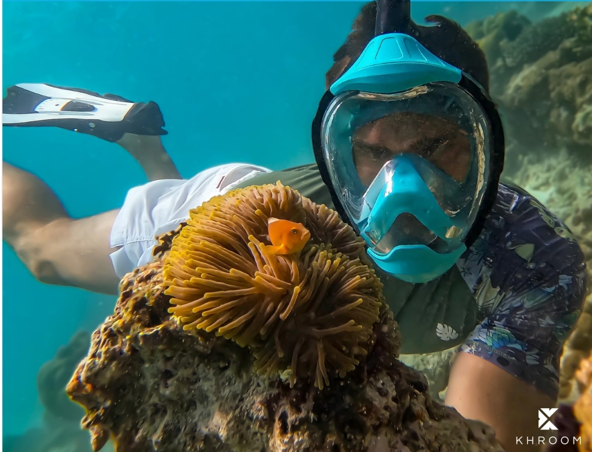
Image: A person wearing the Khroom Seaview Y full face snorkel mask, snorkeling underwater and observing marine life.

clients satisfaits depuis 2017. Merci de votre confiance