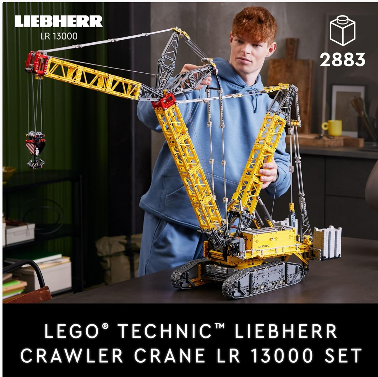
Image: The LEGO Technic Liebherr Crawler Crane LR 13000 during assembly, highlighting its impressive size and detail.