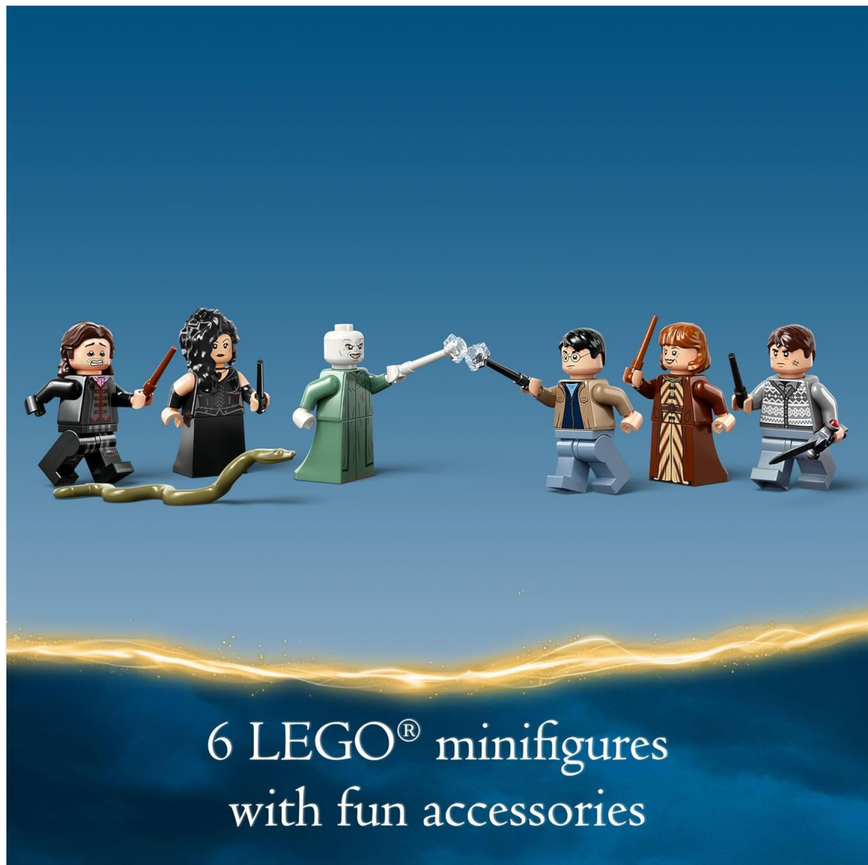
Image 4: The six included LEGO minifigures (Harry Potter, Voldemort, Neville Longbottom, Scabior, Molly Weasley, Bellatrix Lestrange) and the Nagini figure, each equipped with their respective wands and accessories.

Minifigures such as Harry Potter and Voldemort come with wands and attachable LEGO elements to simulate spell-casting effects. Neville Longbottom is equipped with the Sword of Gryffindor, allowing for the recreation of key moments, such as confronting Nagini.