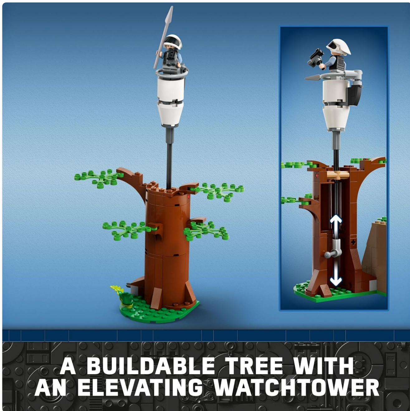
Image: The buildable tree featuring an elevating watchtower, illustrating its vertical movement for scouting or defensive positions.