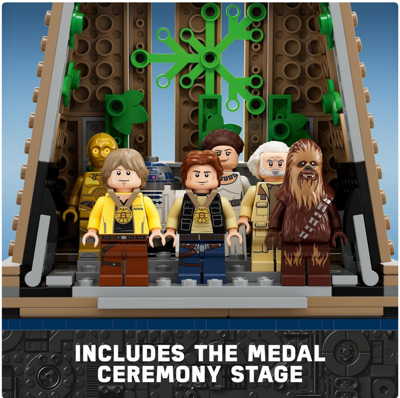
Image: The Medal Ceremony Stage, featuring minifigures of Luke Skywalker, Han Solo, Princess Leia, and other characters, ready for the iconic ceremony.