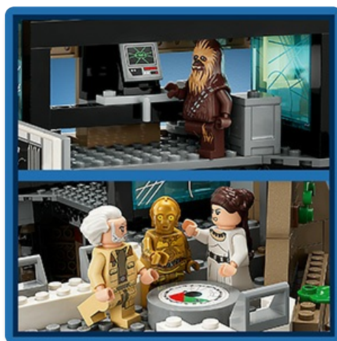
Image: A detailed shot of the command room within the Yavin 4 Rebel Base, showing Chewbacca operating a console and other minifigures interacting with the rotating hologram table.