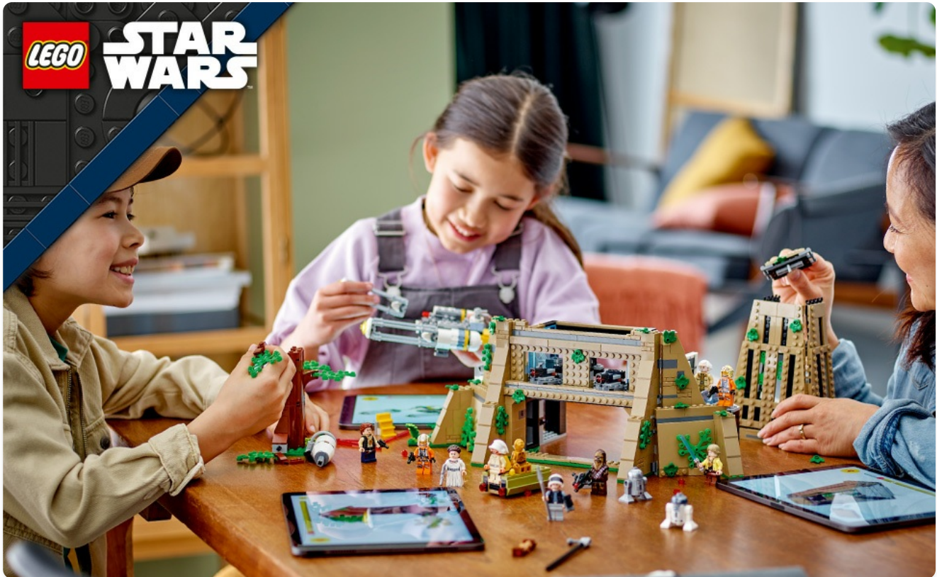
Image: Children engaged in building the Yavin 4 Rebel Base, utilizing the LEGO Builder app on tablets for digital instructions.

Your browser does not support the video tag.