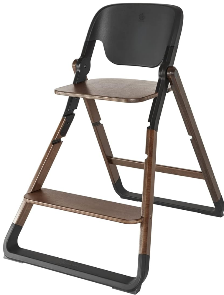
Figure 3: The high chair mode, ready for use with infants.