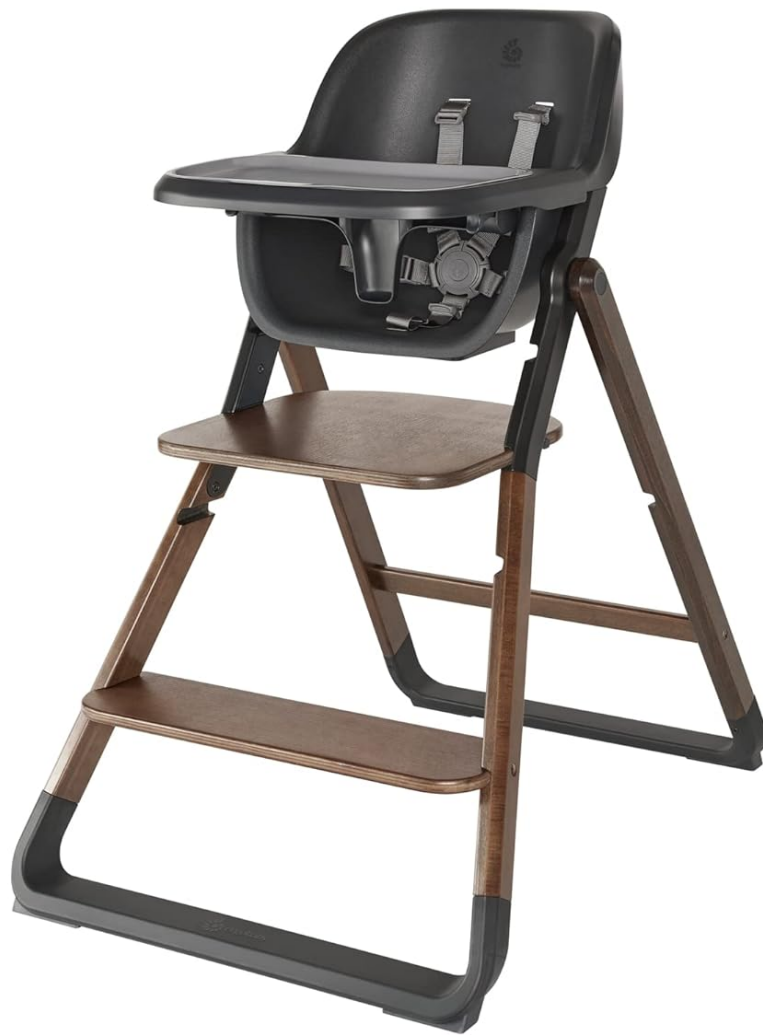
Figure 1: Ergobaby Evolve High Chair, Dark Wood model.