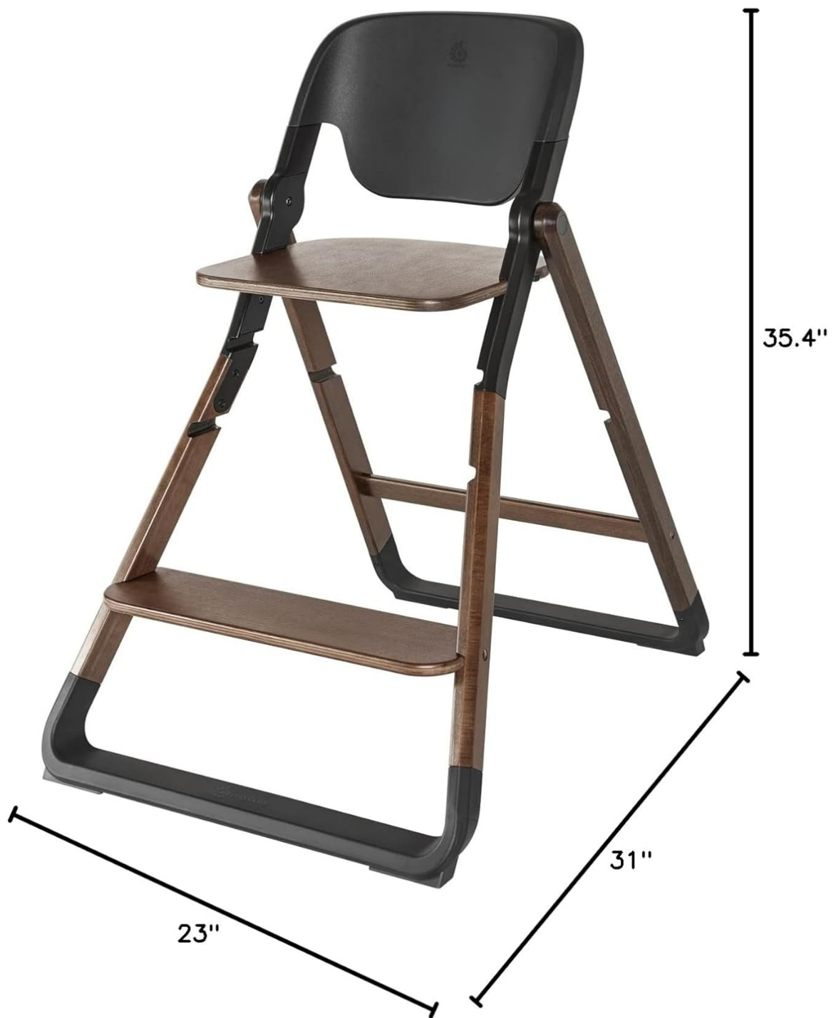
Figure 6: The high chair folds compactly for easy storage.