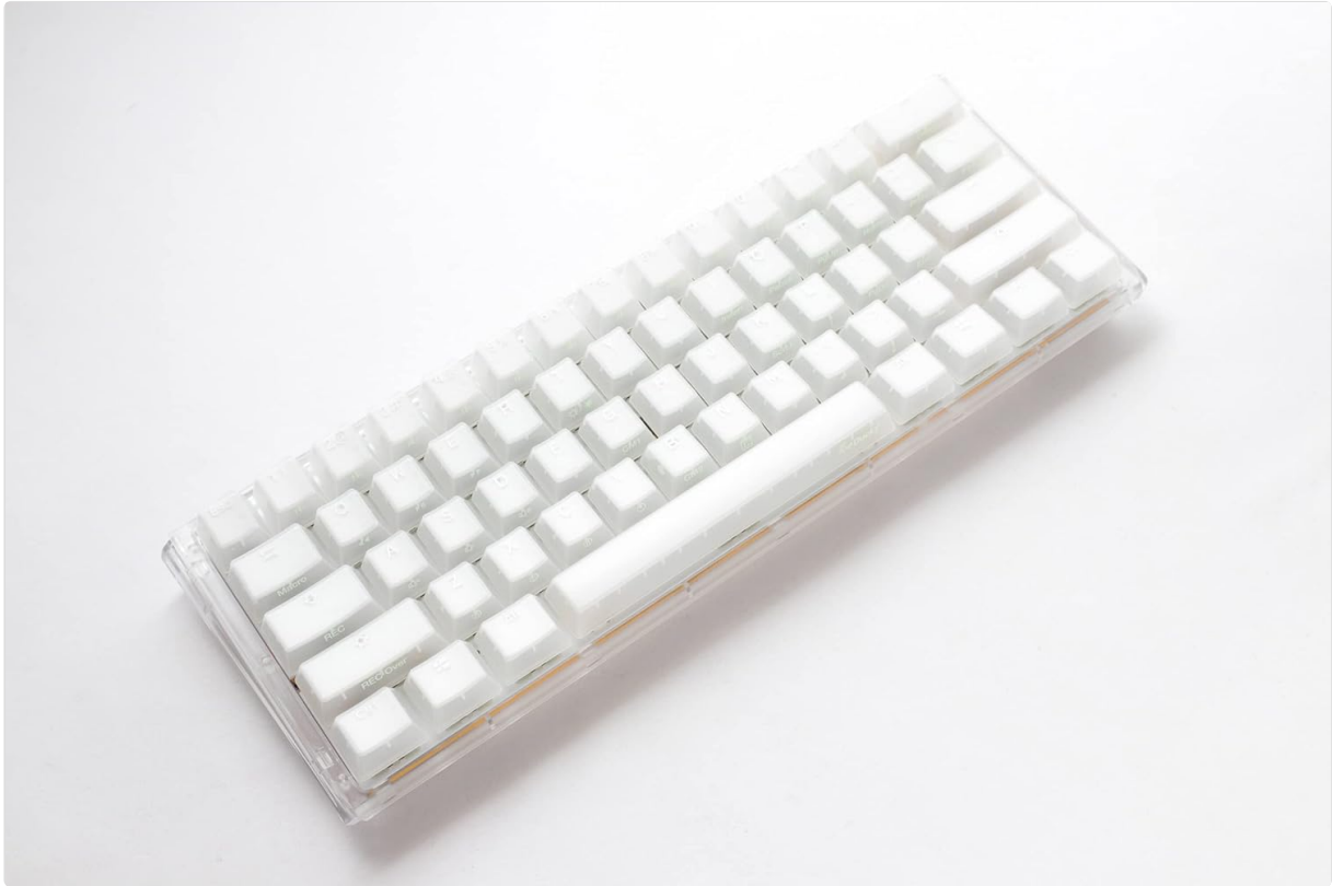
Image: A top-down view of the Ducky One 3 Mini Aura 60% mechanical keyboard, showcasing its compact layout and white keycaps.

The Ducky One 3 Mini Aura functions as a standard 60% mechanical keyboard. Refer to the keycap legends for primary functions. Secondary functions are typically accessed via the Fn key combination.