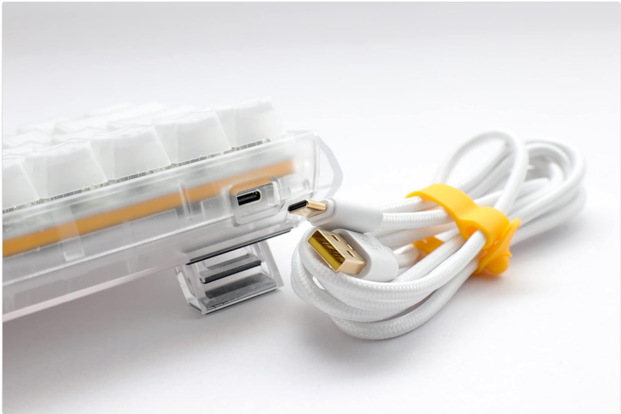
Image: The Ducky One 3 Mini Aura keyboard connected to its detachable USB-C cable.